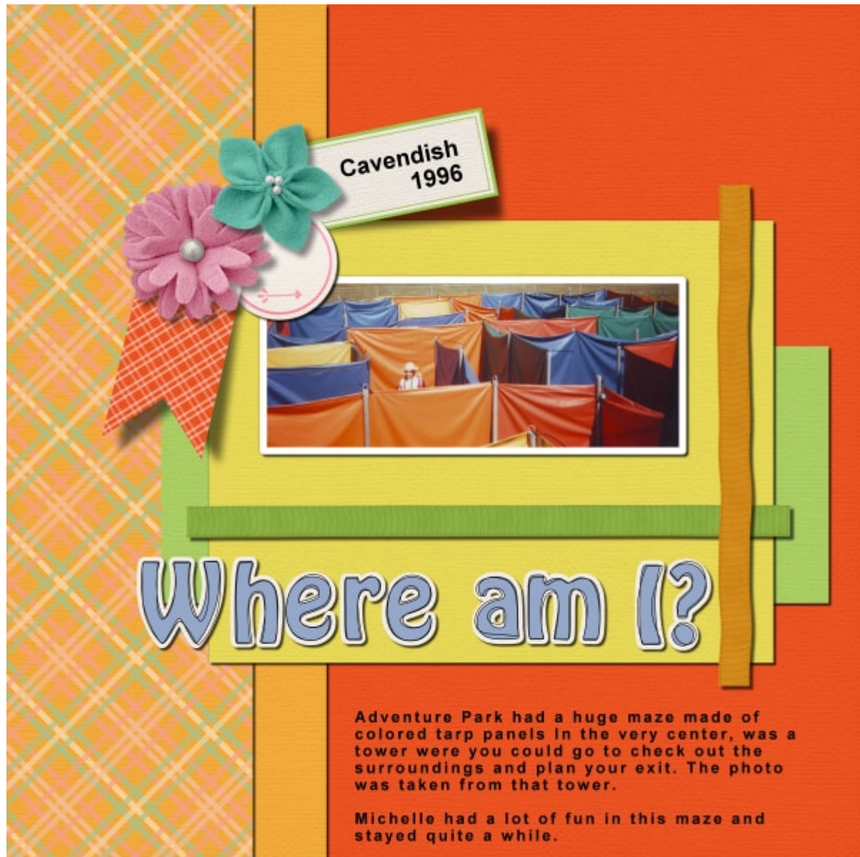
Layout by Cassel