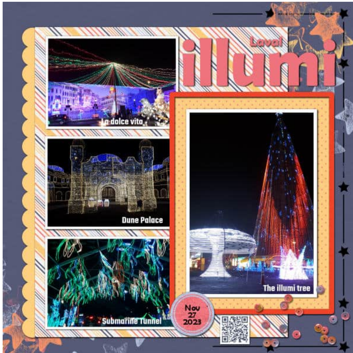
Layout by Cassel

During such events, there might be a logical sequence of activities but that is not always the case. If you find the activity has a beginning, a middle, and an end, you can document them. For example, arriving at the park, during rides, and when leaving with balloons in hand.