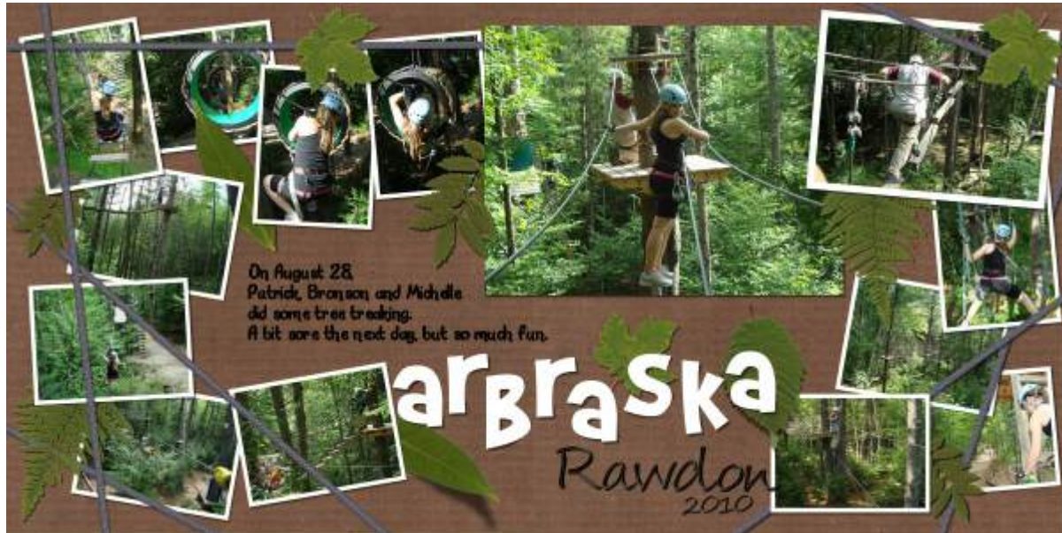
Layout by Cassel