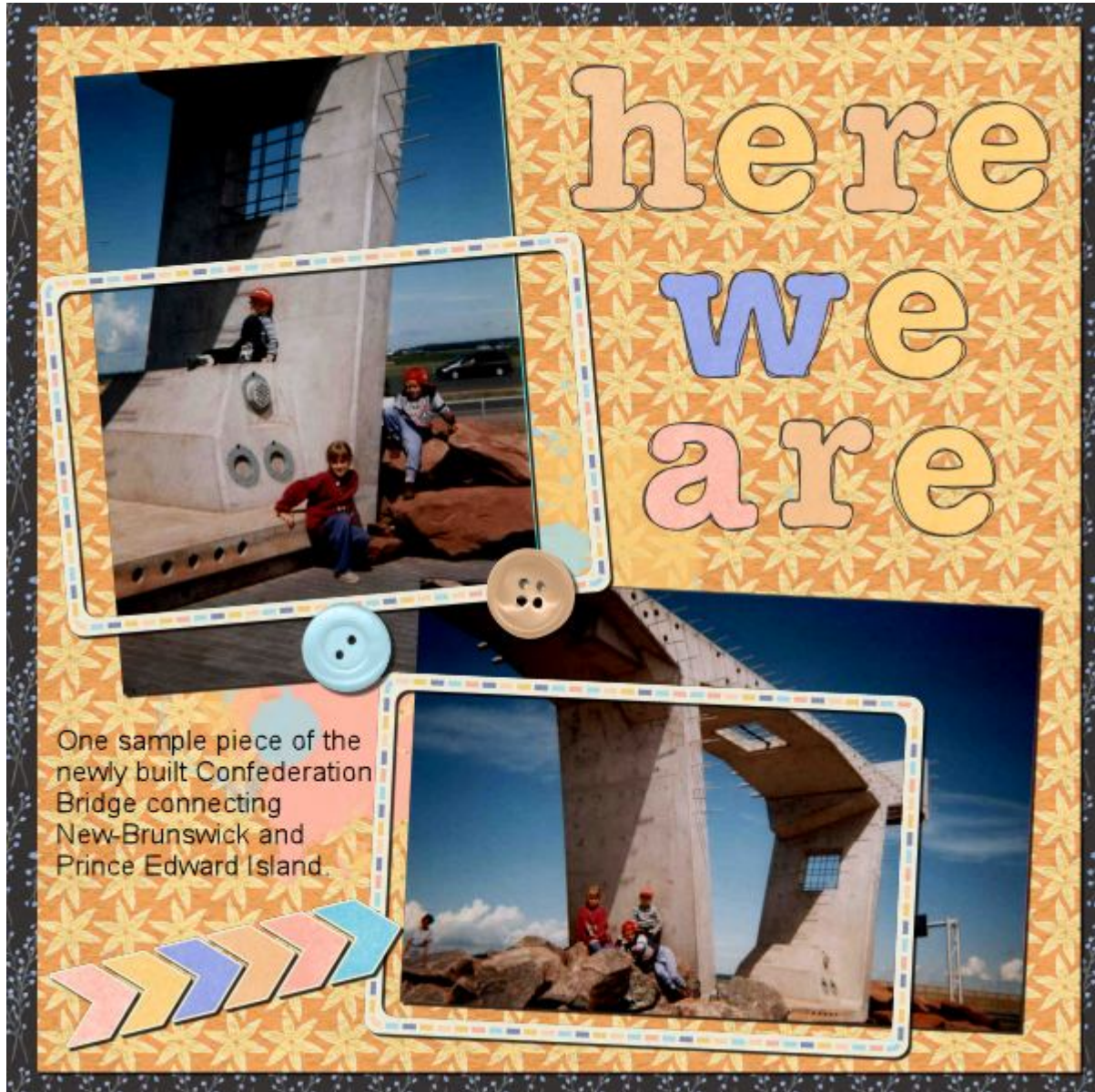
Layout by Cassel

Then, another day of the week meant another activity.