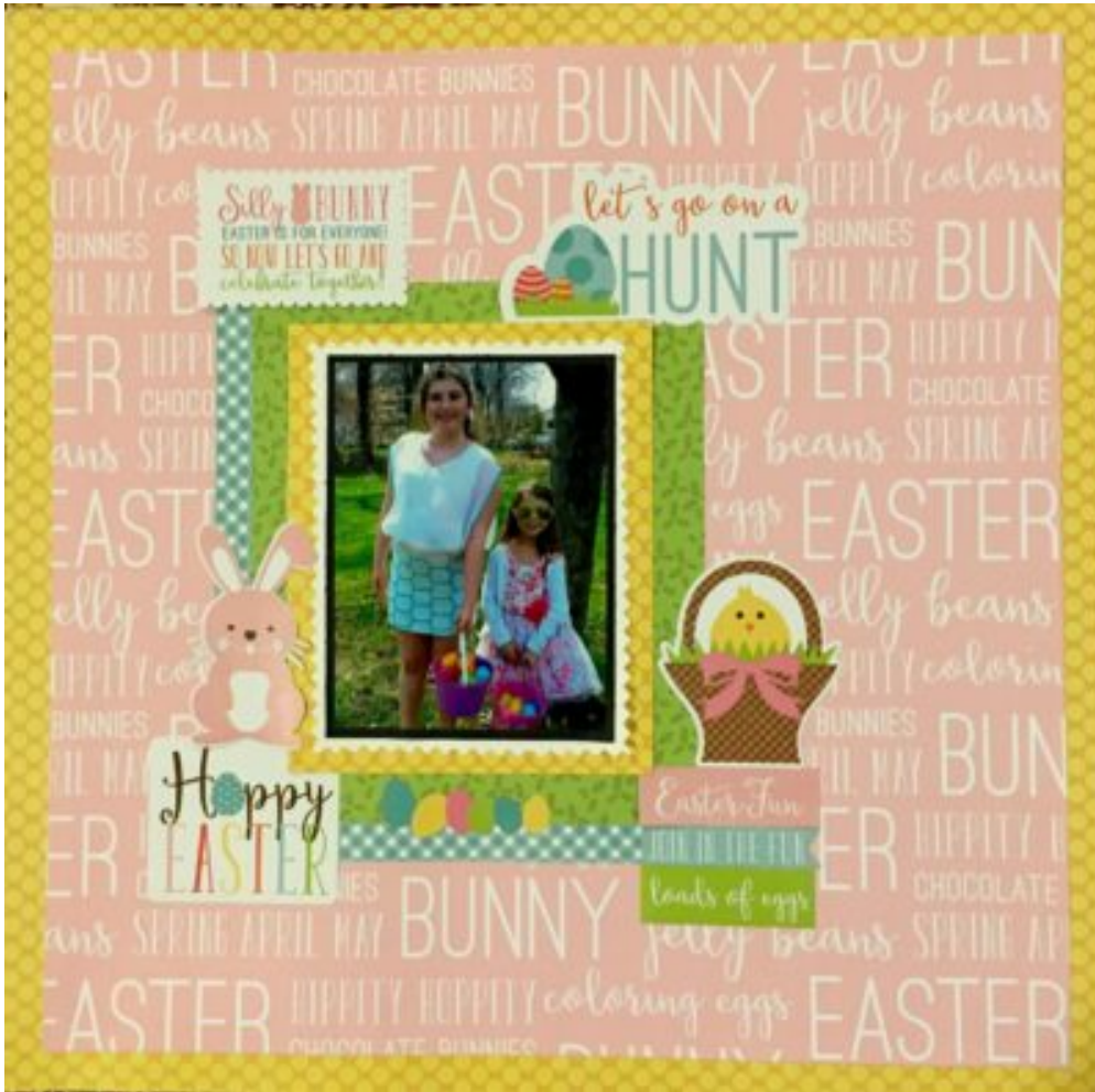
Layout by GrammyScrapper