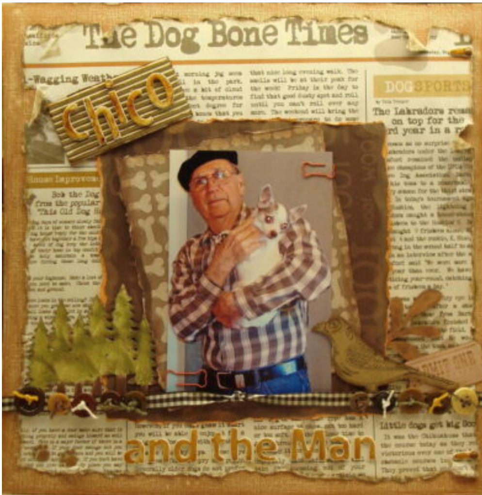
Page by Dnurse