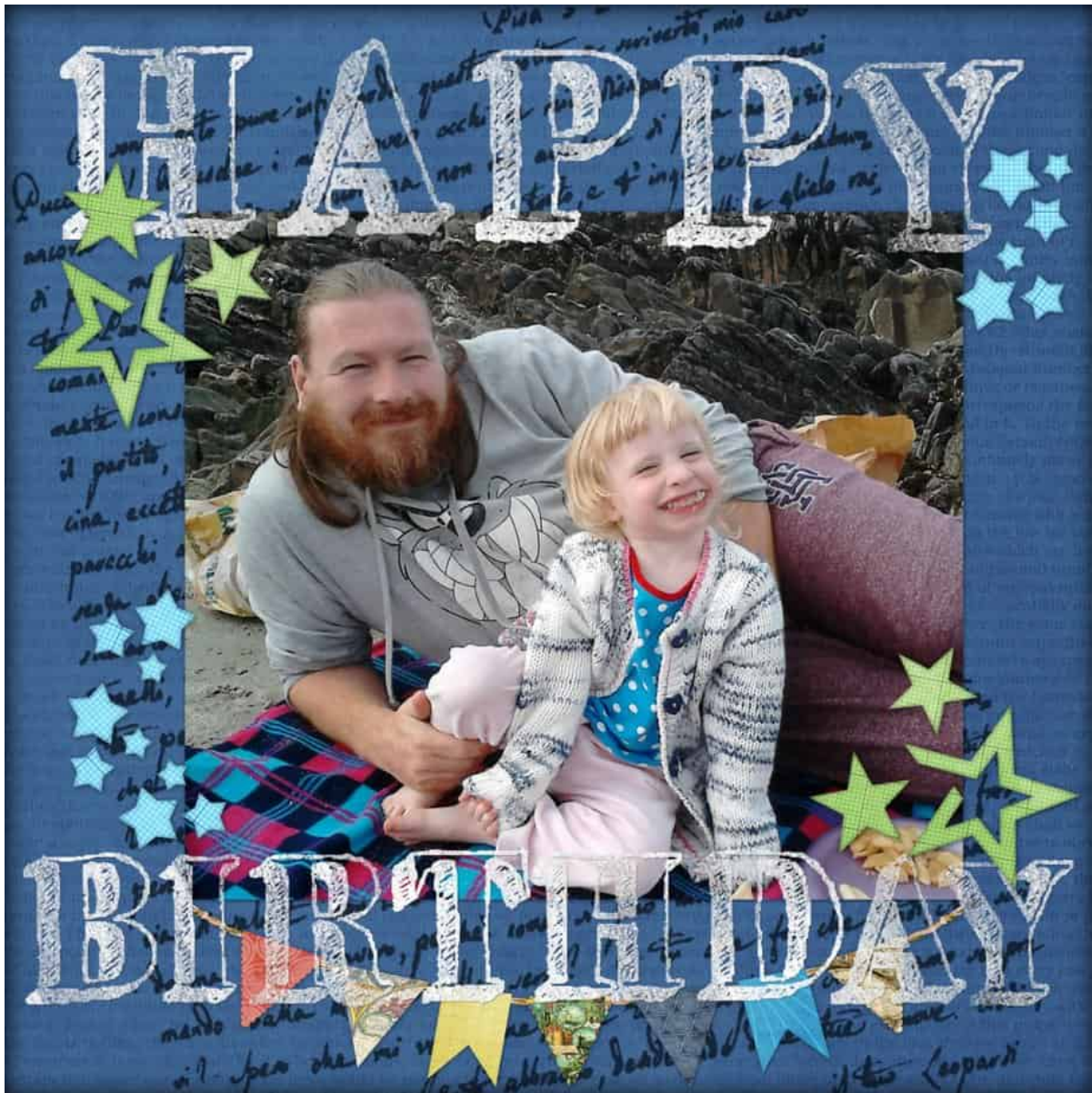
Layout by Kathie Gray