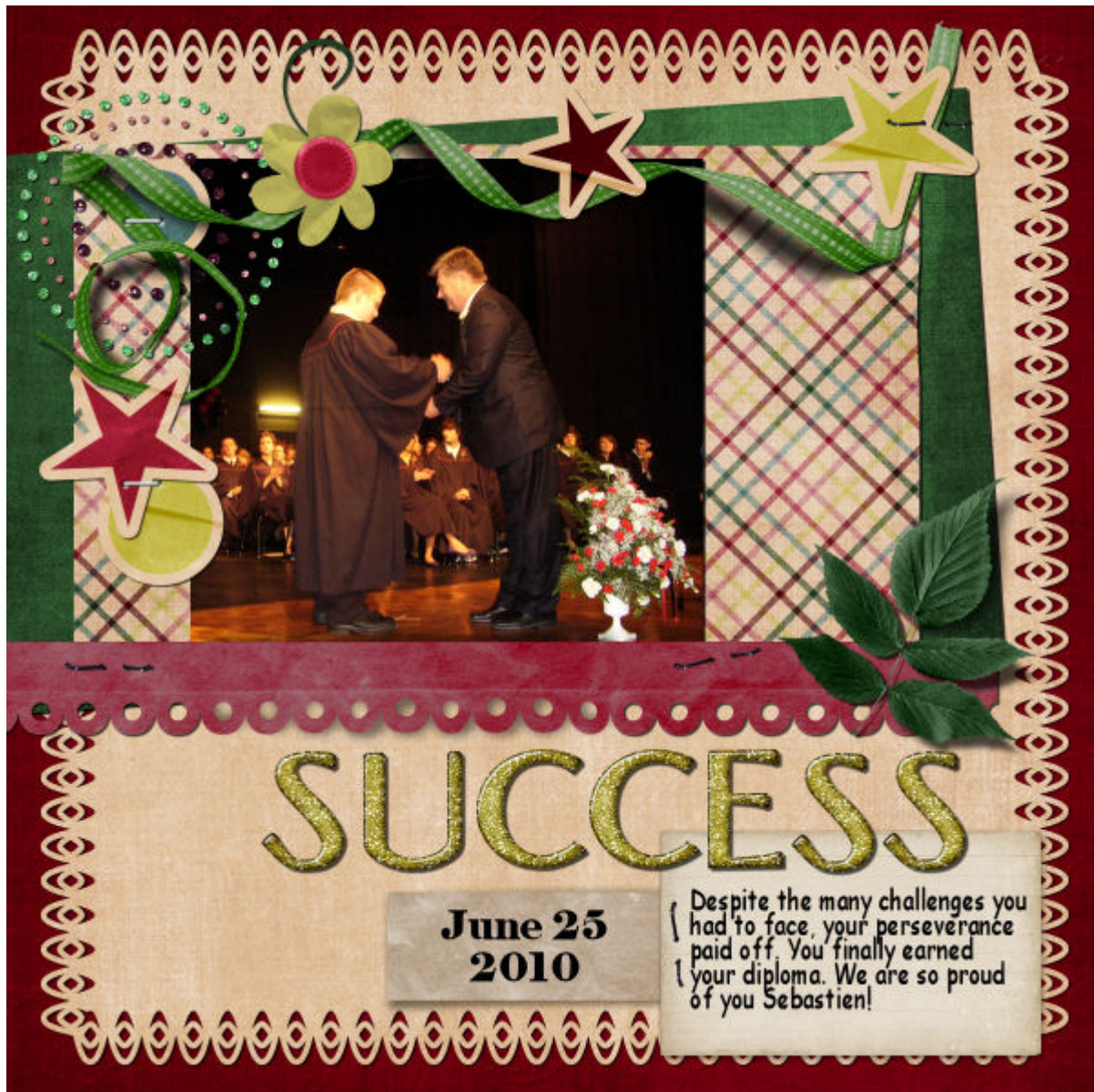
Layout by Cassel

Although it can be something very obvious, you can also choose a word that has a different meaning, or that can hint to something else.