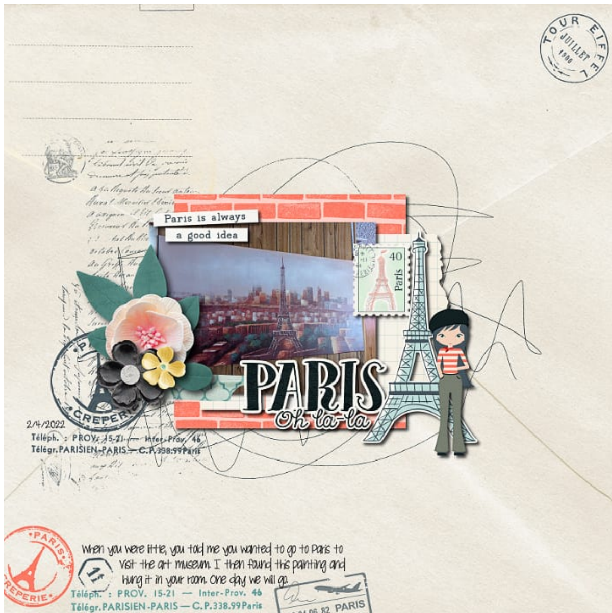
Layout from Ophie James