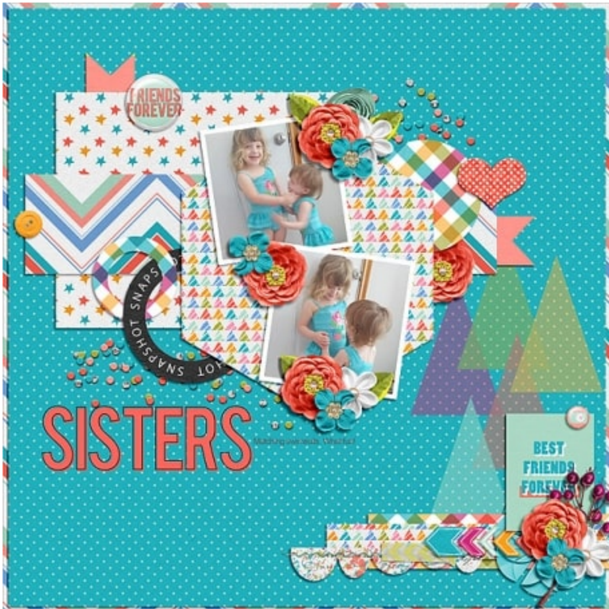
Layout by Beatrice Loren