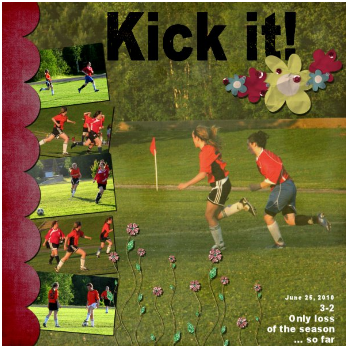
Layout by Cassel