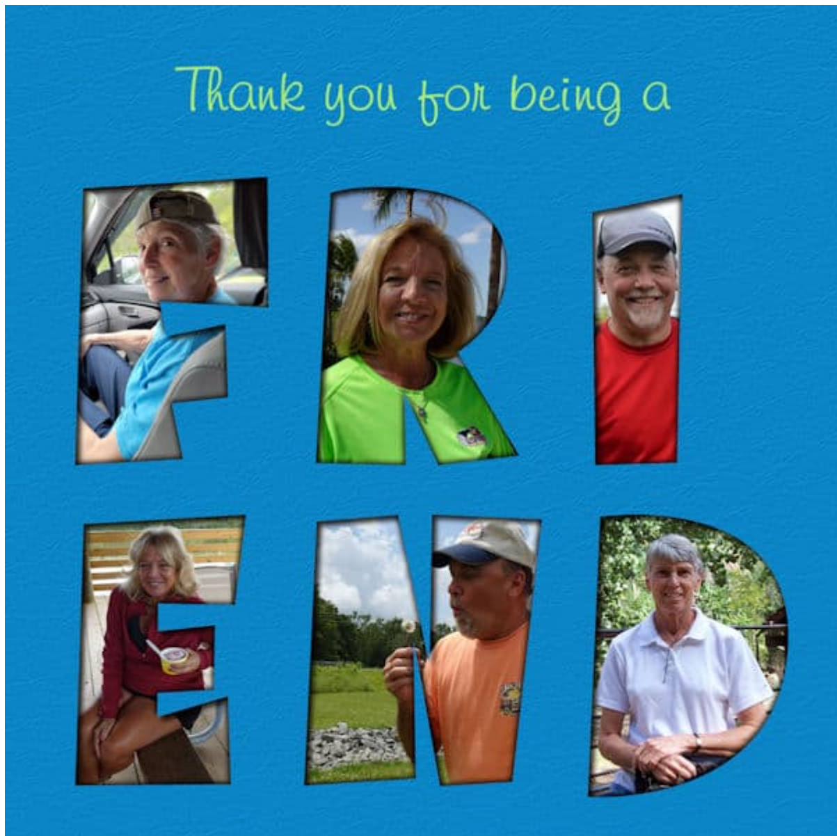
Layout from Bonnie Ballentine