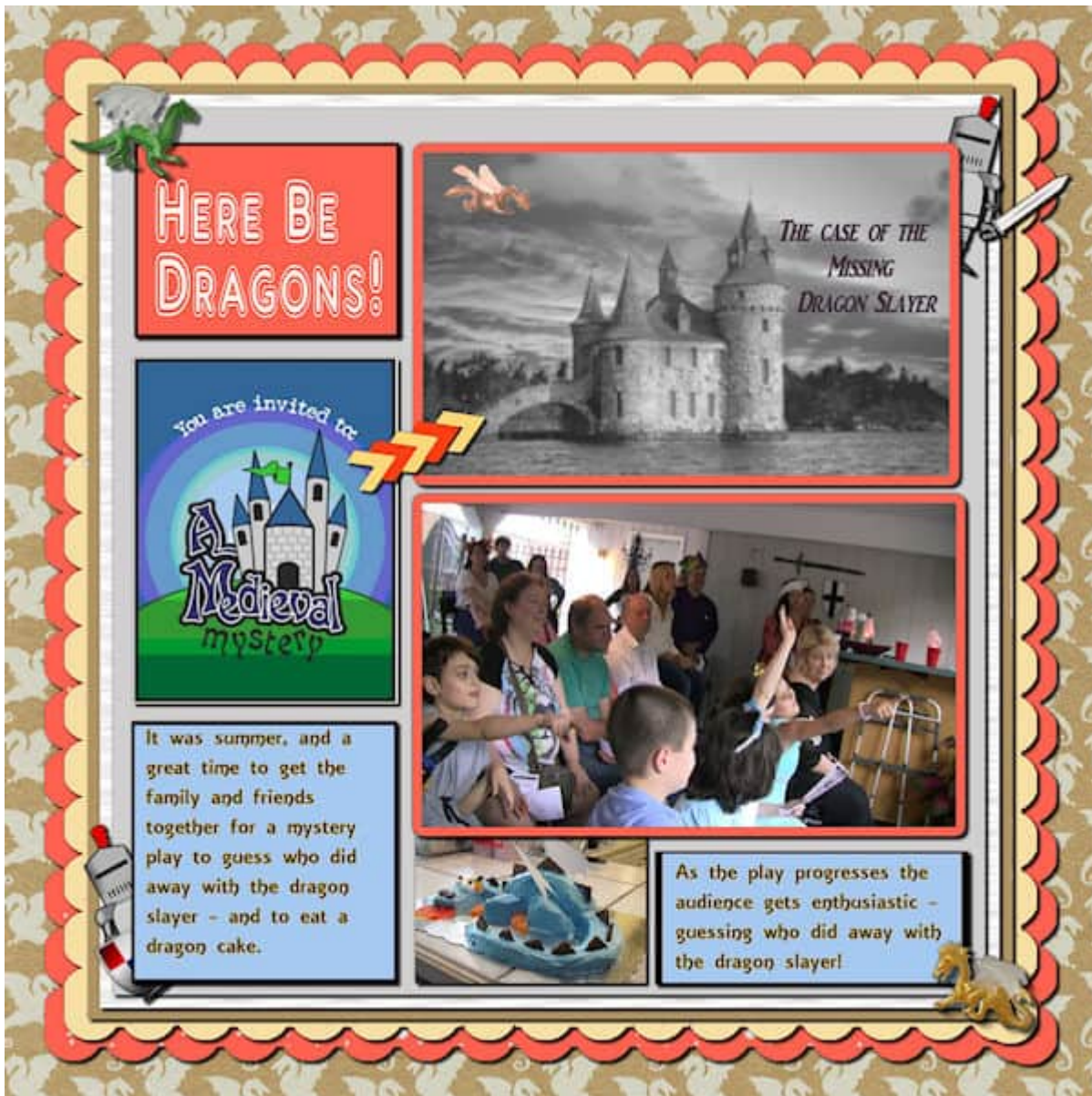
And finally, another project done recently.