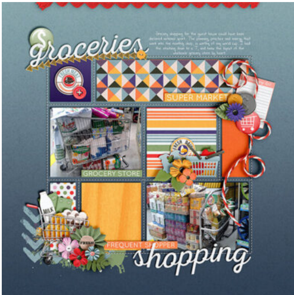
Layout by Christelle