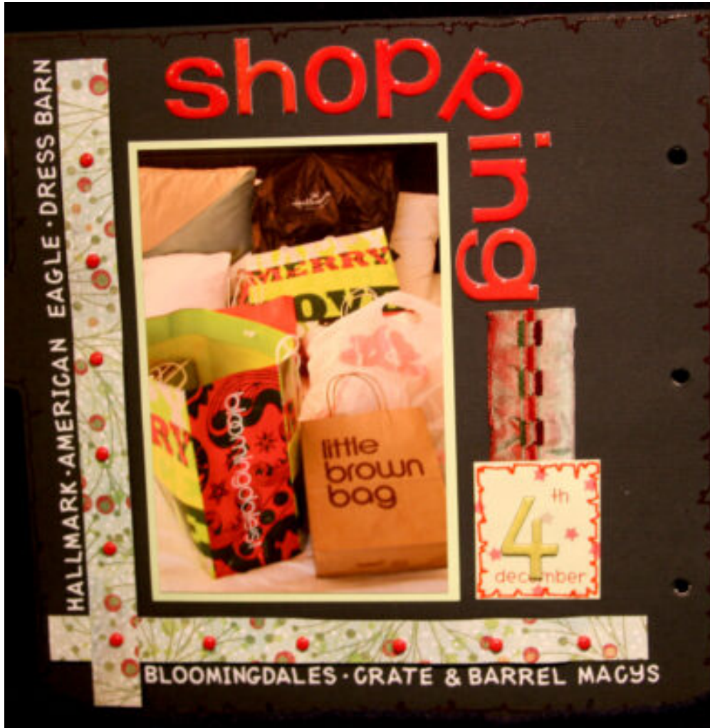
Layout by Rachel