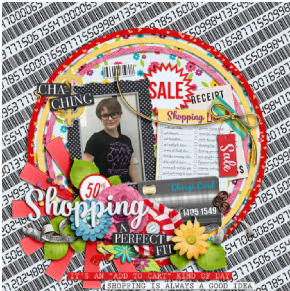
Layout by Neverland Scraps