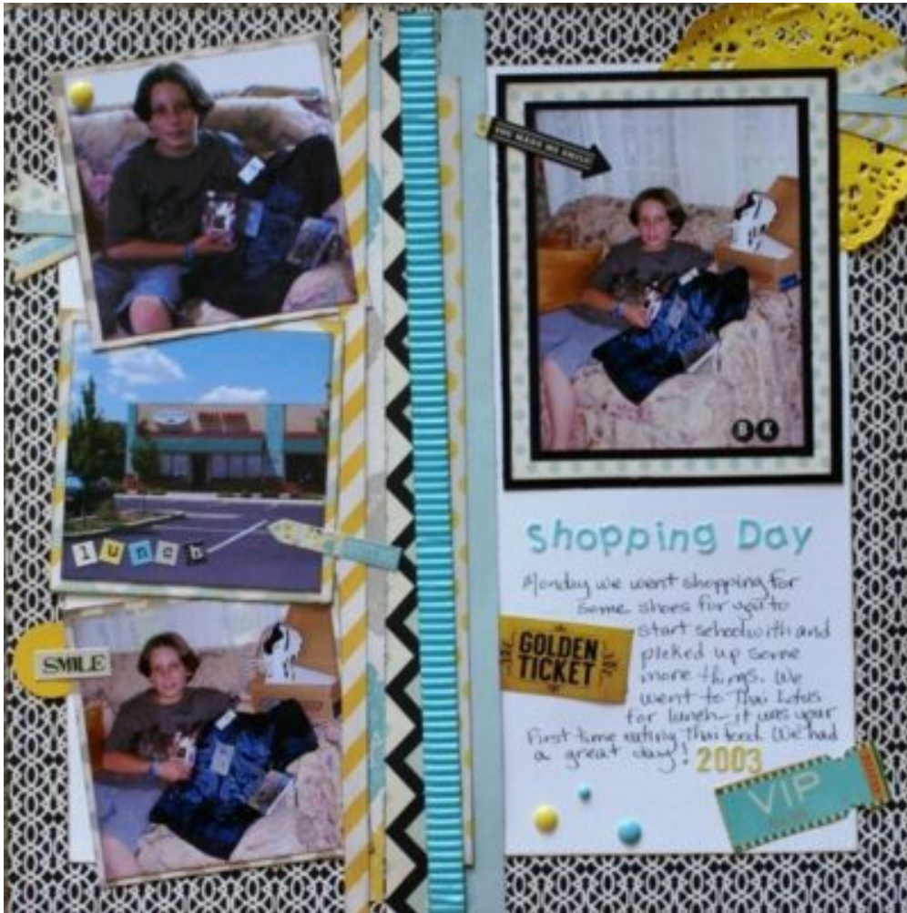
Layout by Susan