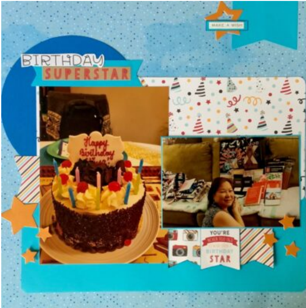
Project by LIS