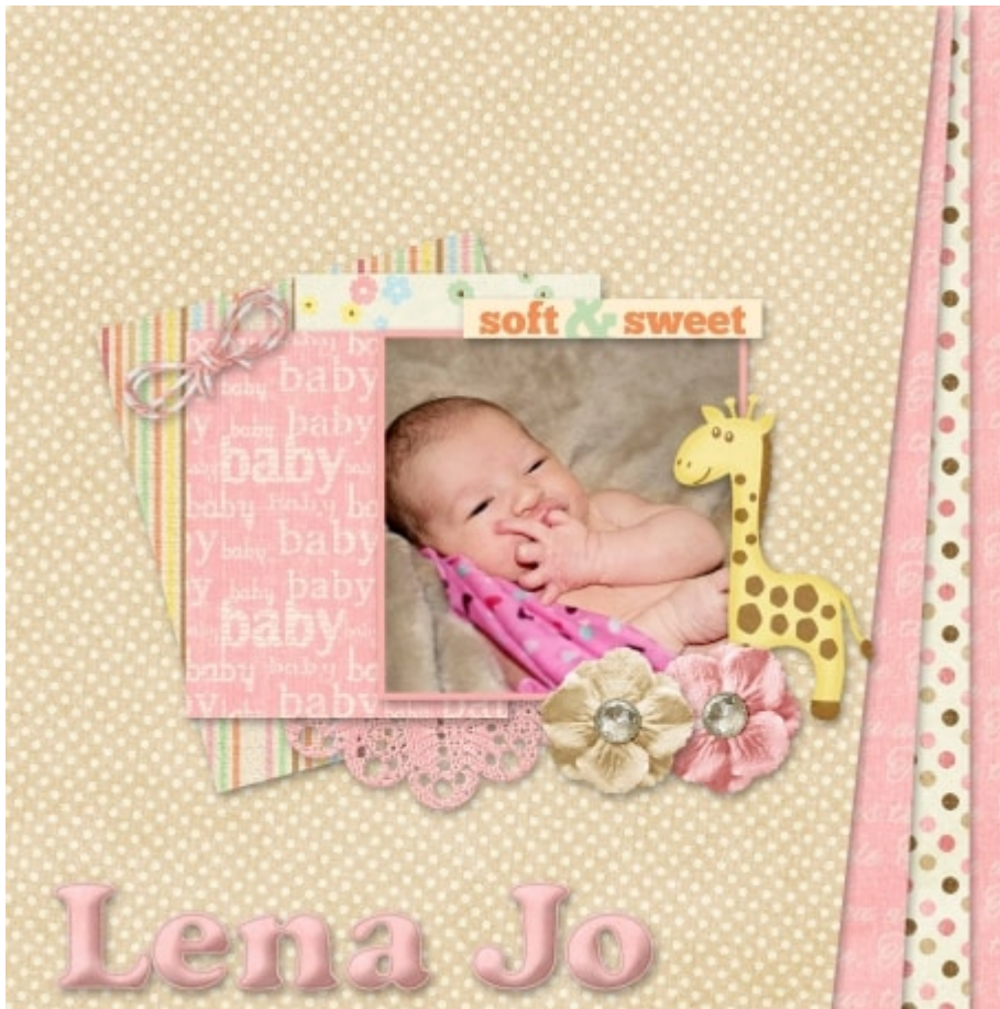
Layout by Christianna Hullihen