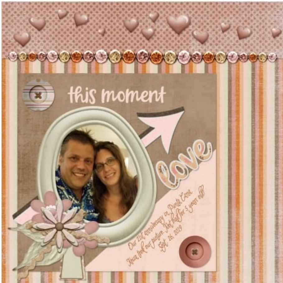
Layout by Shannon Maguire