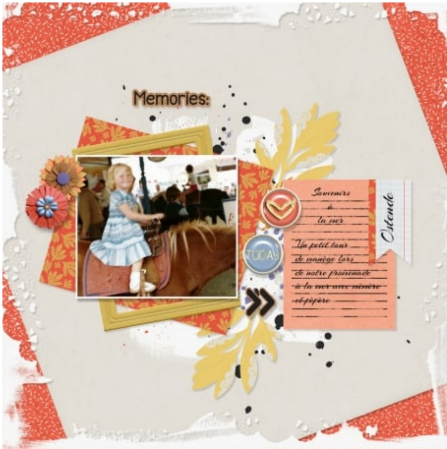
Layout by Bourico Casper

Other cards will have a blank area instead of lines. Again, it is up to you how you want to use that blank area, but adding text is surely expected.