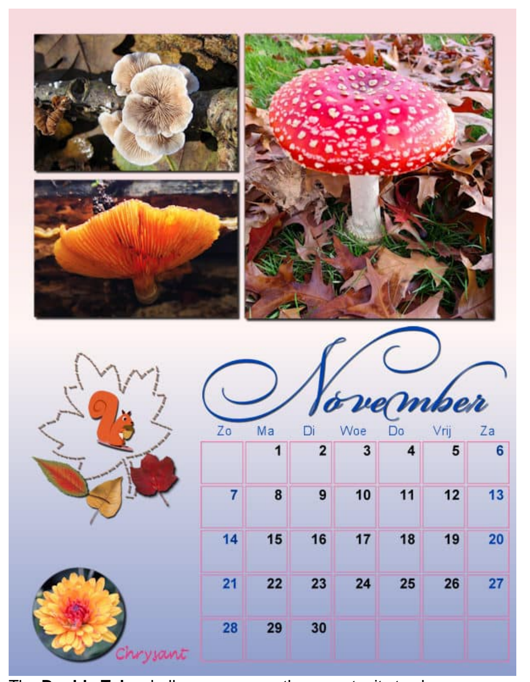
The Double Take challenge gave me the opportunity to showcase some great flowers photos.

During the Calendar challenge, I showcased some photos I took, and here is my November page.