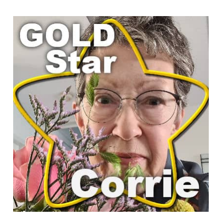
Gold Star - Corrie