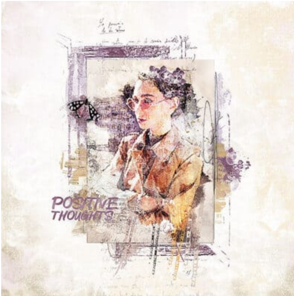
Layout by Marianne