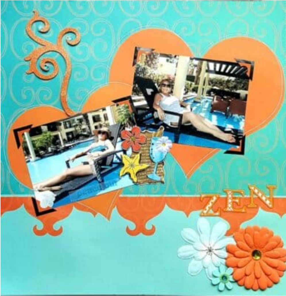
Layout by Vgrills