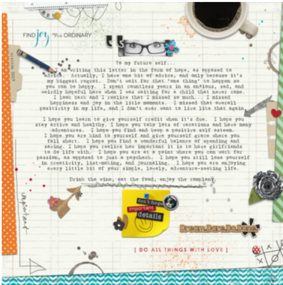
Layout by Heidi