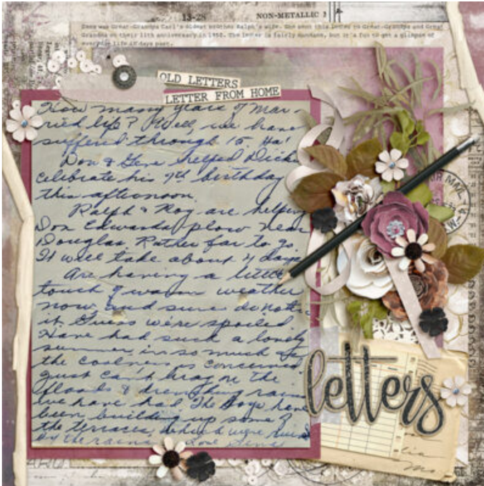
Layout by Tammy