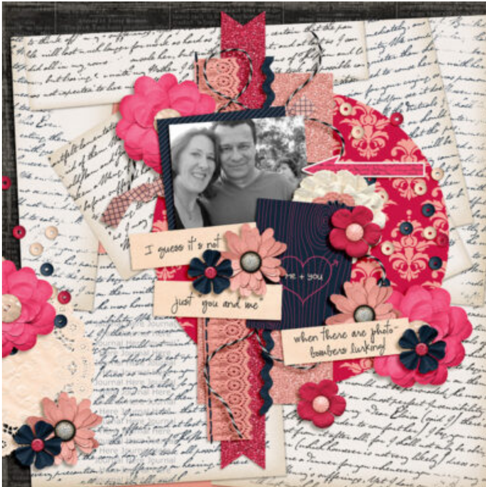
Layout by Tammy