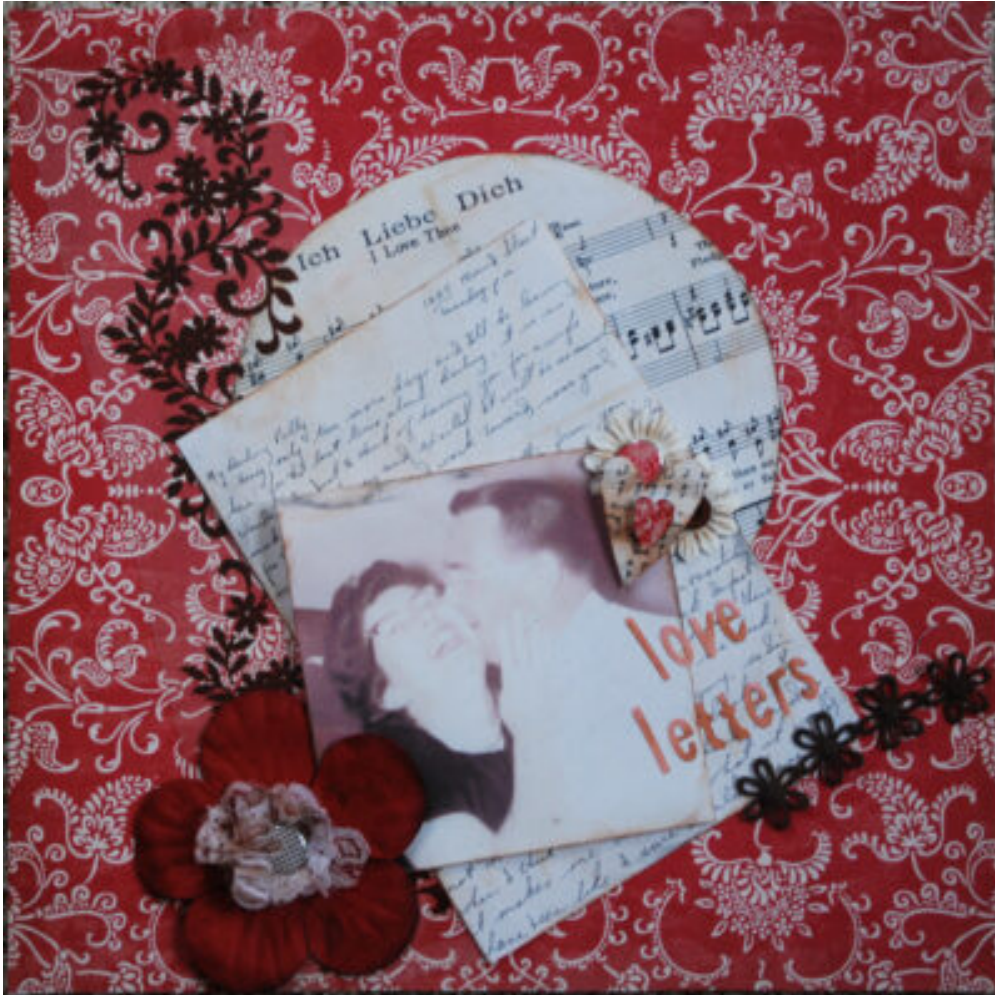
Layout by Jean