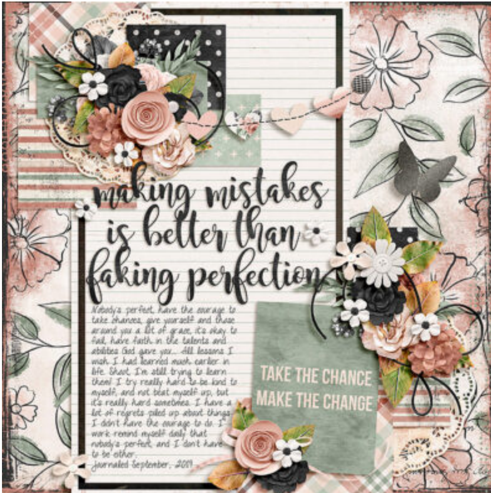
Layout by Tammy