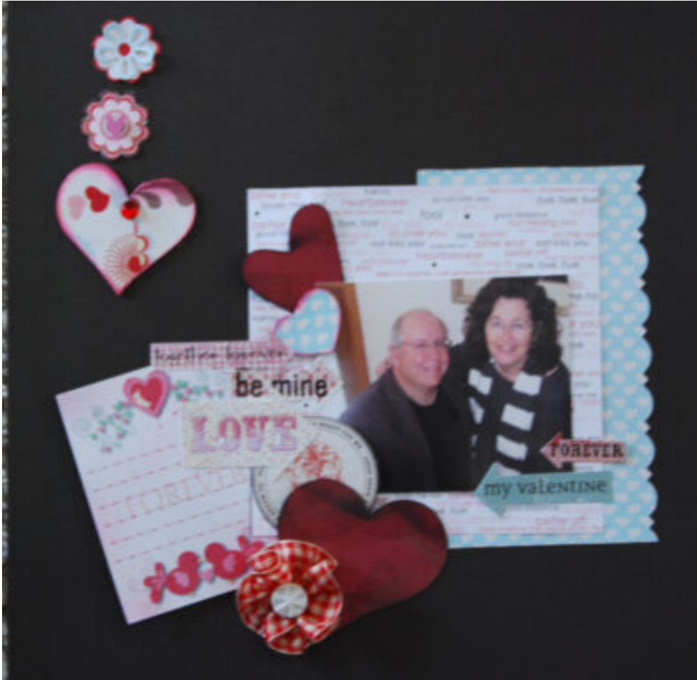
Layout by Jean