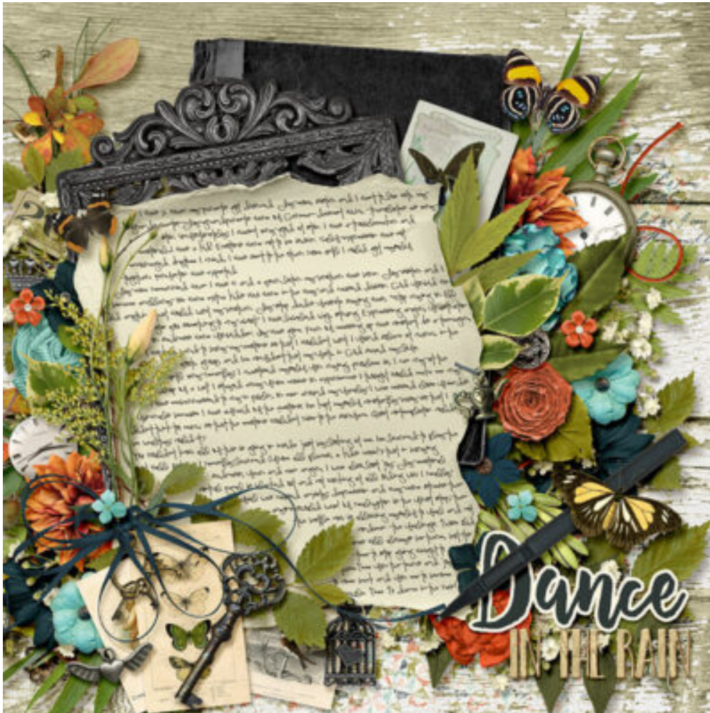
Layout by Tammy