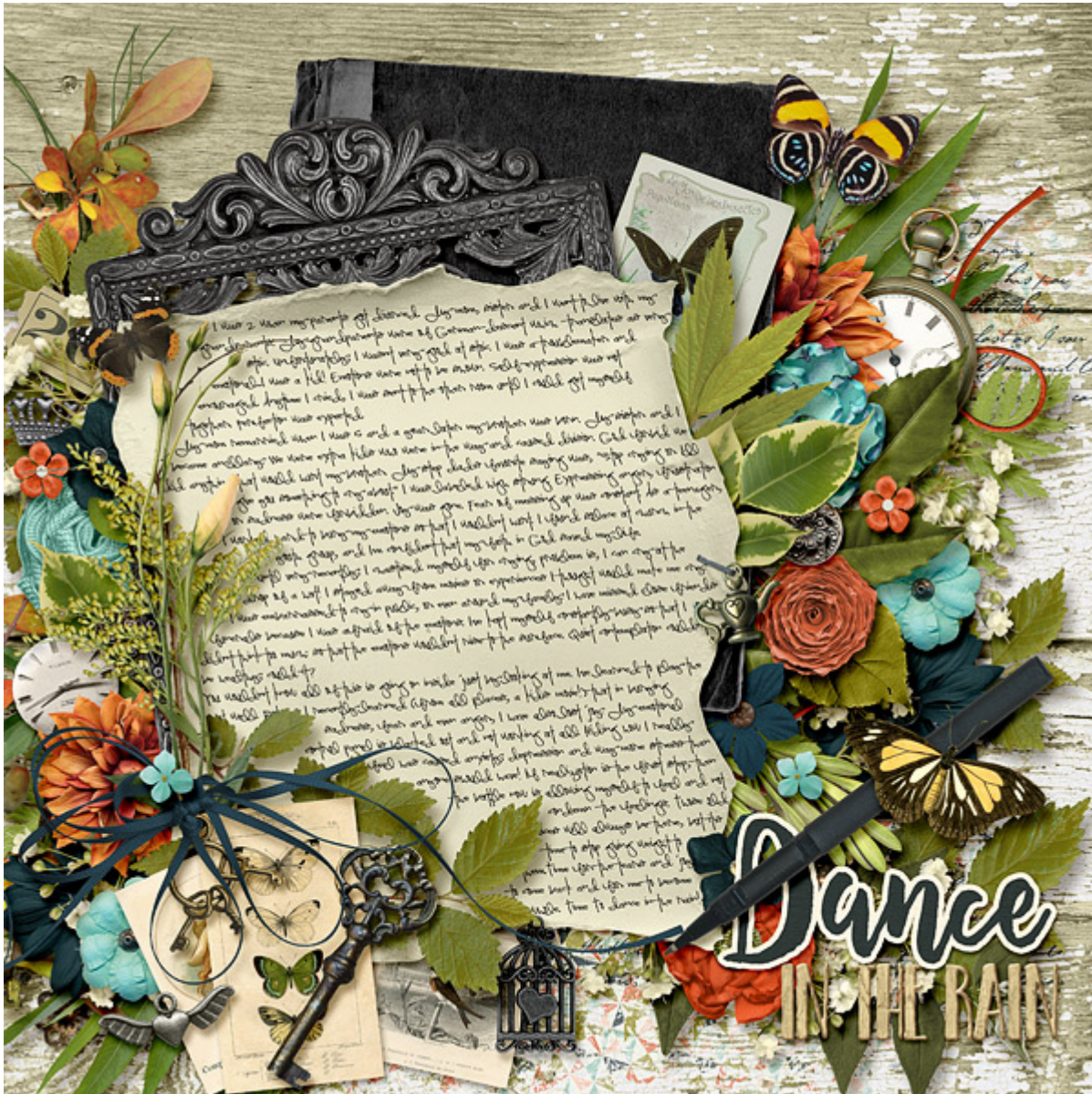
Layout by Tammy