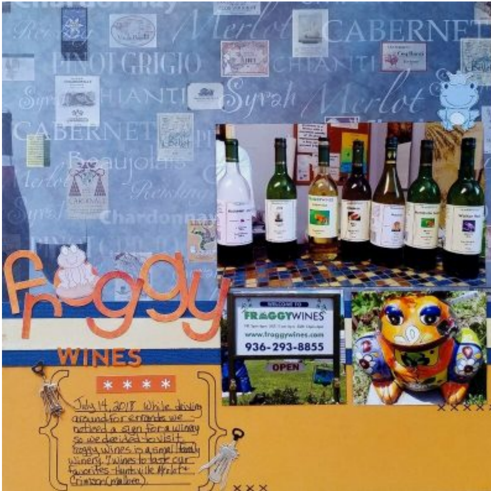
Layout by Susan