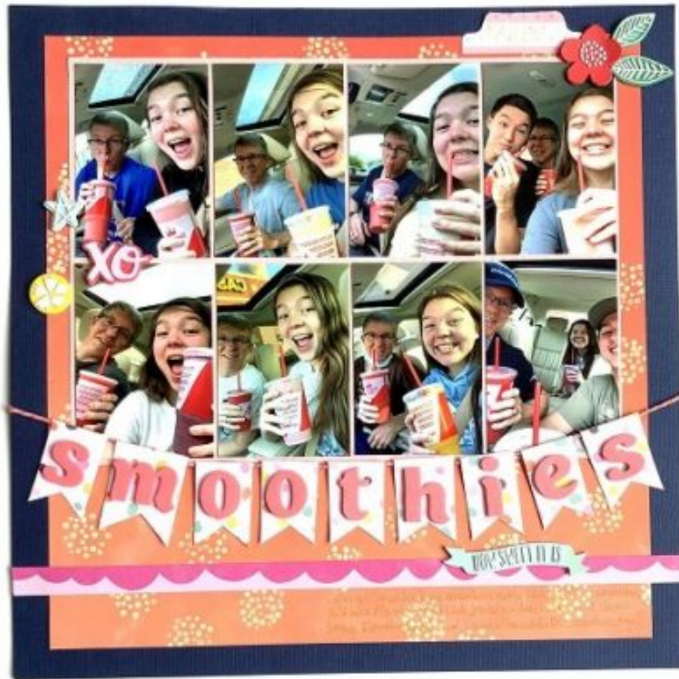
Layout by Cynthia