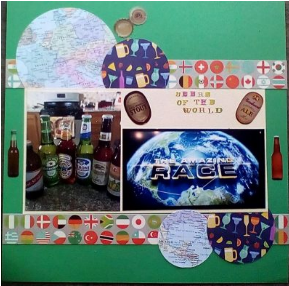
Layout by T-towngirl