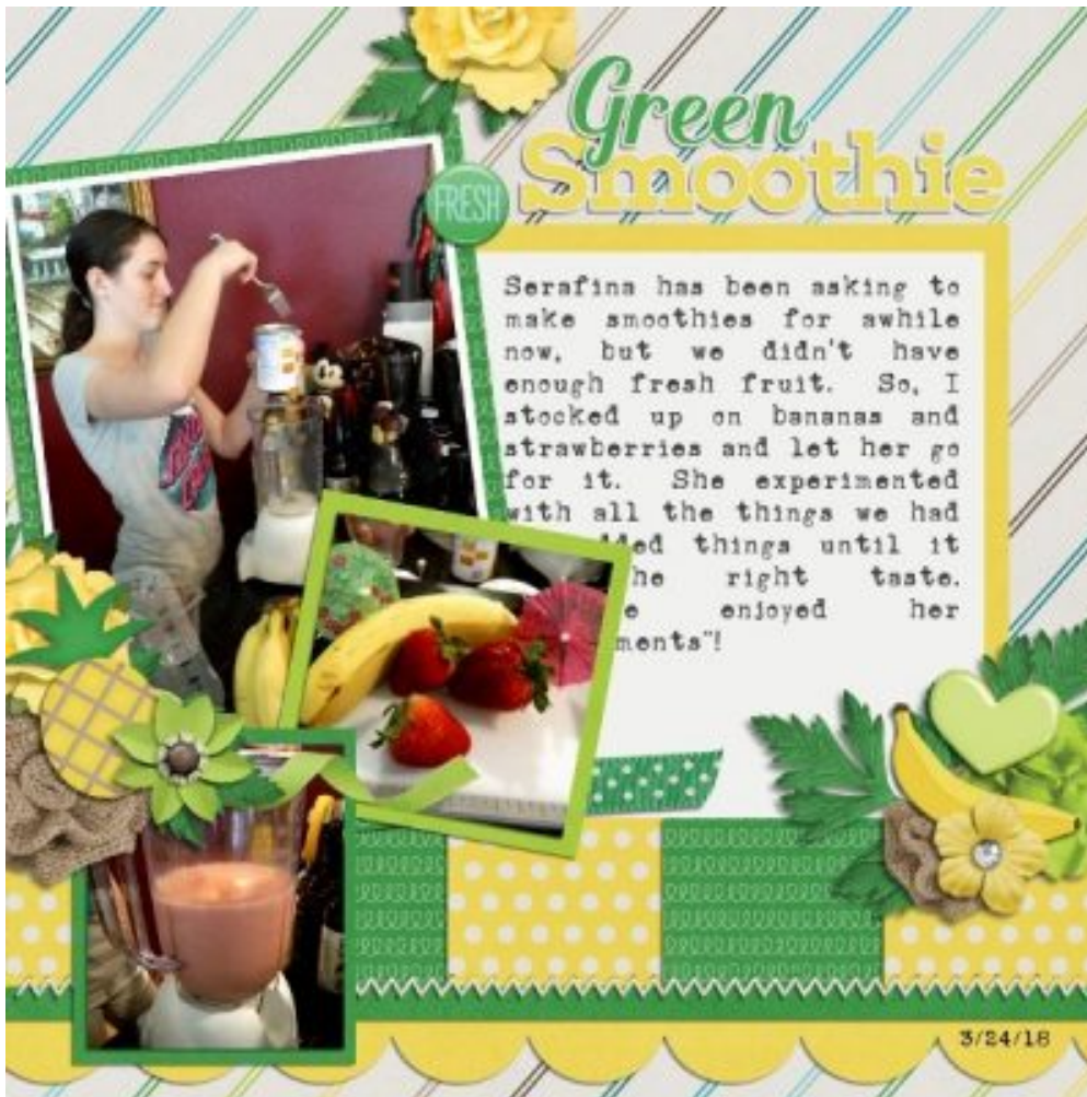
Layout by Meagan43