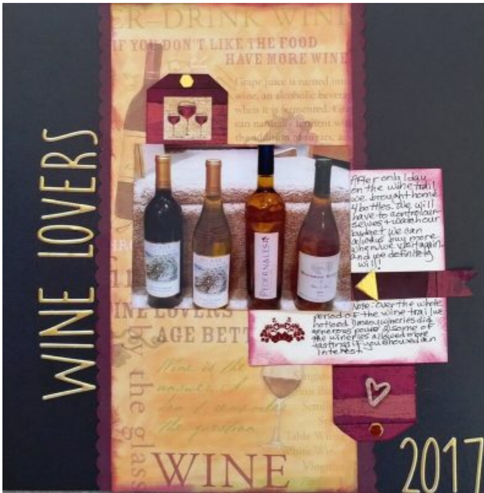
Layout by Susan