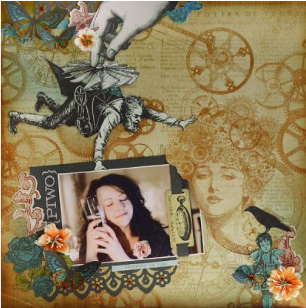
Layout by Agnieszka Posluszny