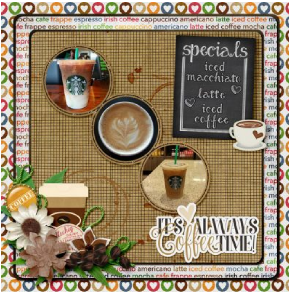
Layout by Betsyfru