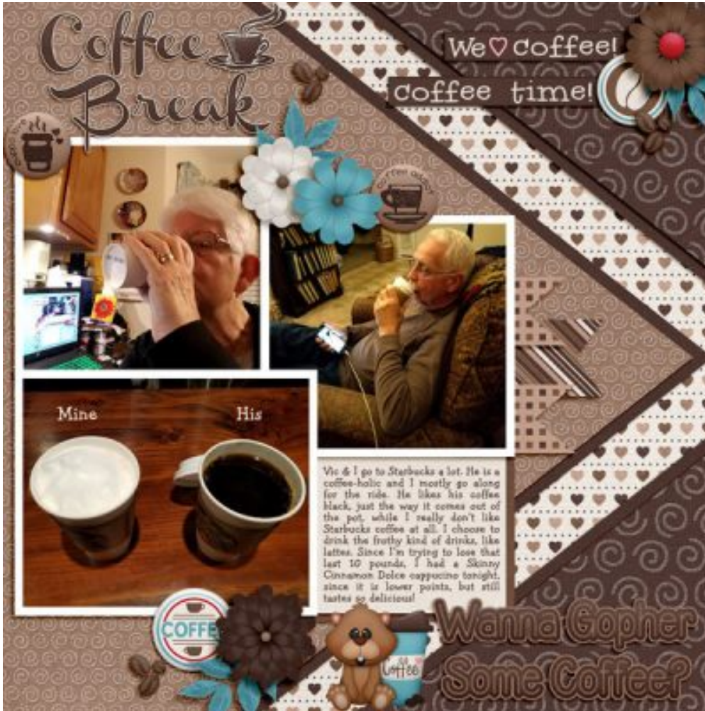
Layout by Betsyfru