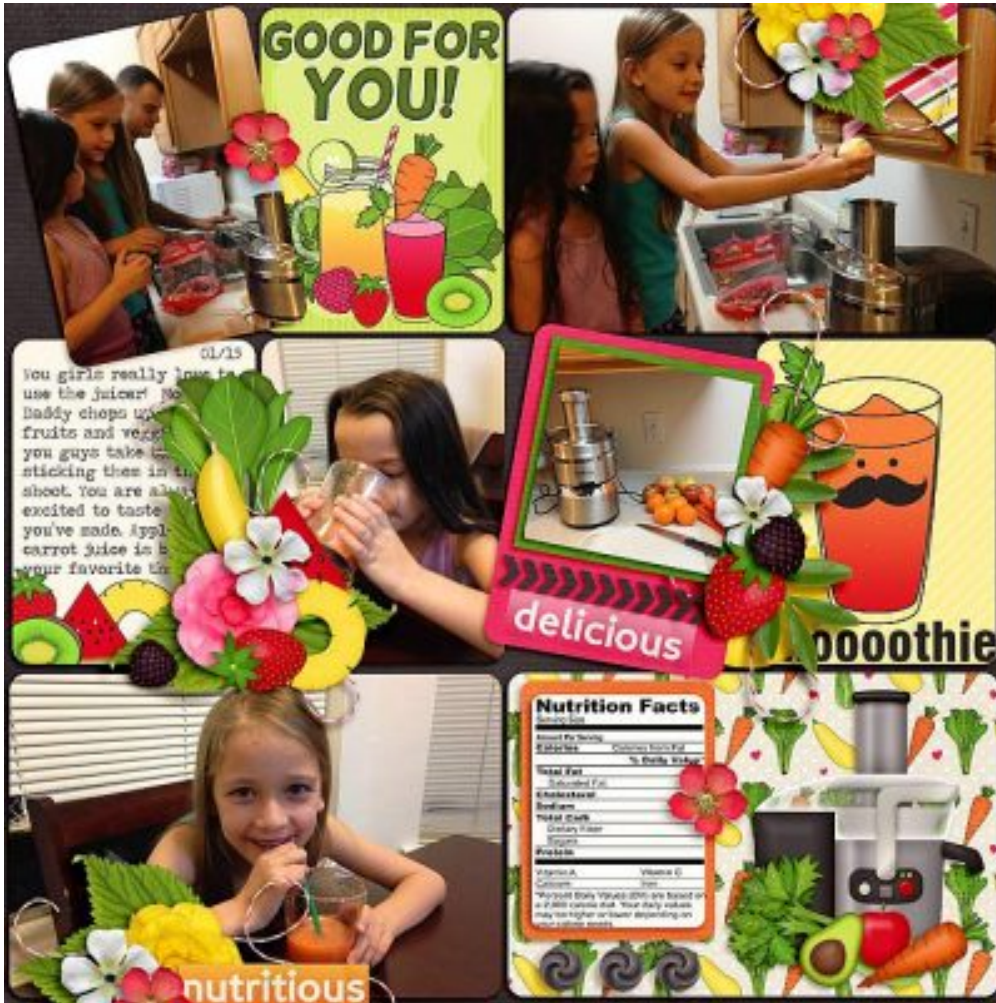
Layout by Cassie