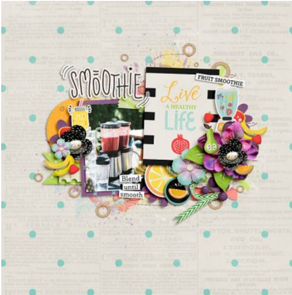
Layout by Shunnstergirl