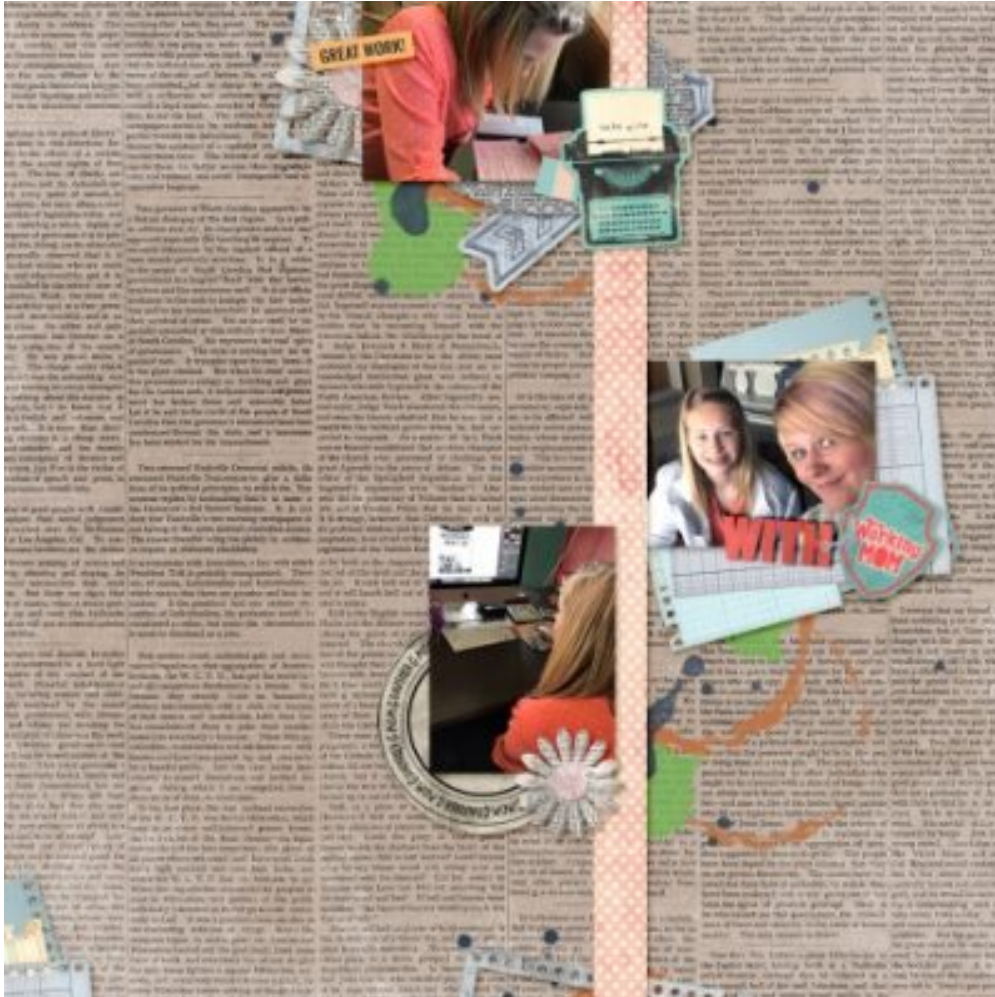
Layout by Tricia