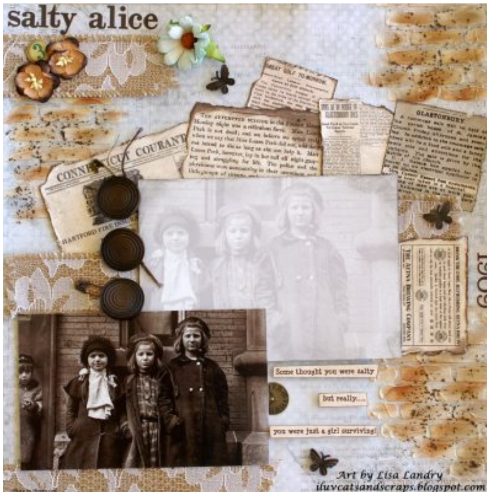
Layout by Lisa