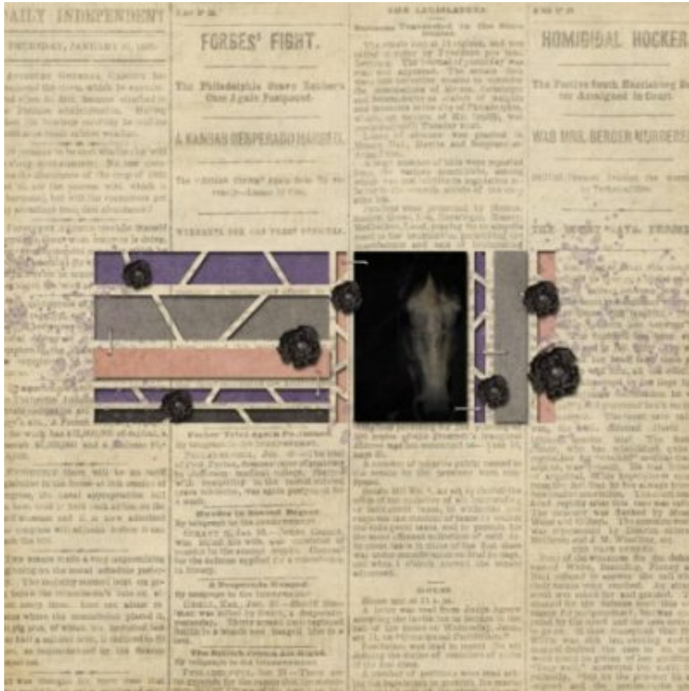
Layout by Pauline