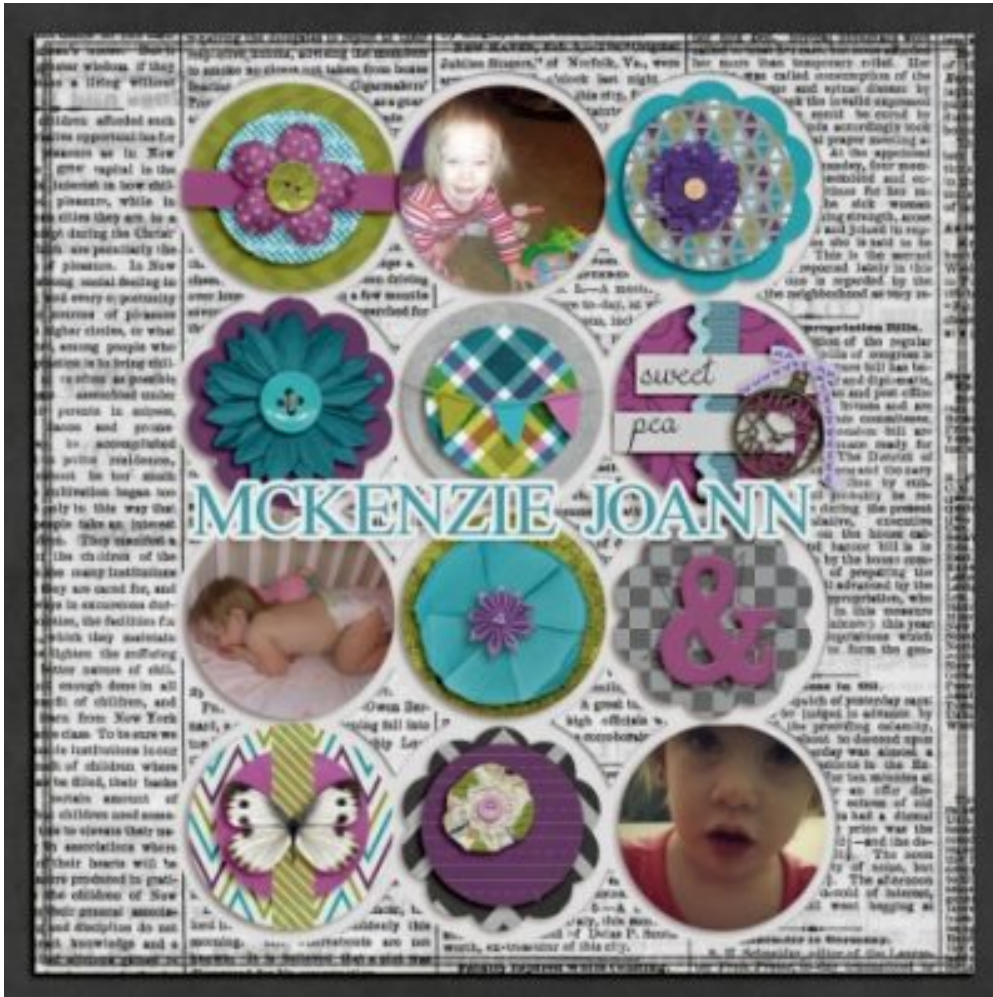
Layout by Pauline