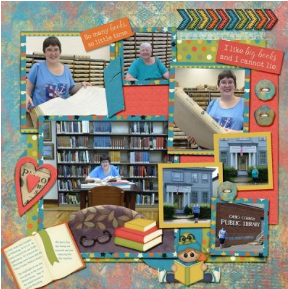
Layout by Amy