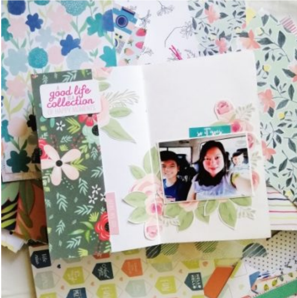
Layout by Anyang