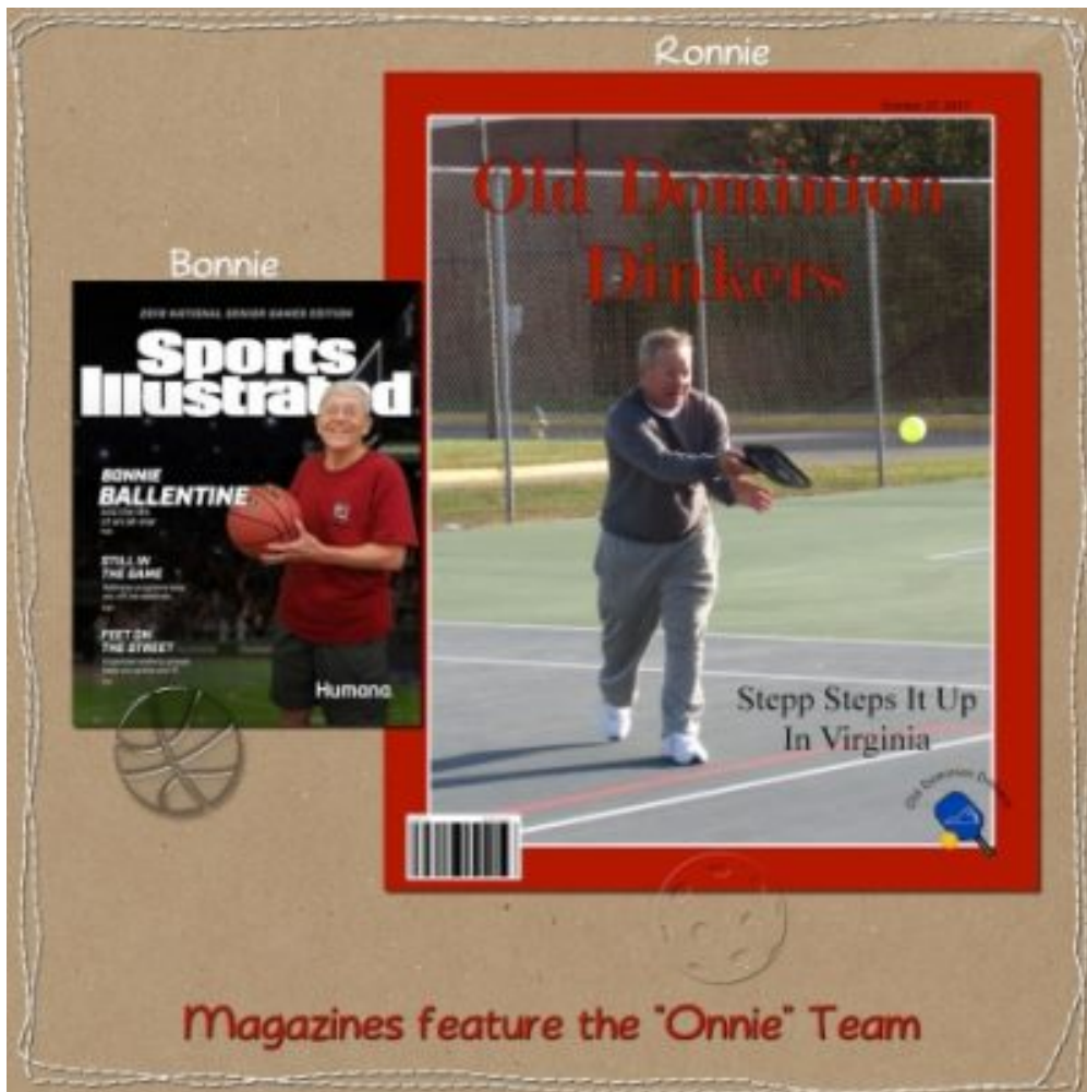
Layout by Bonnie