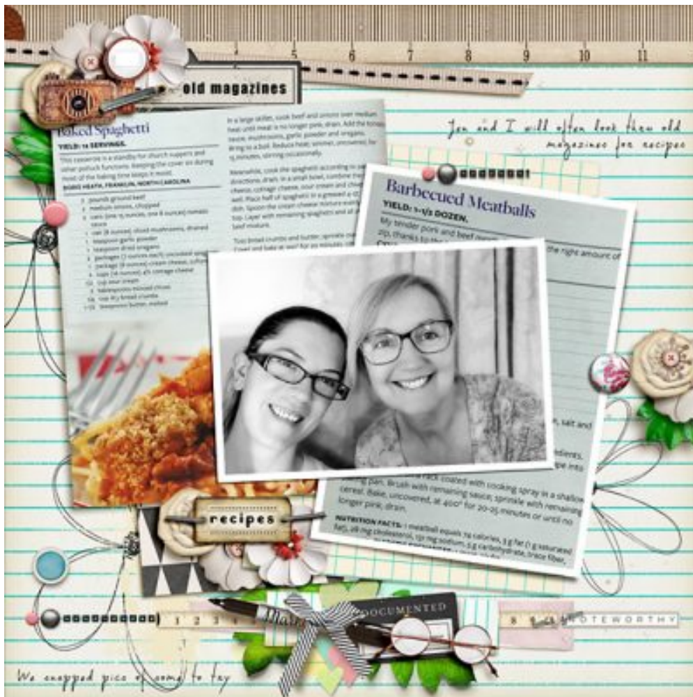
Layout by Rae