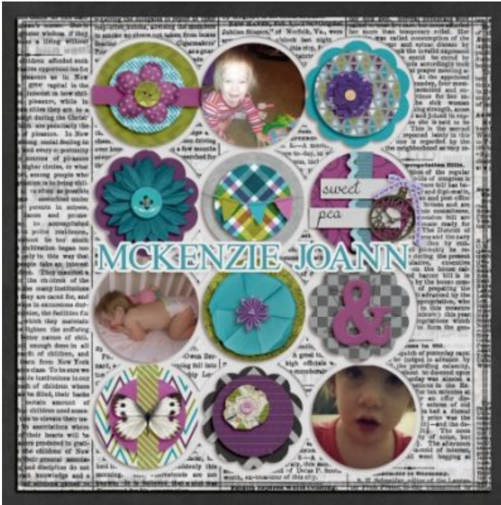
Page by Pauline