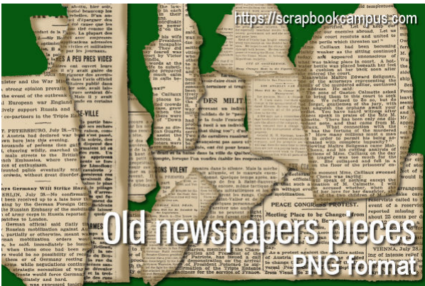
Page by Anyang