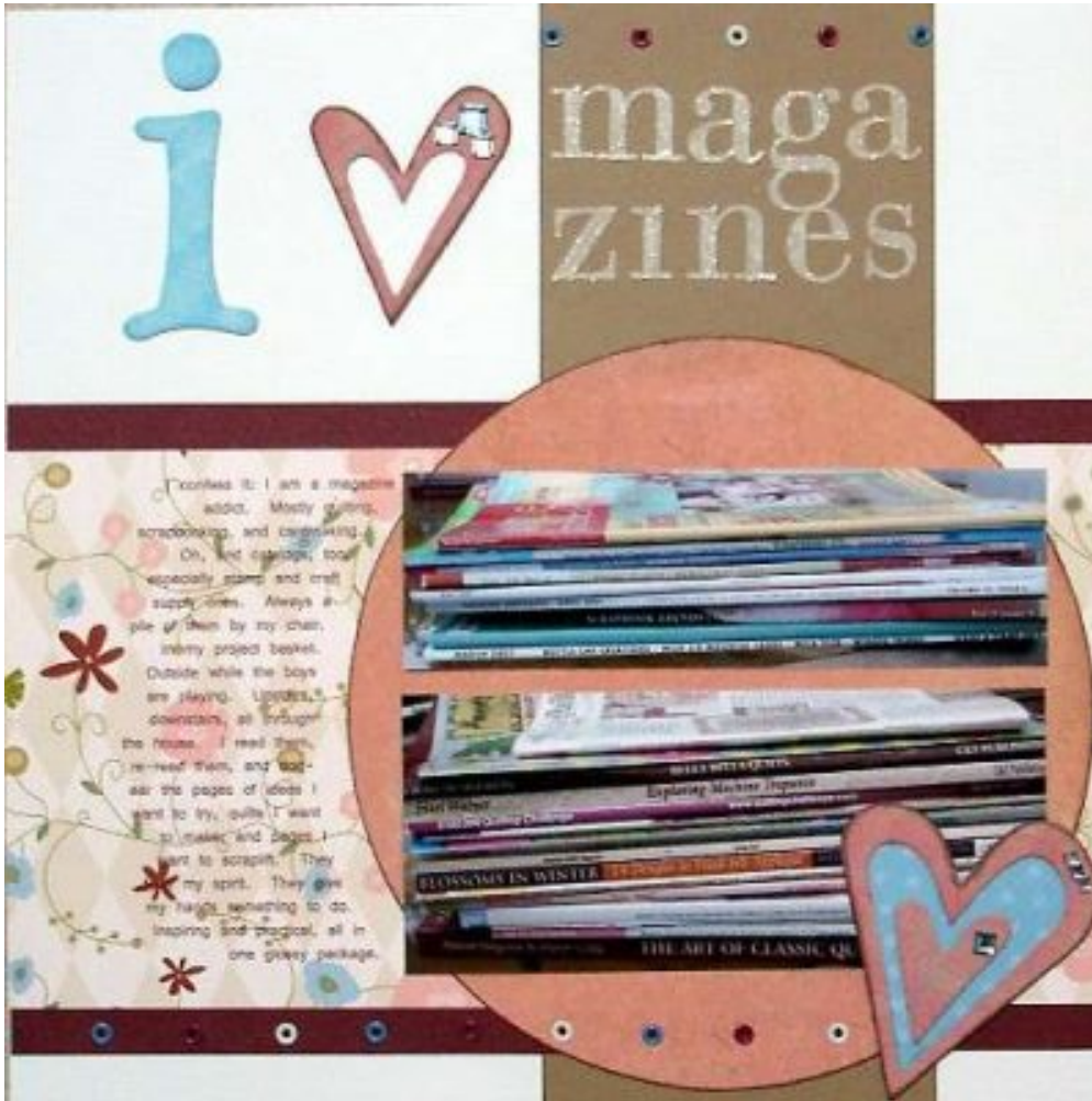
Page by Janice