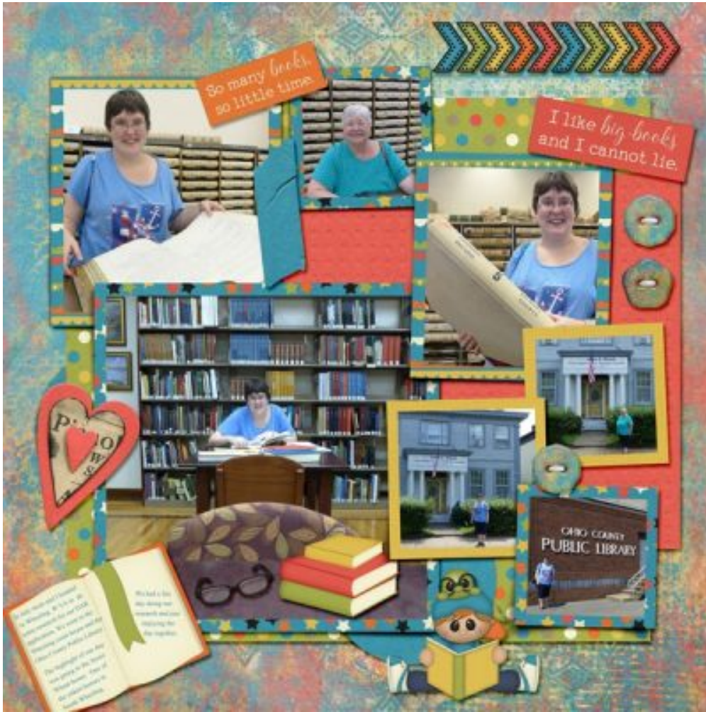
Page by Amy