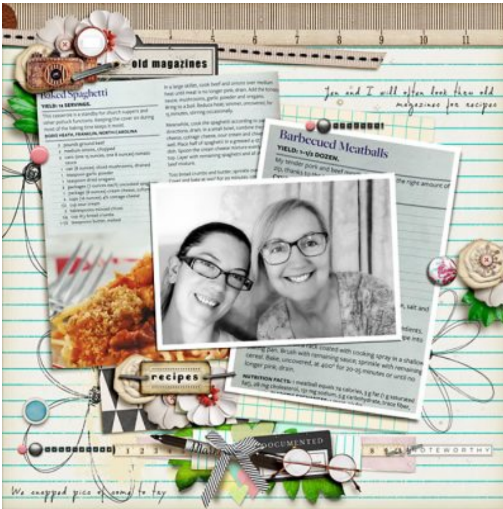
Layout by Rae