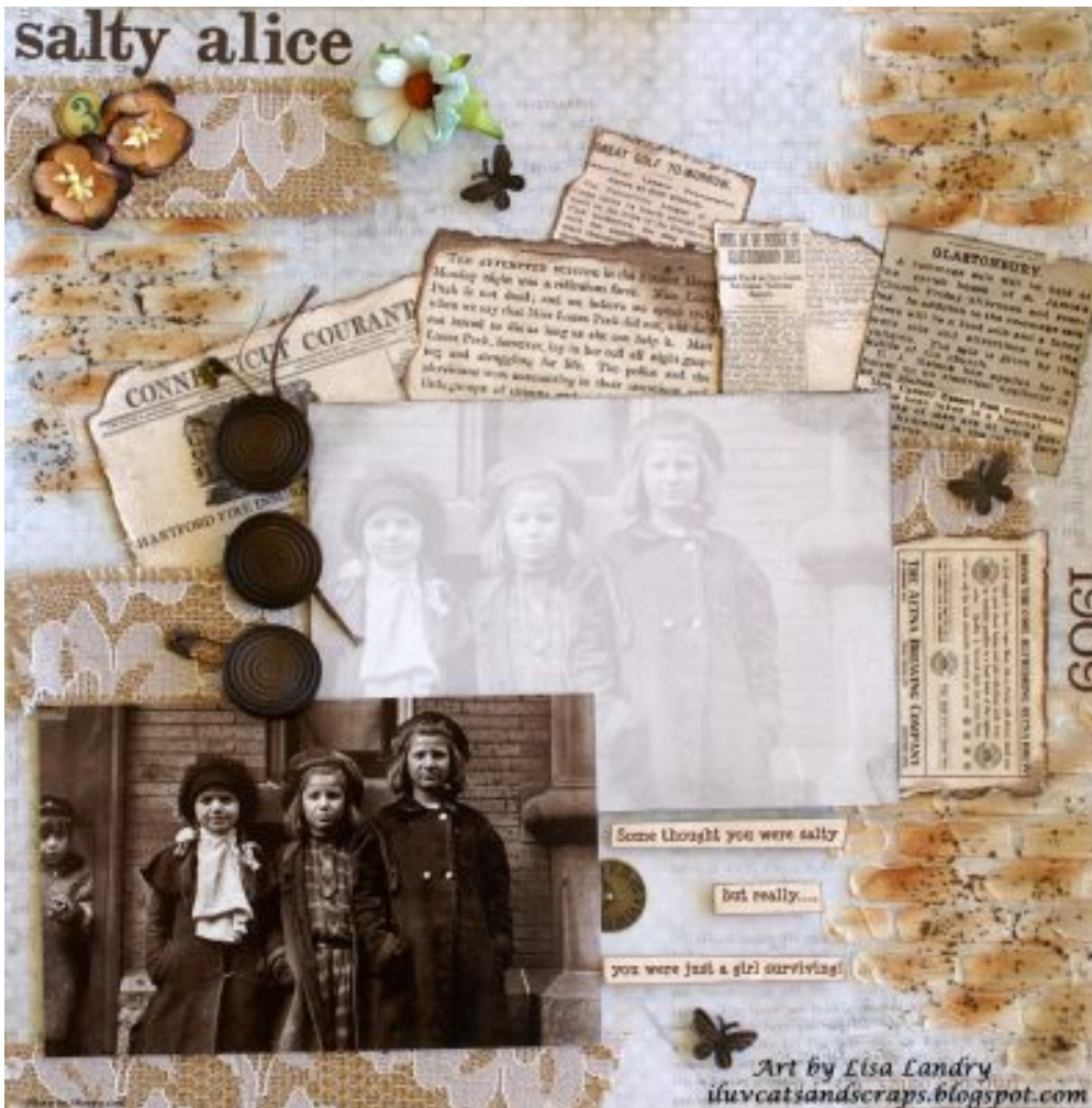
Layout by Lisa