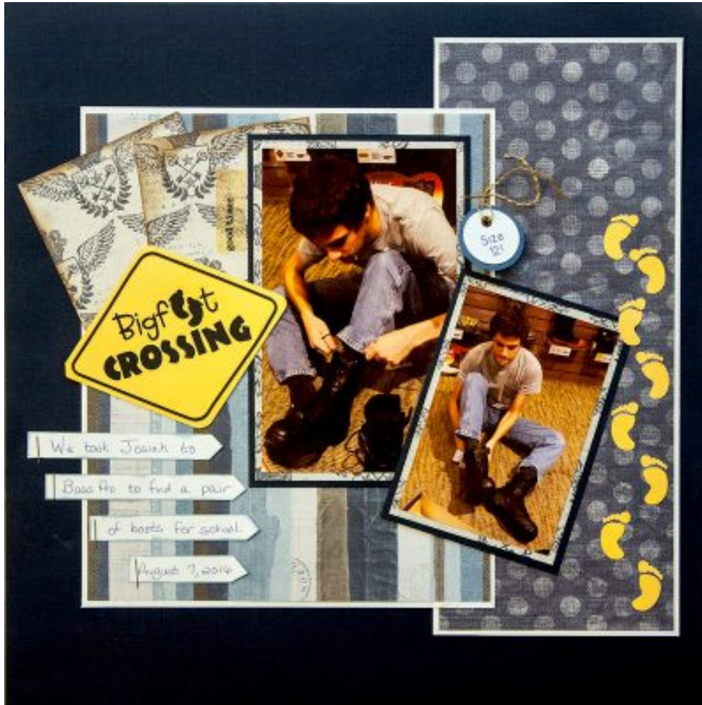
Layout by Lyn