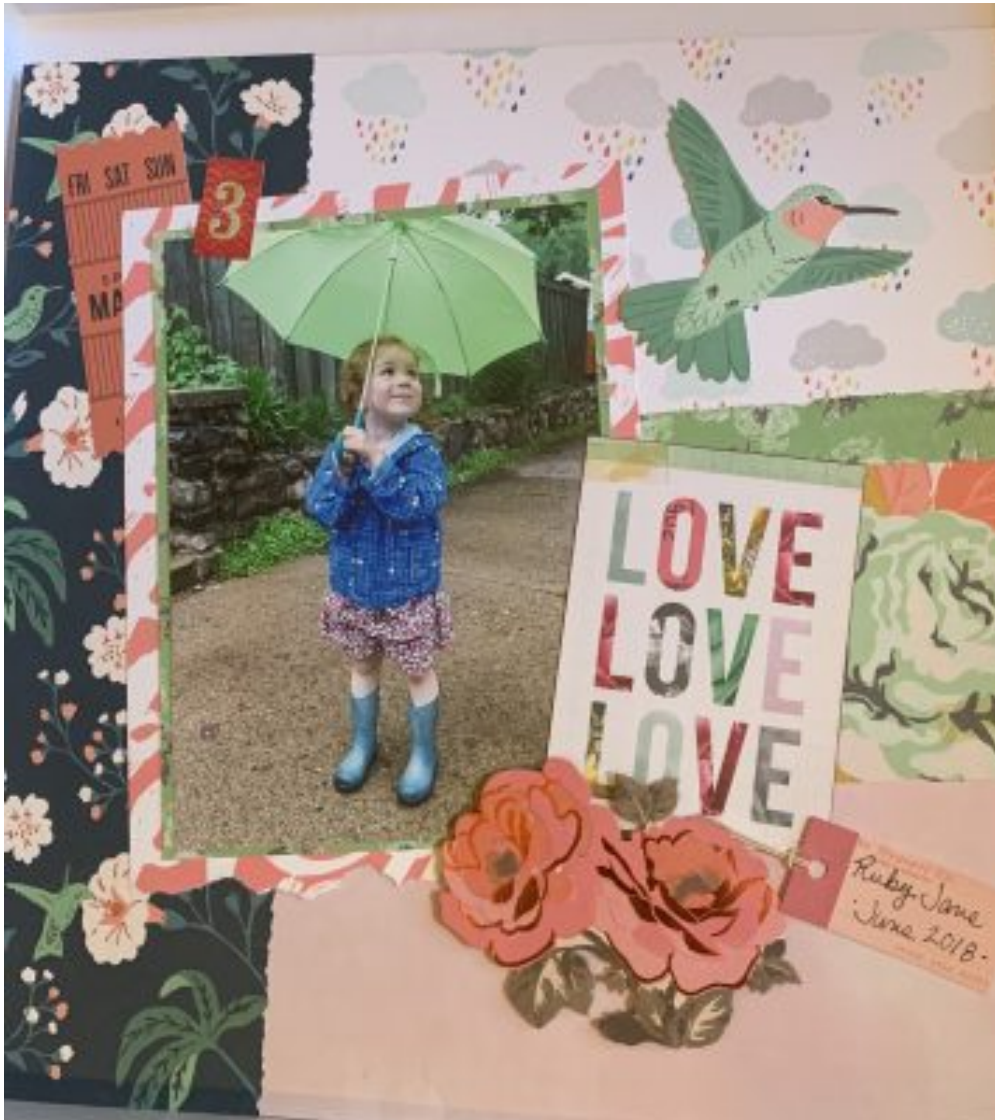
Layout by Jfinkorama