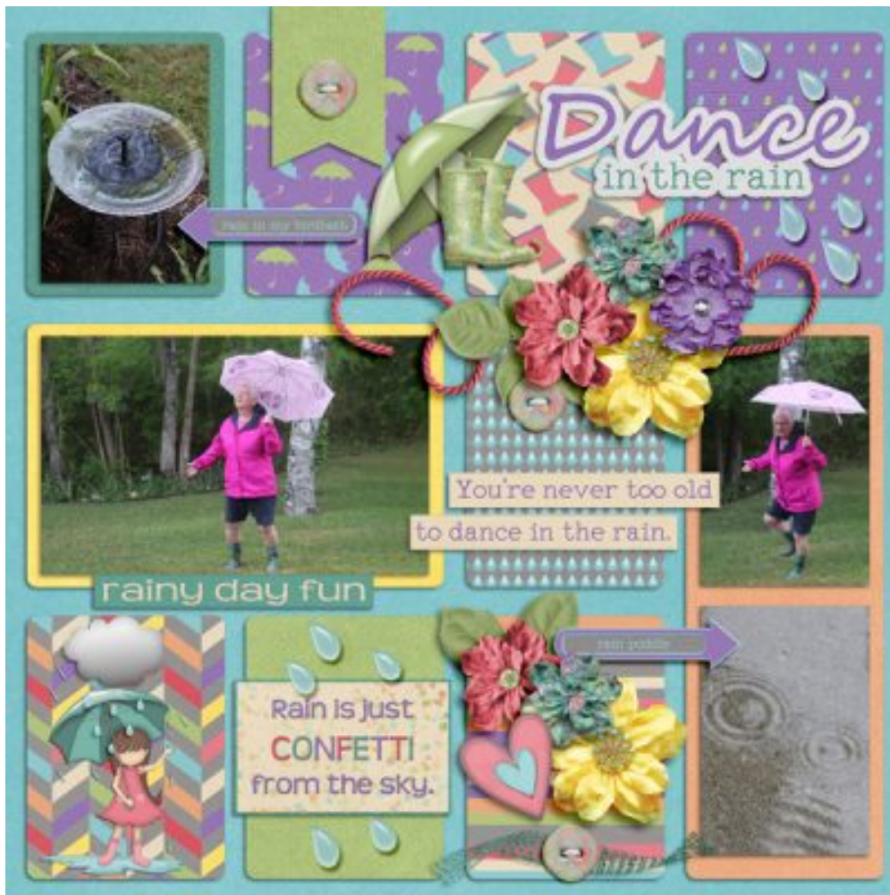
Layout by Betsyfru