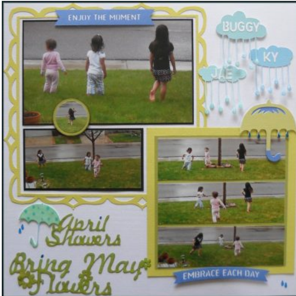
Layout by Trish