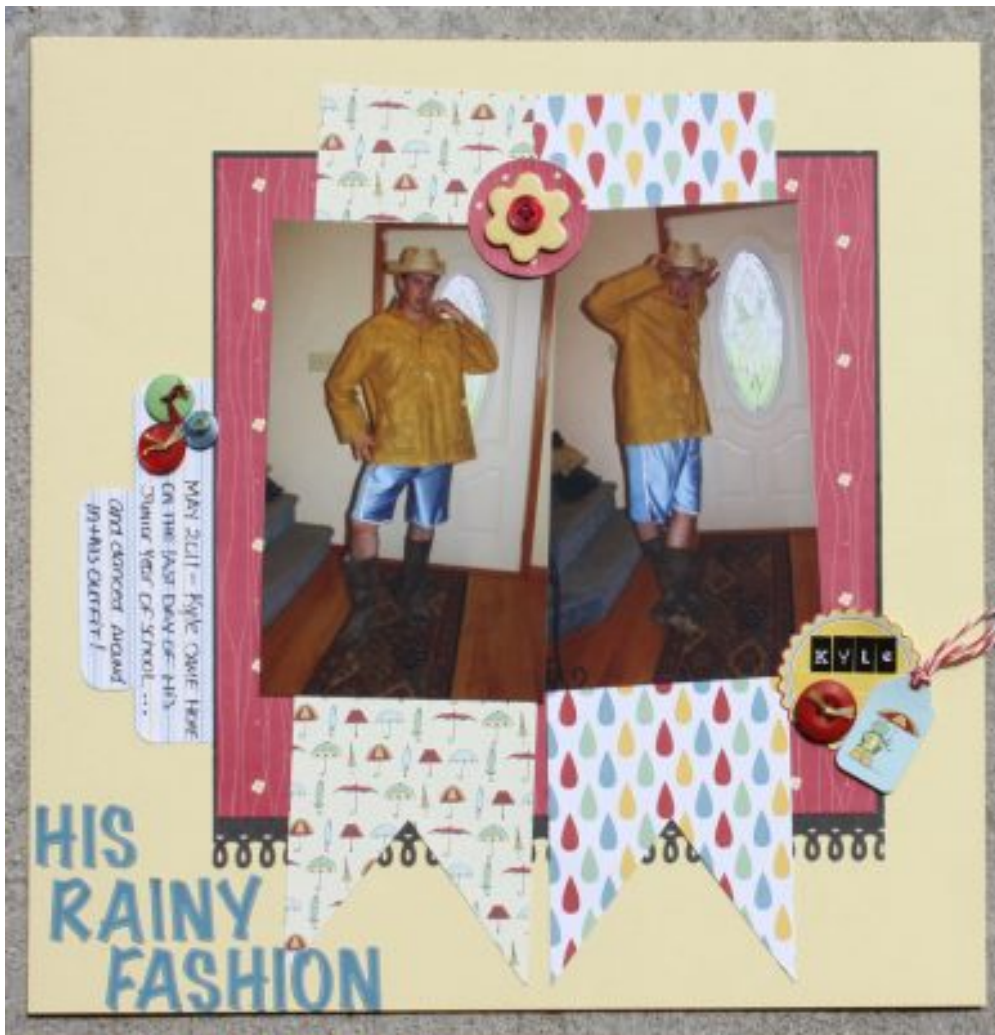
Layout by Joannie