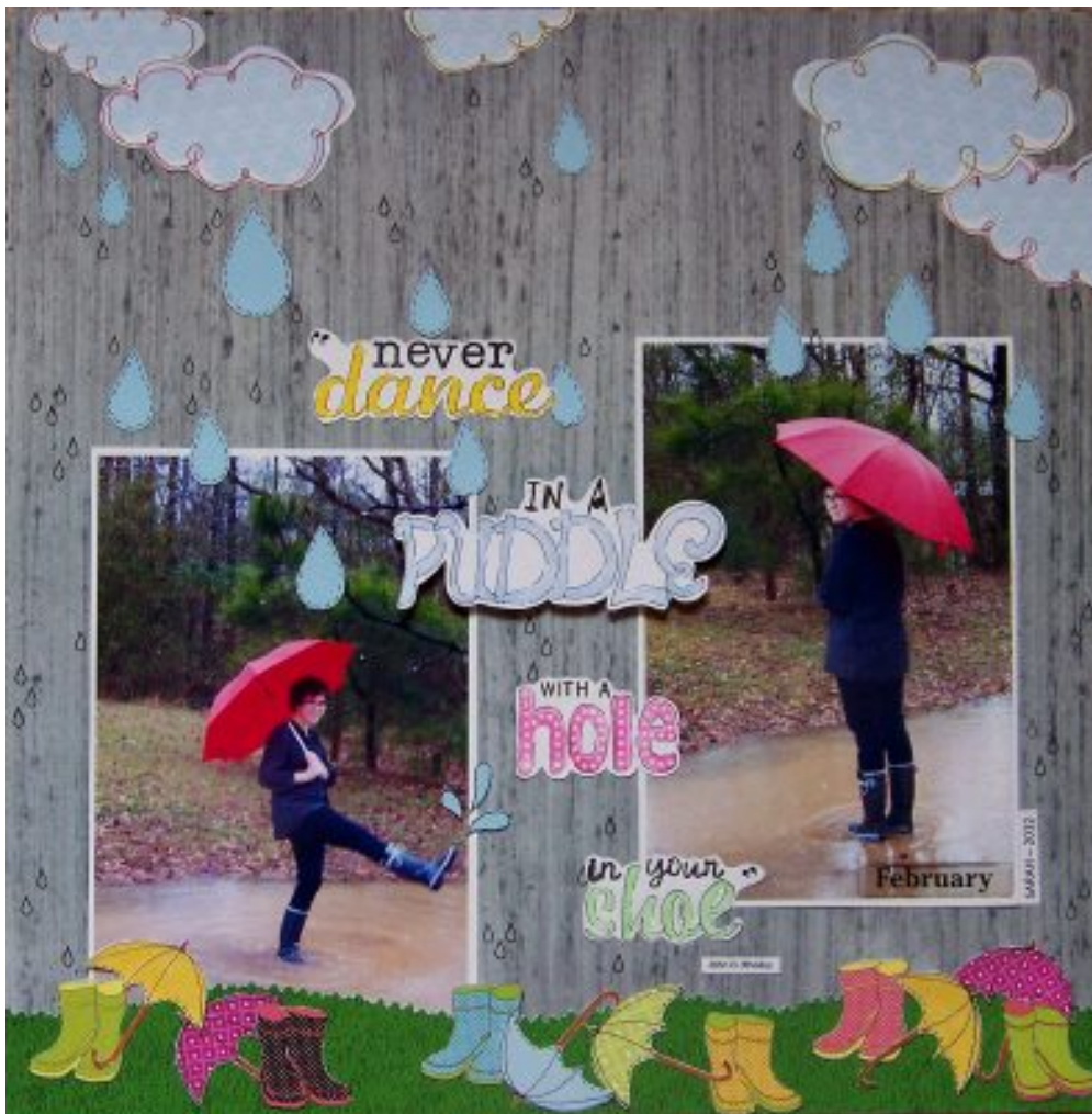
Layout by Betty