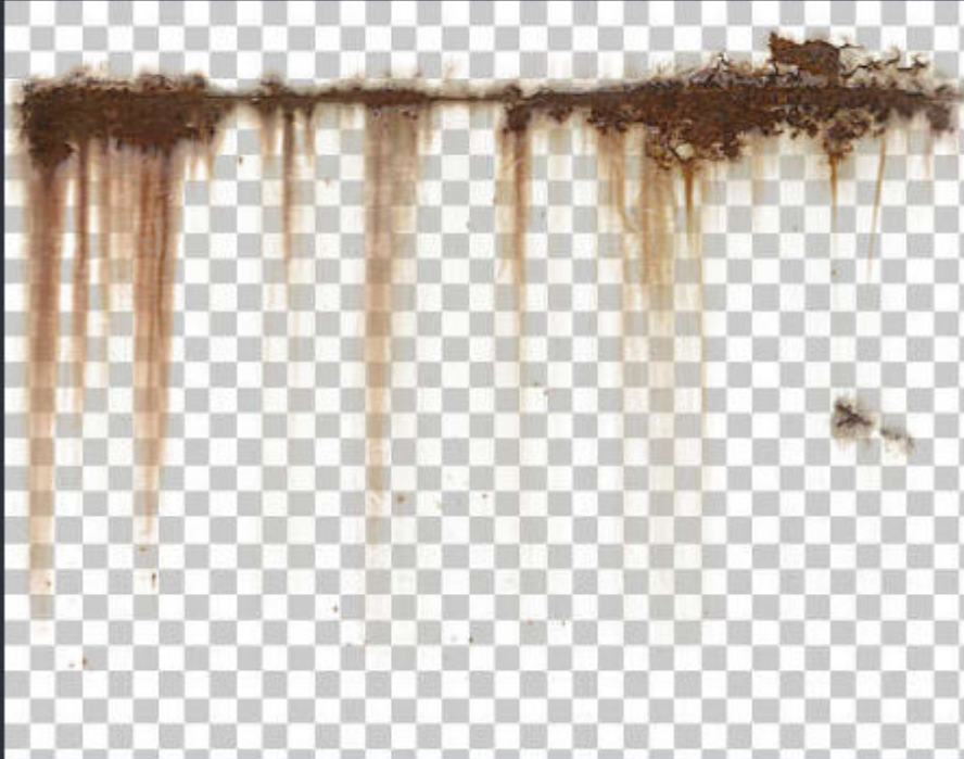
Image 1 - 8Bit PNG - Masked