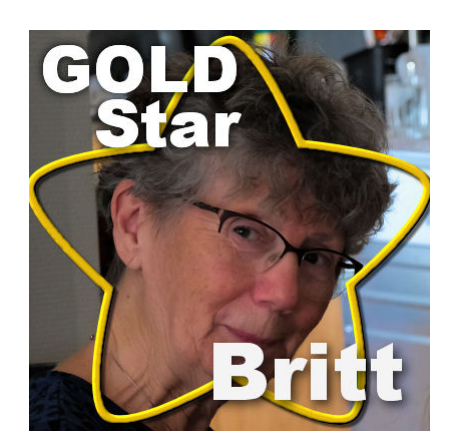
Gold Star – Britt