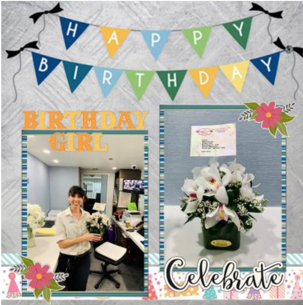
Layout by Ana