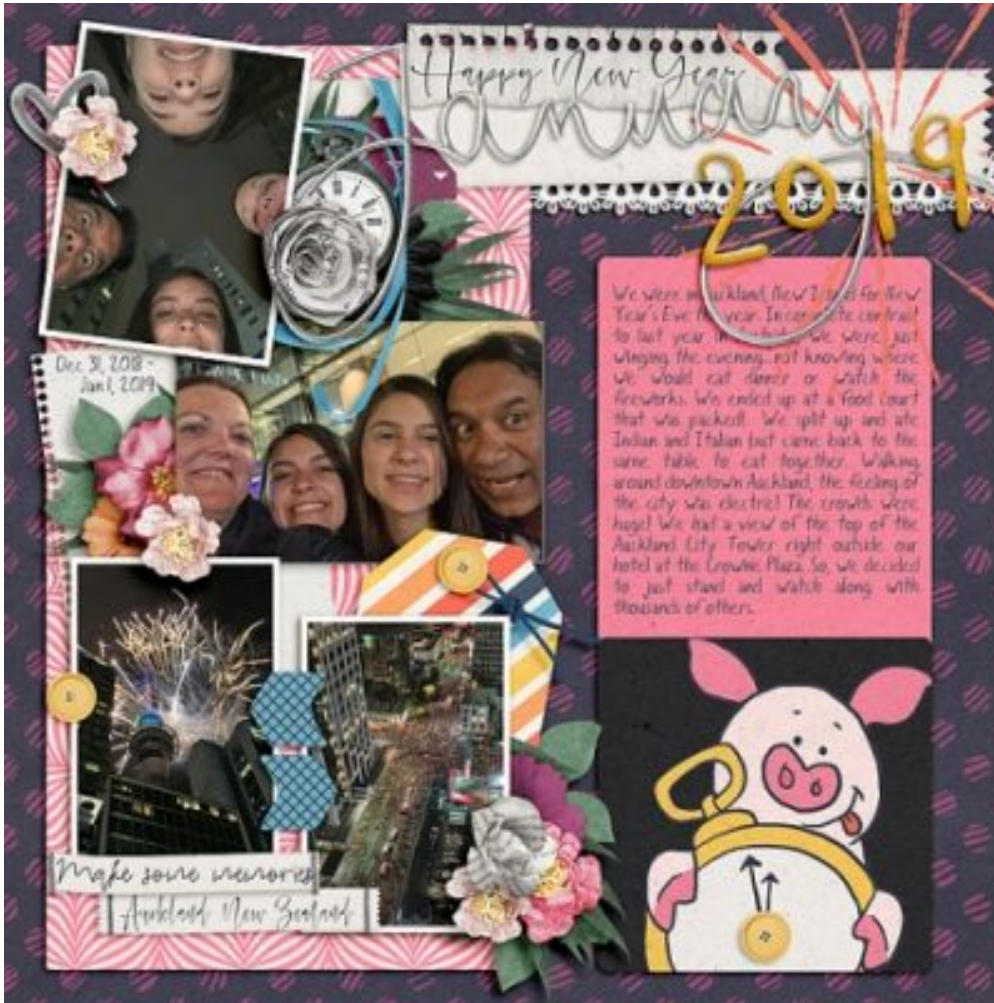
Layout by Joanna