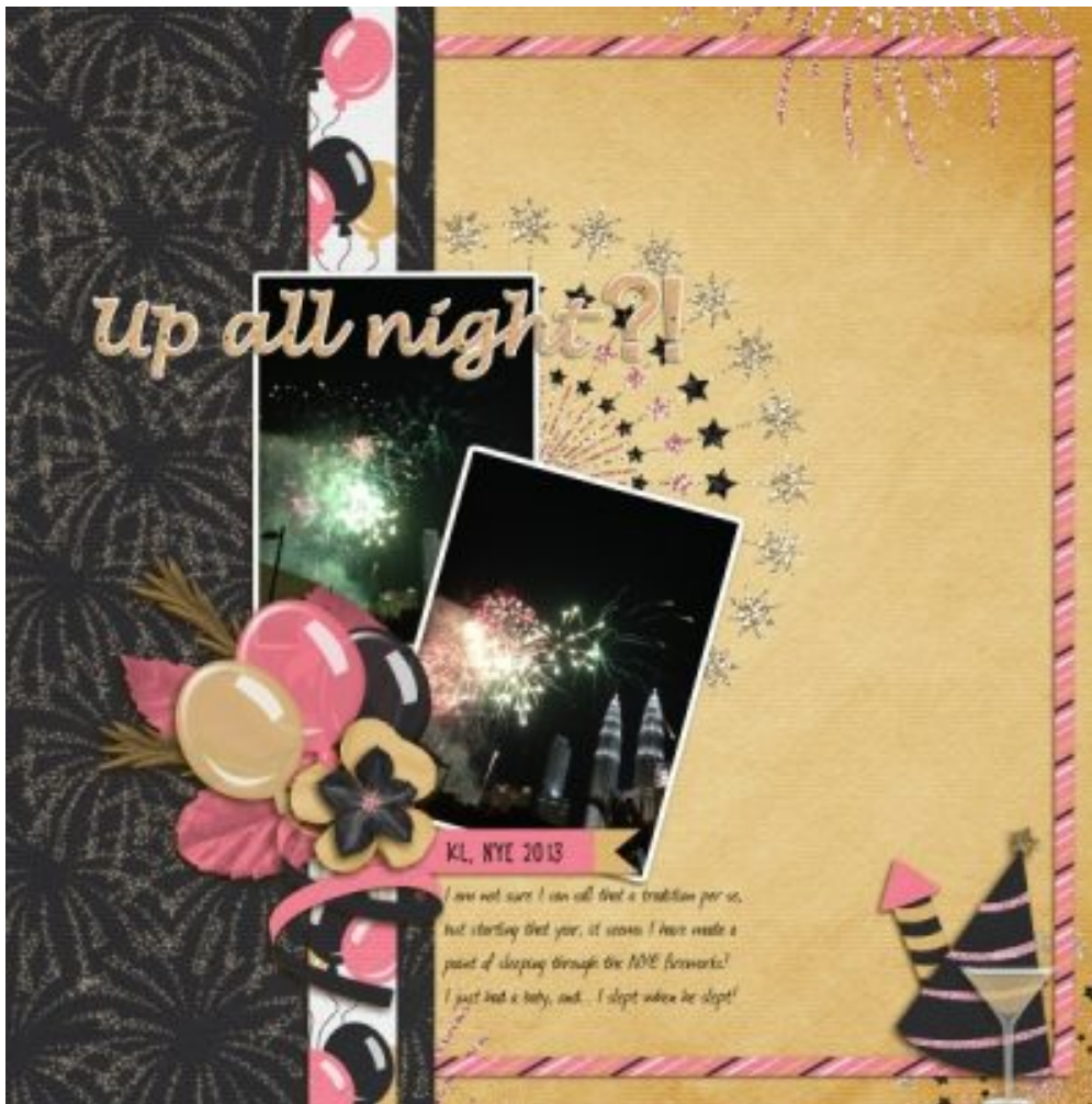
Layout by Lou