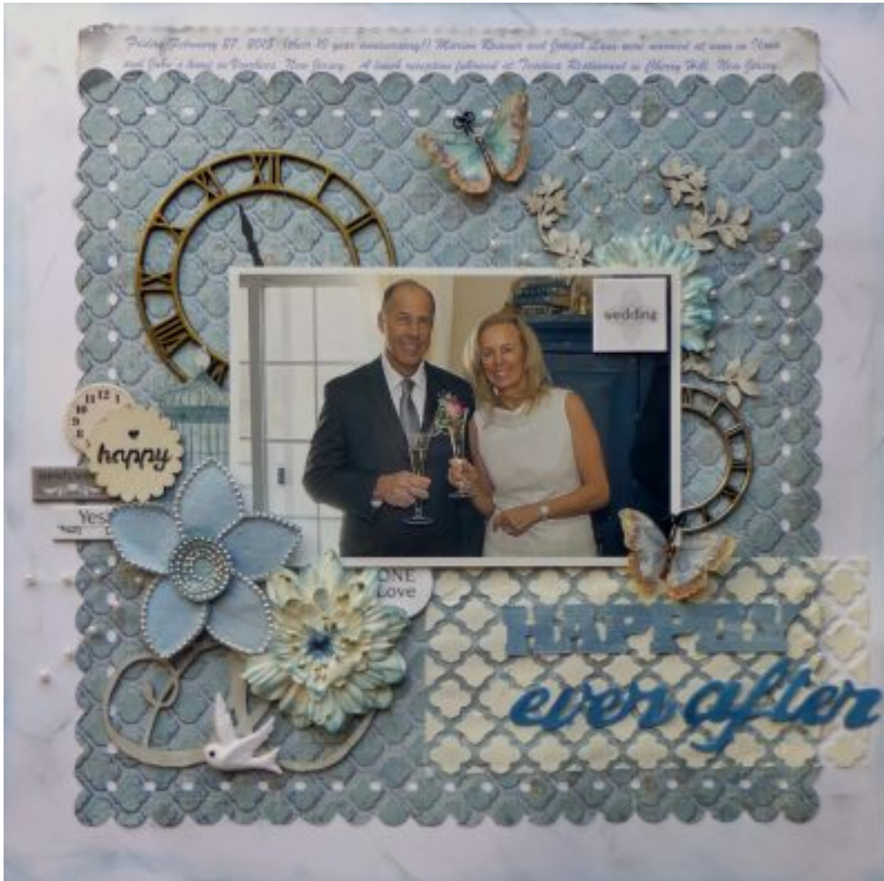
Layout by Marci