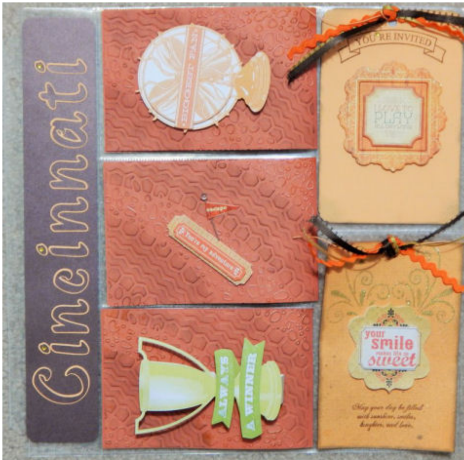
Layout by Boricuapr