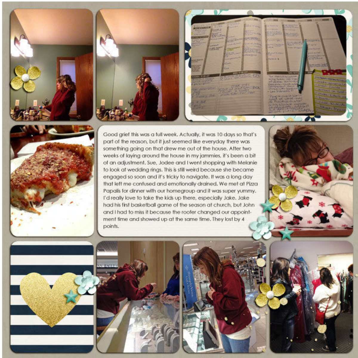
Layout by Vfowler77

As you can see, the fact that the elements are not constrained inside physical pockets, the scrapper was able to add those little flowers where it would be impossible to have them if using plastic pockets, but the overall look is similar to what you would otherwise get with the page protector.