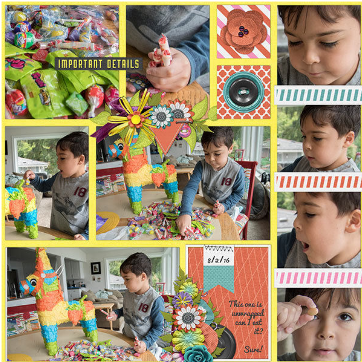
Layout by Basicbear2