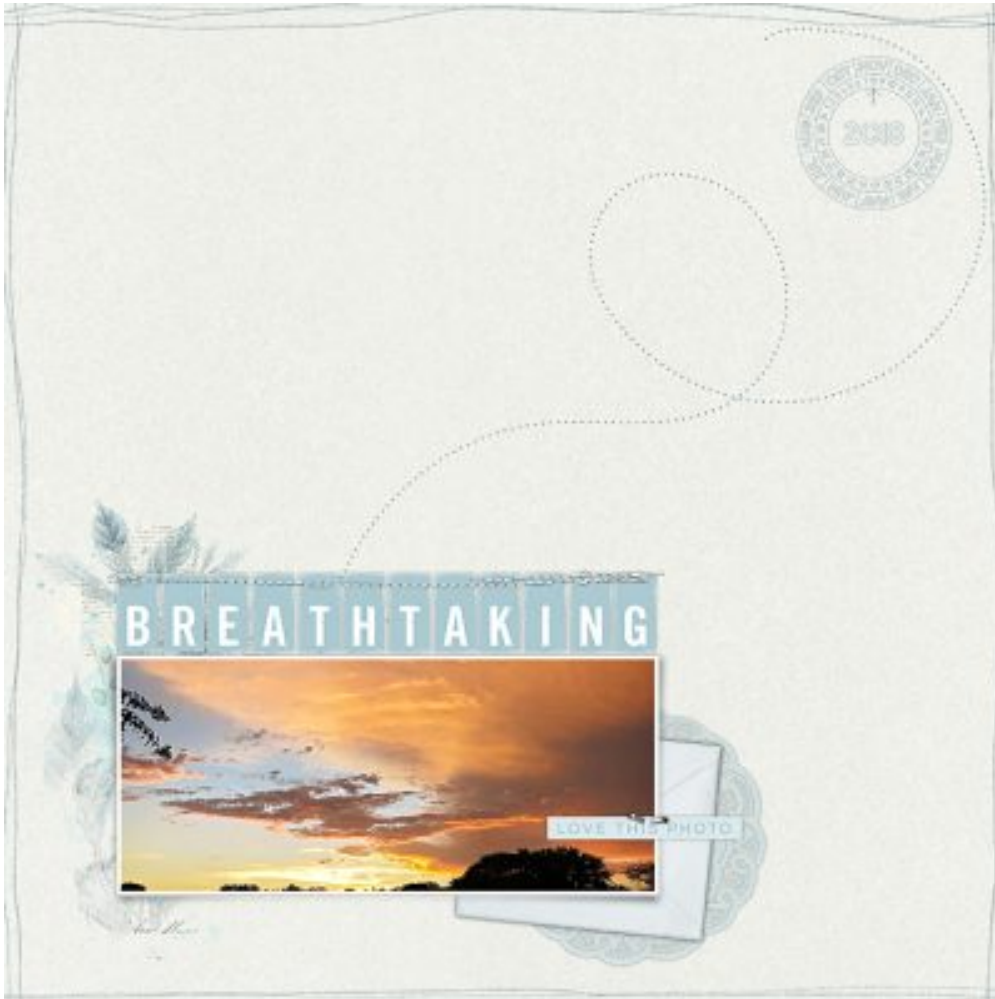
Layout by Linda