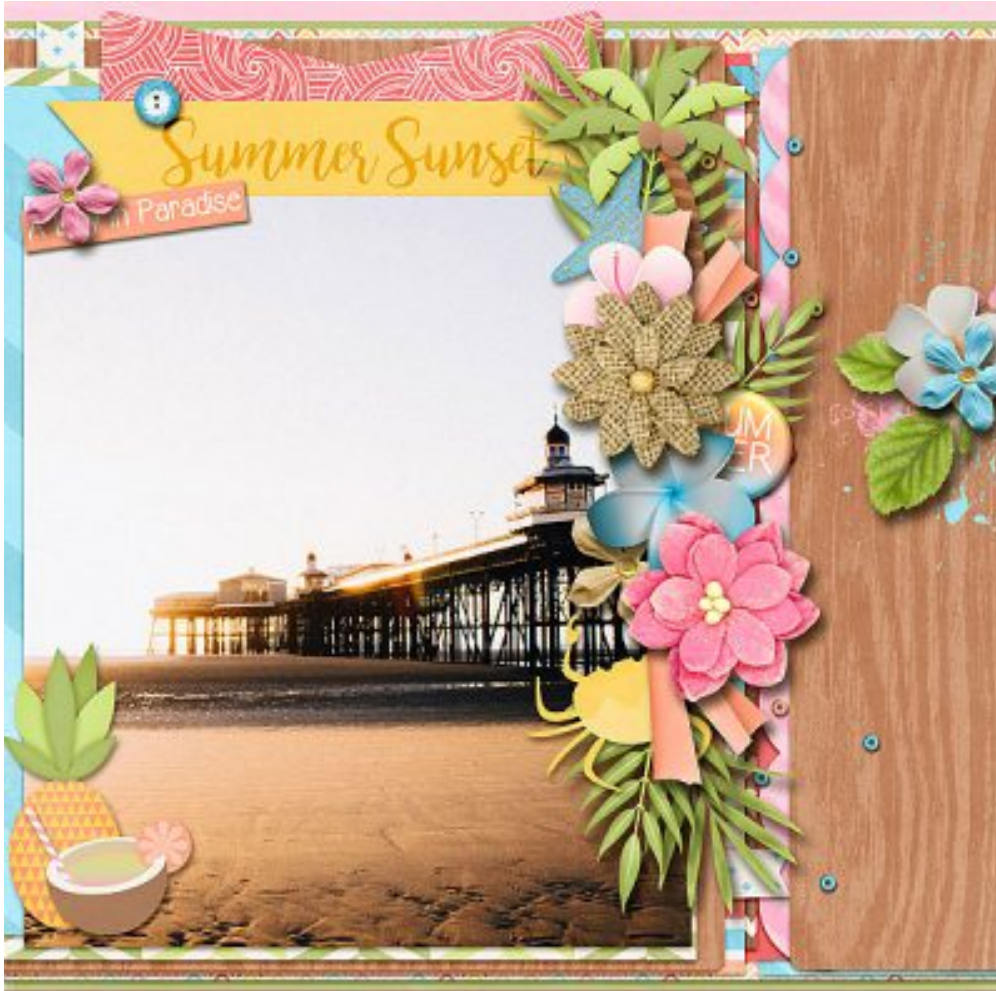
Layout by Robin