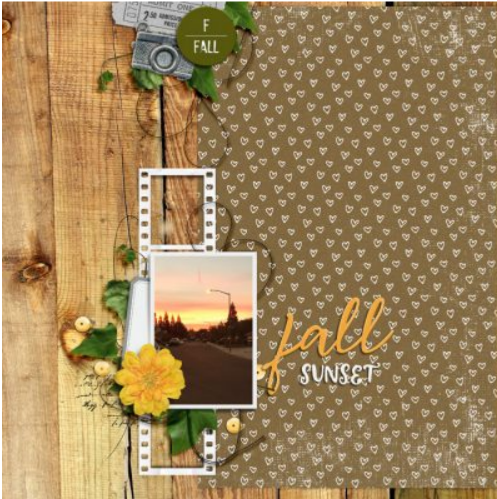
Layout by Carrie1977