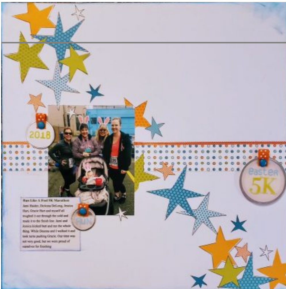
Layout by Angela