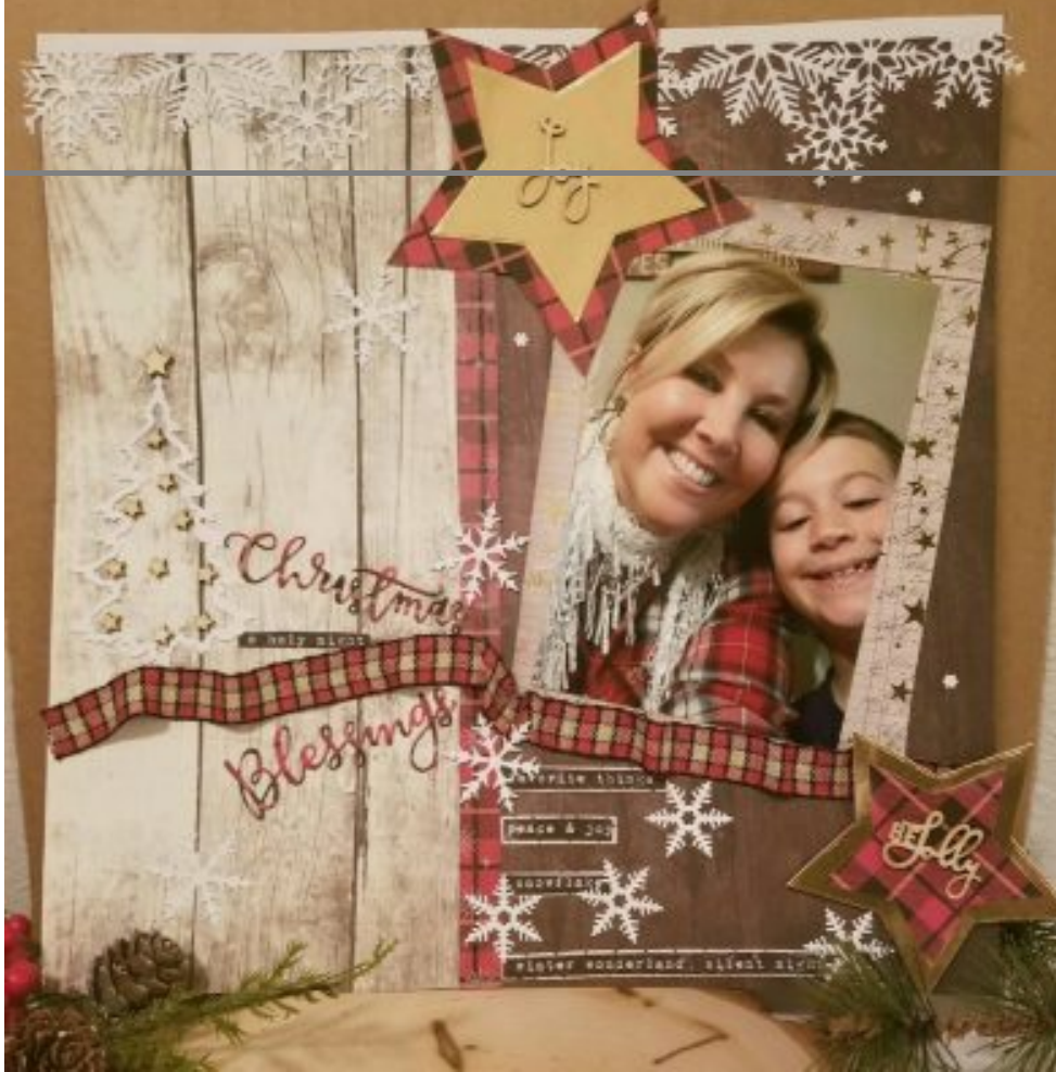
Layout by Robin