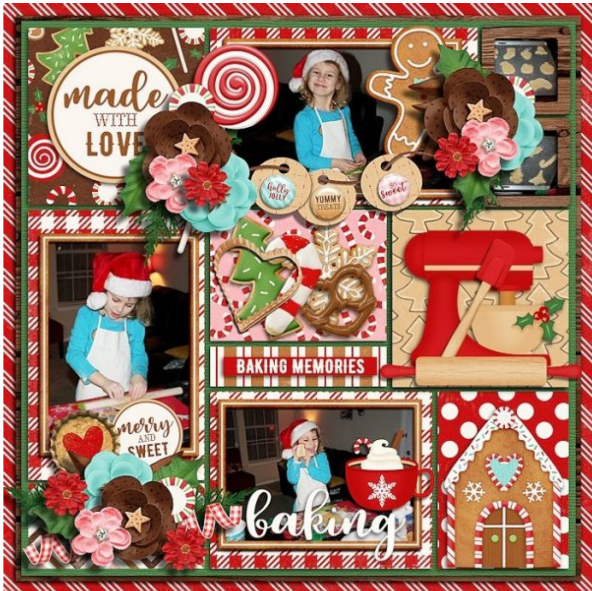
Project by Ellaspace