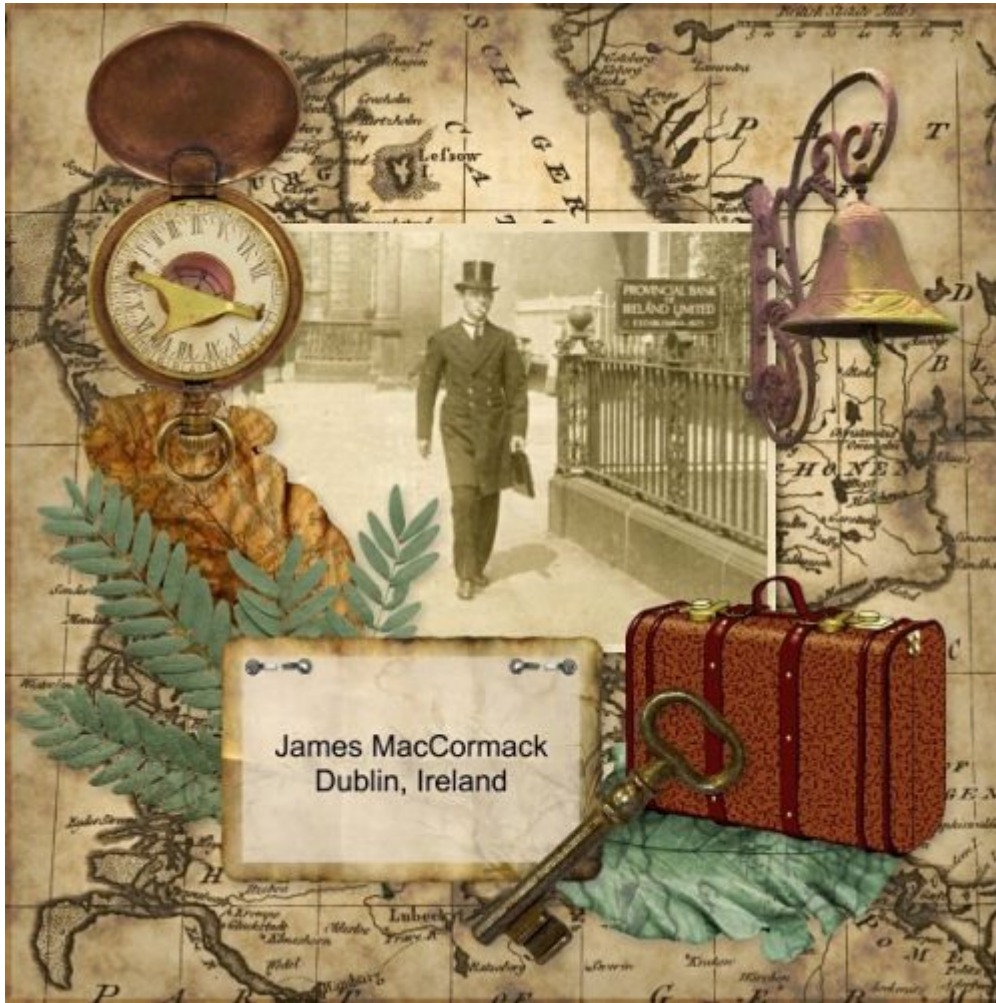
Layout by Lil