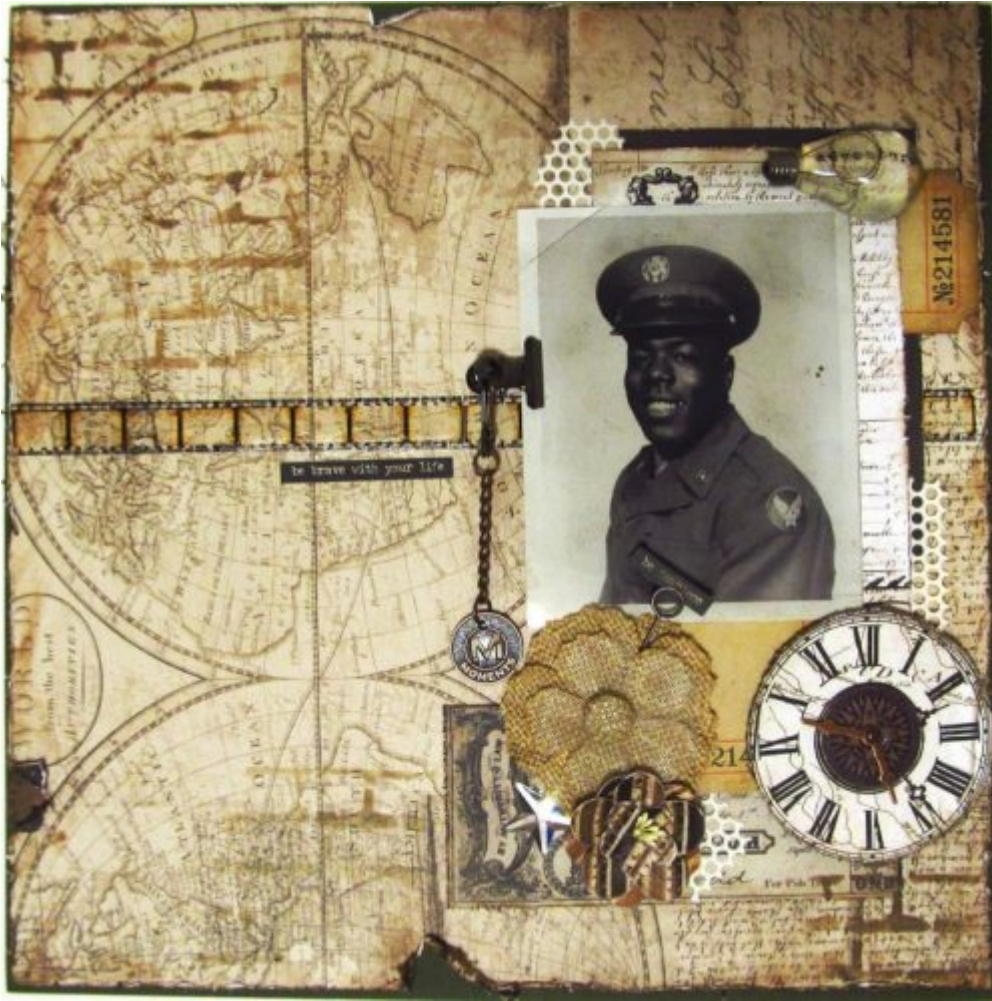
Layout by Kim