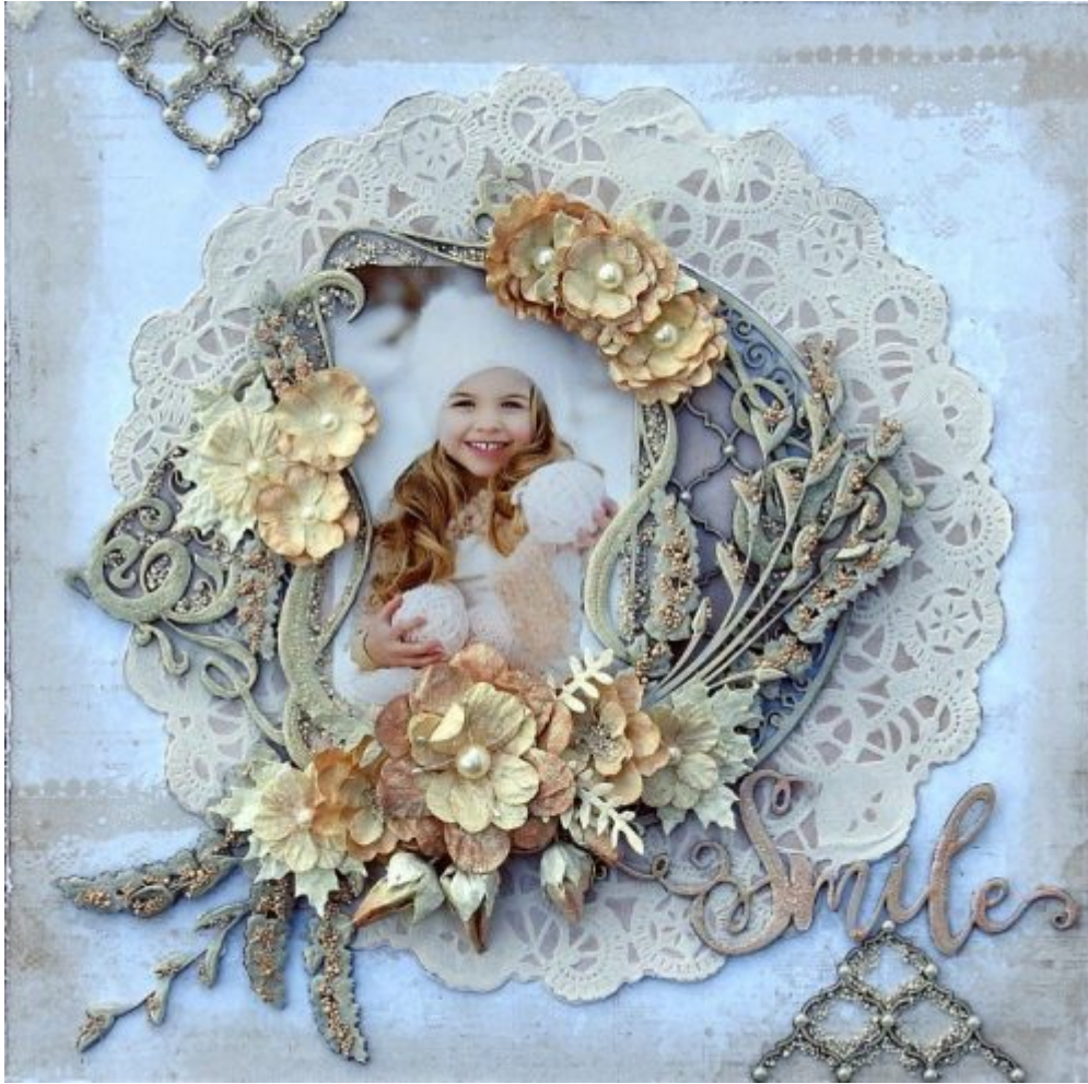
Layout by Rachie babe