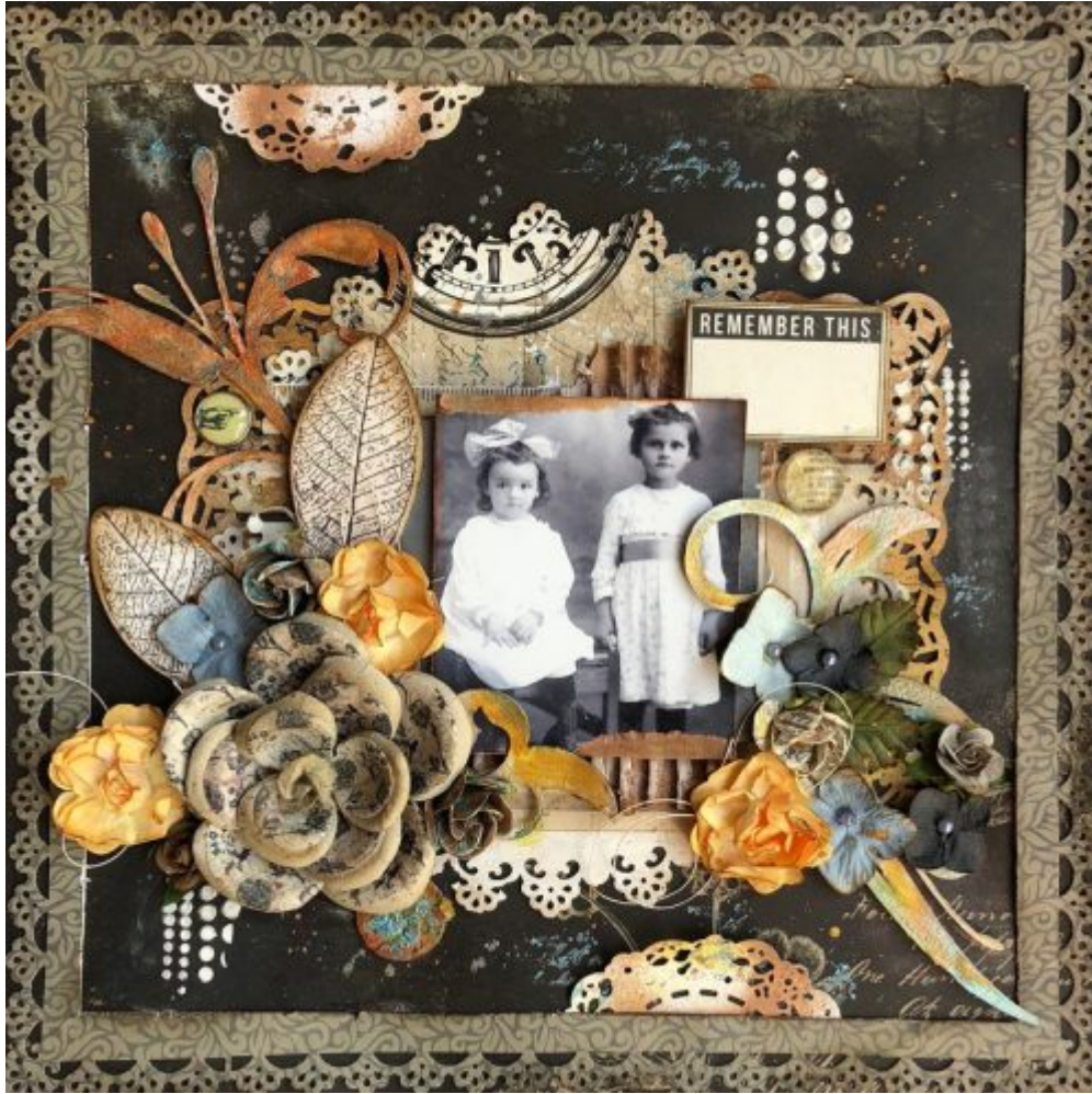
Layout by Lisa