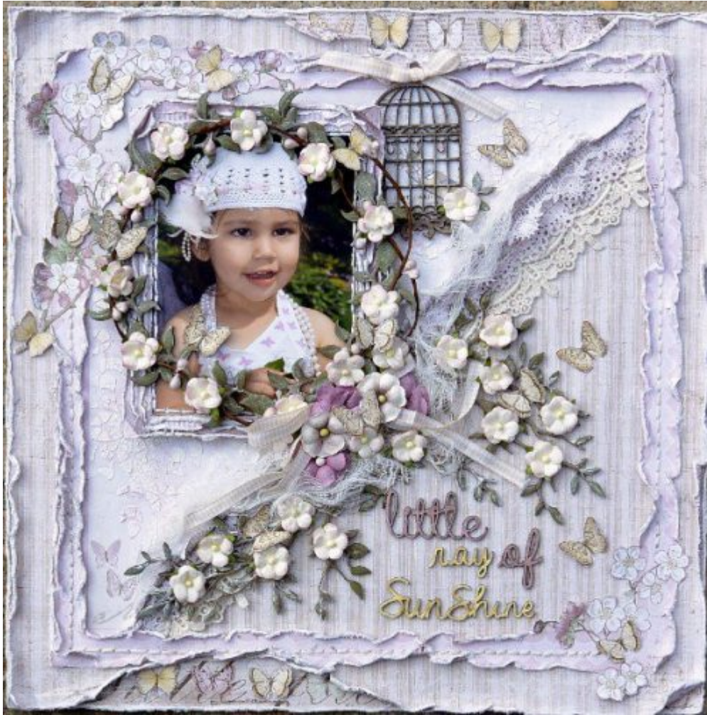
Layout by Rachie Babe