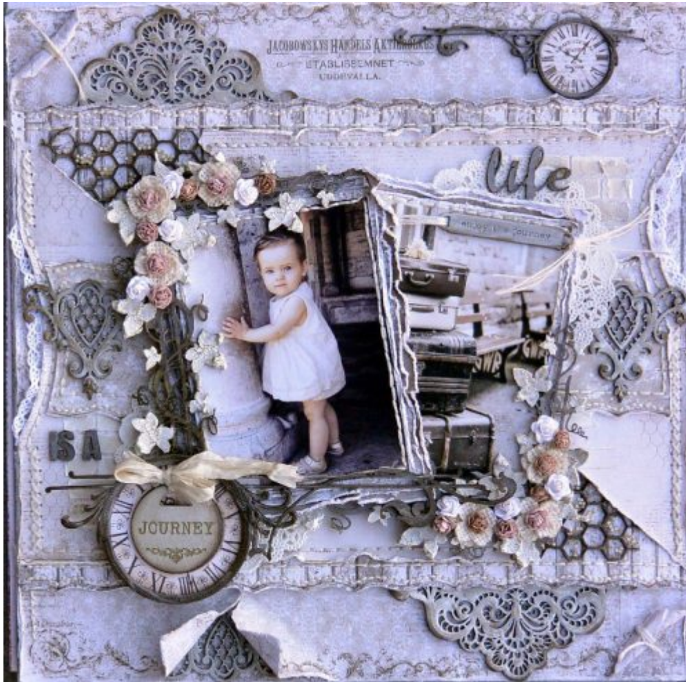
Layout by Rachie Babe