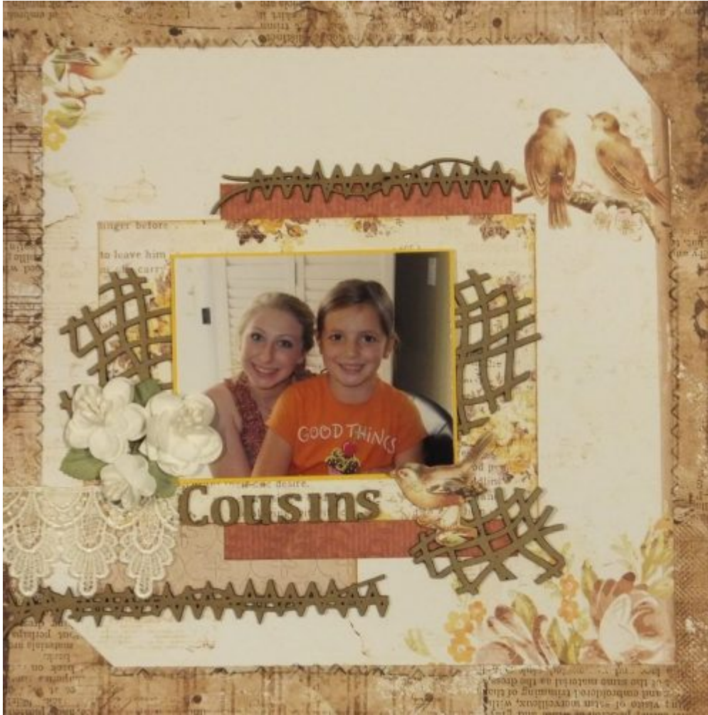
Layout by Bev