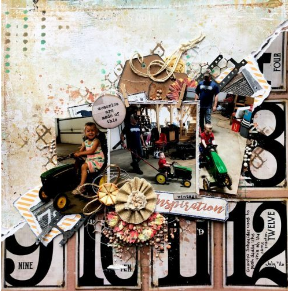
Layout by Jennifer