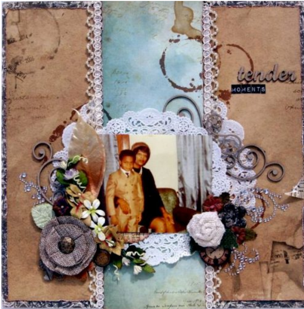
Layout by Kim