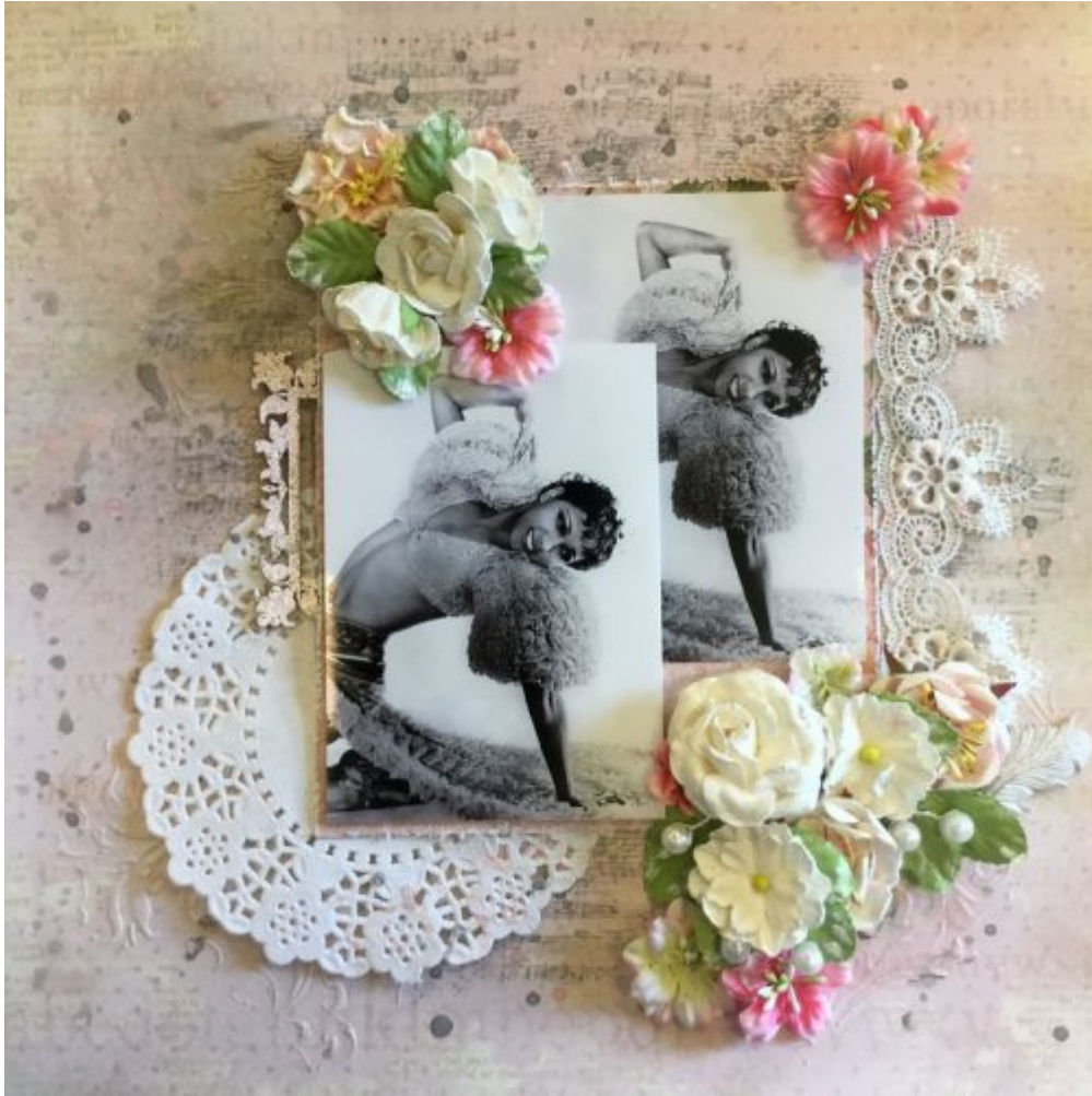
Layout by Kim