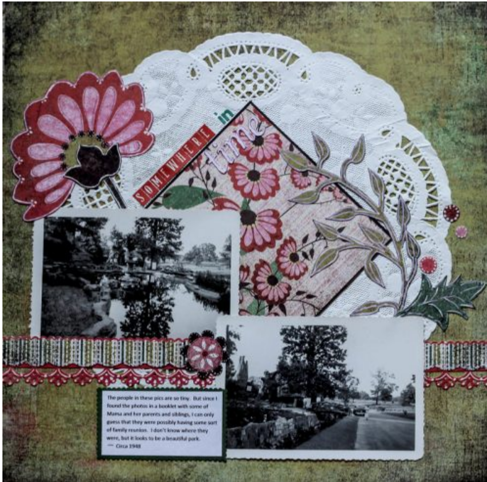
Layout by Betty