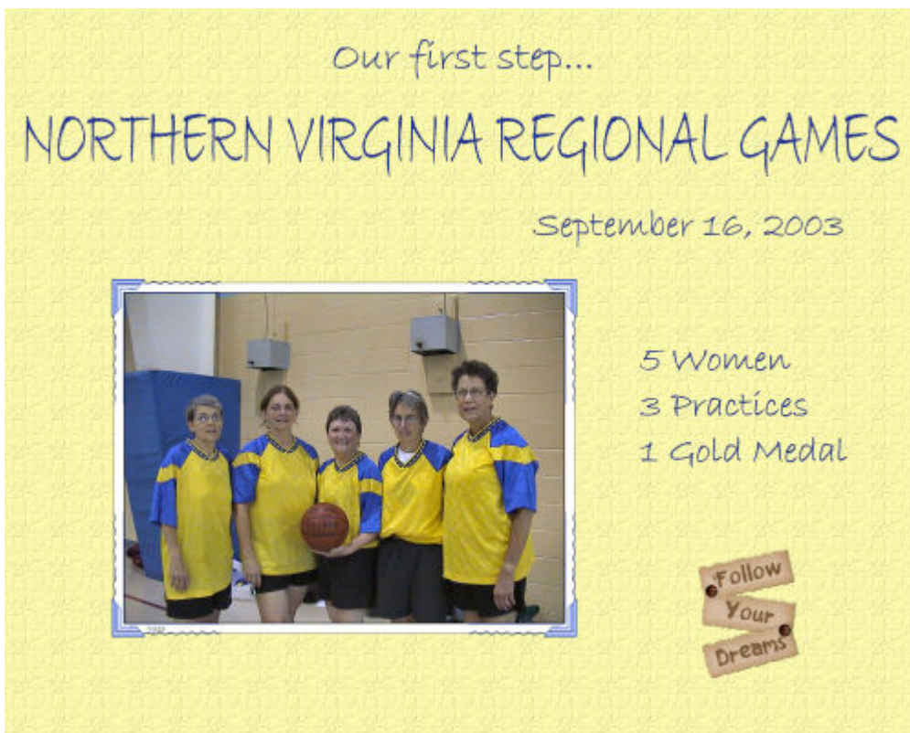
I began scrapping 8X10 for ease and expense of printing. That's me on the far left. These are the