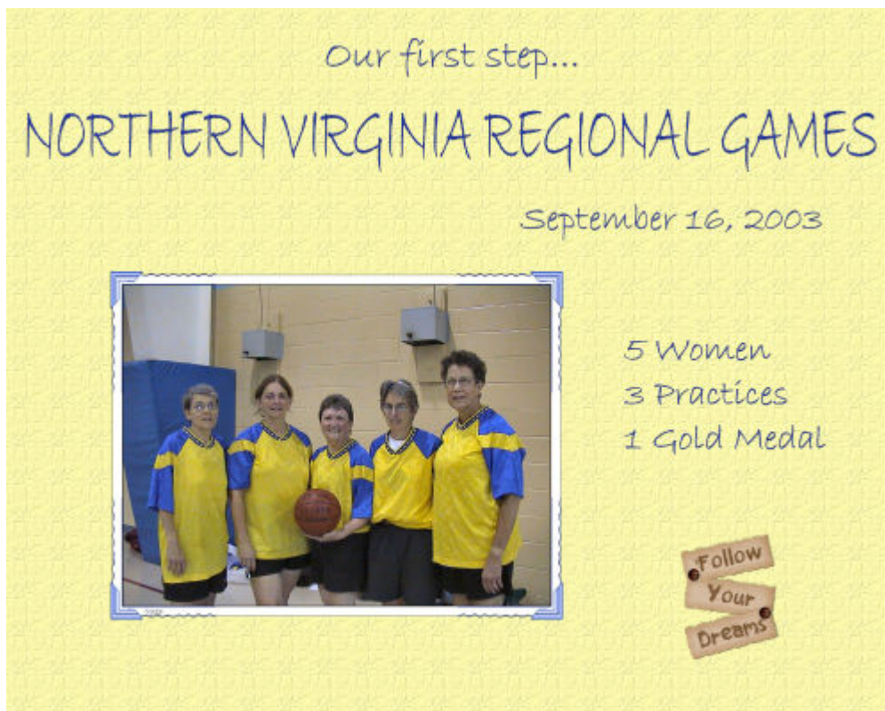
I began scrapping 8X10 for ease and expense of printing. That's me on the far left. These are the