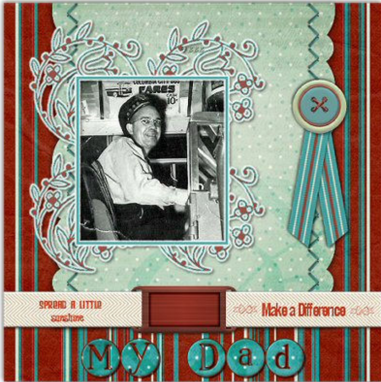
My first scrap page: