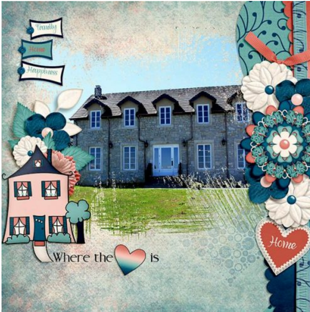
Layout by Beth