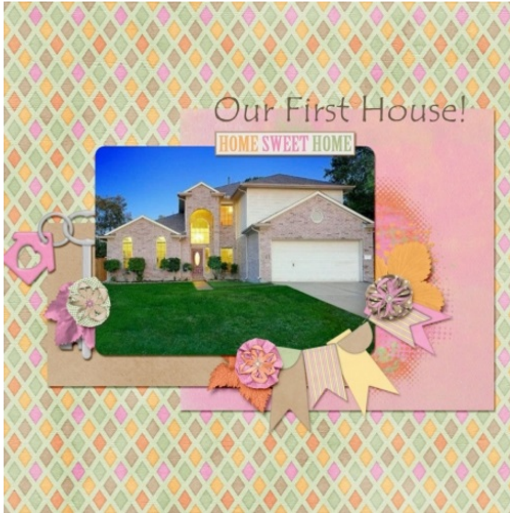
Layout by Shelley