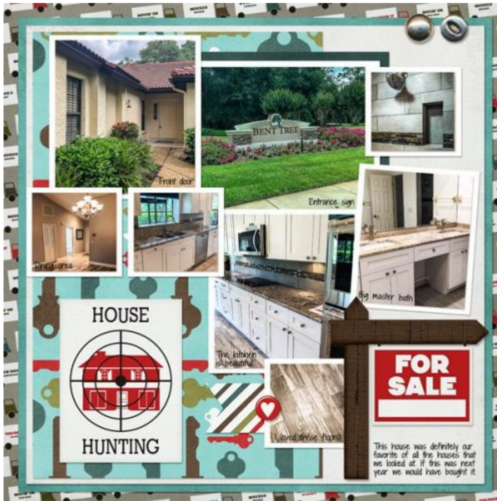
Layout by Donna