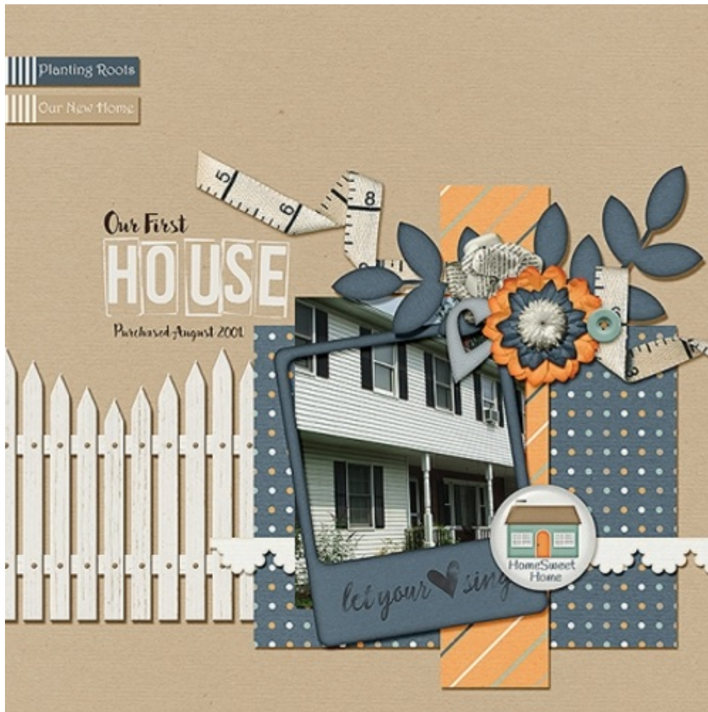
Layout by Kim