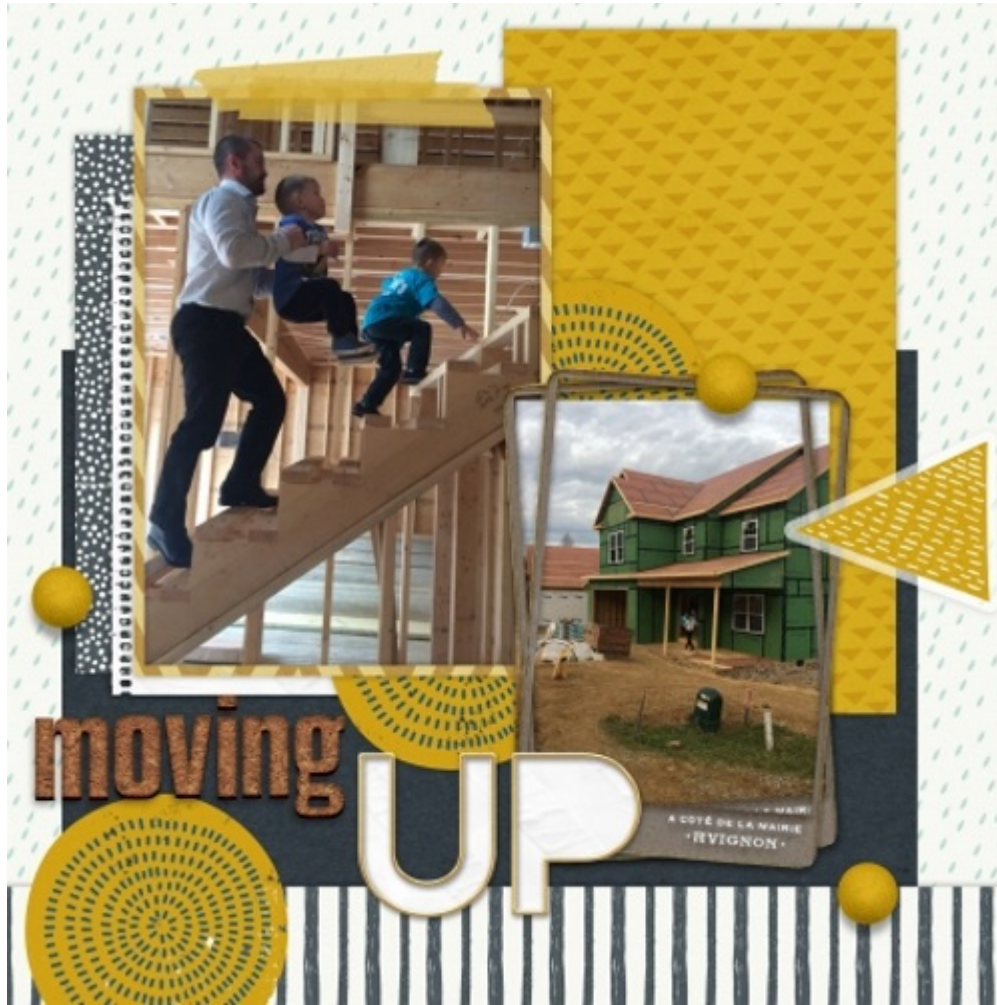
Layout by Erin