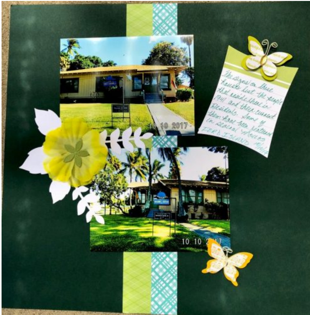
Layout by T-towngirl