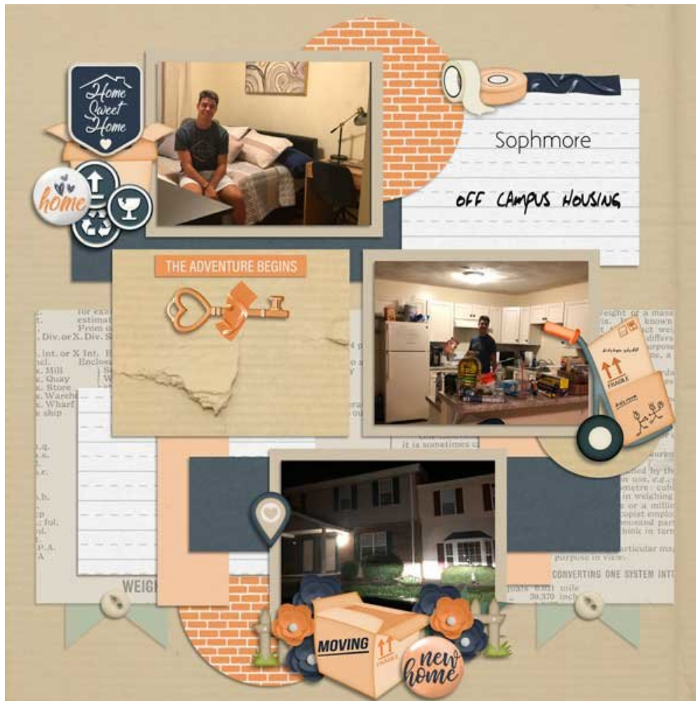
Layout by Paula