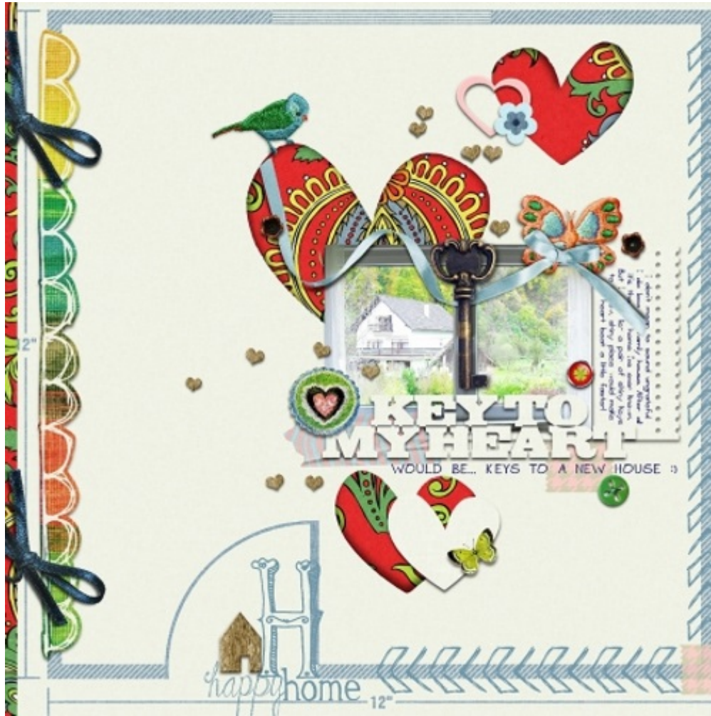
Layout by Paddy