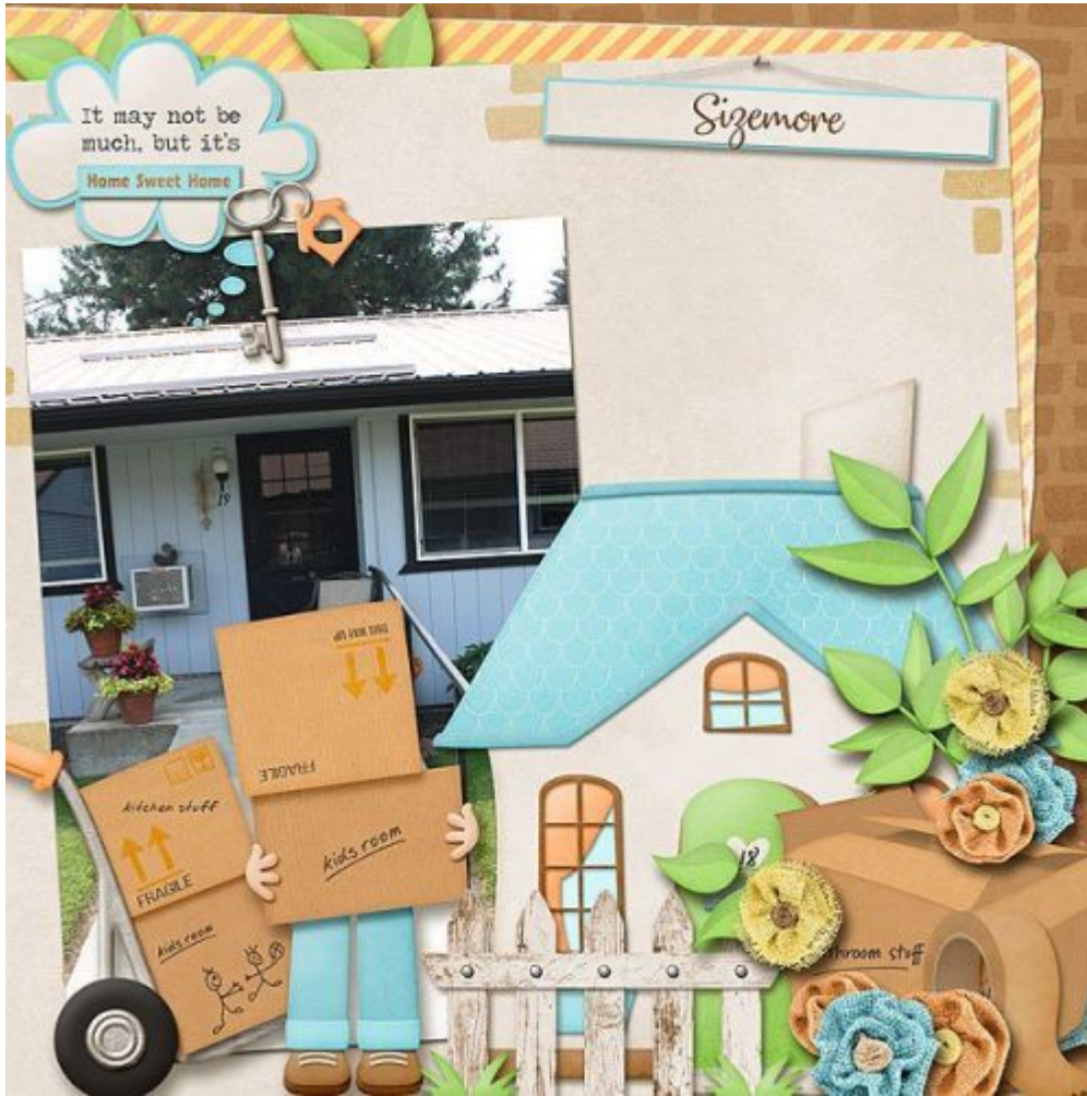
Layout by Robin