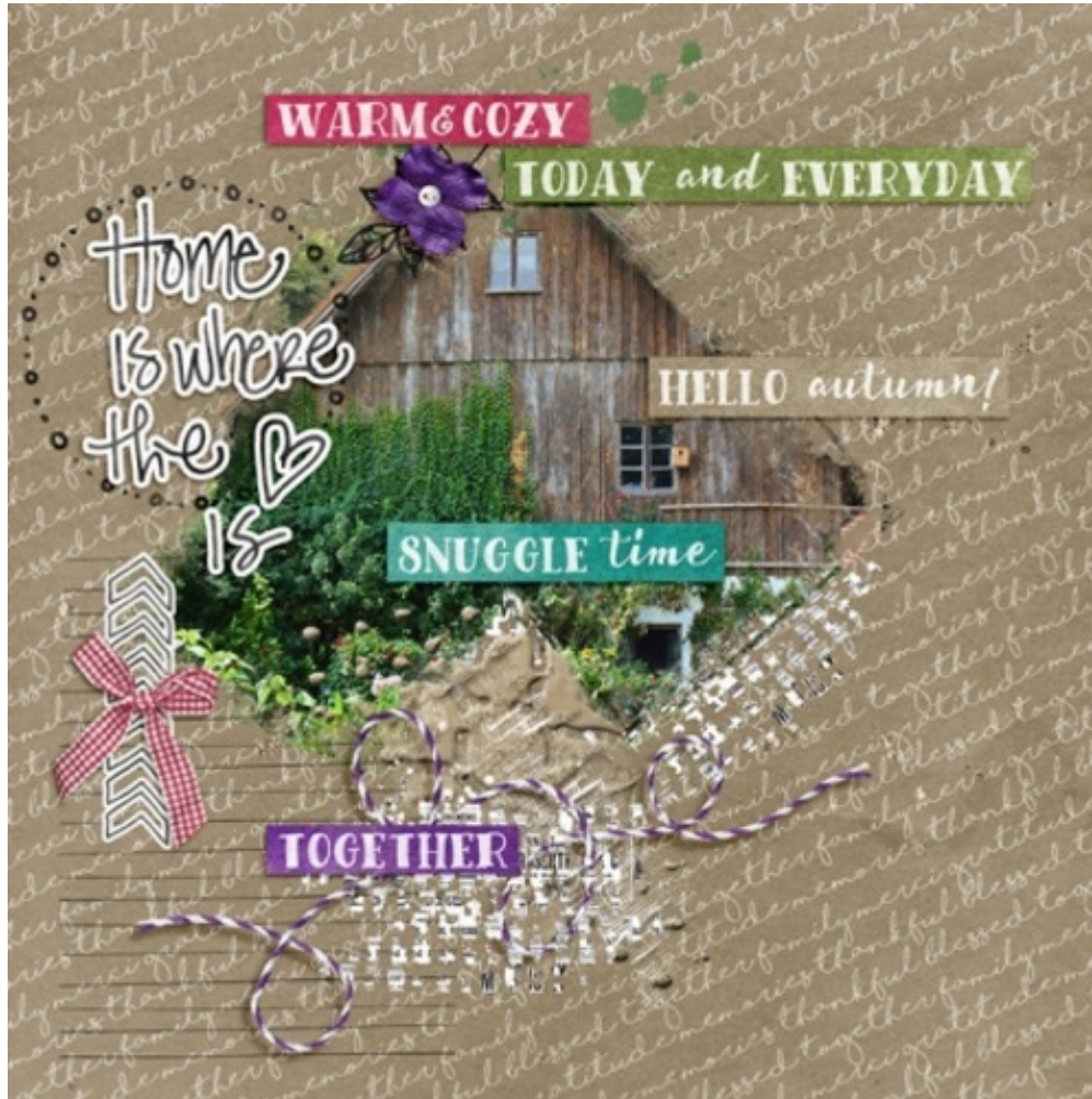
Layout by Anne