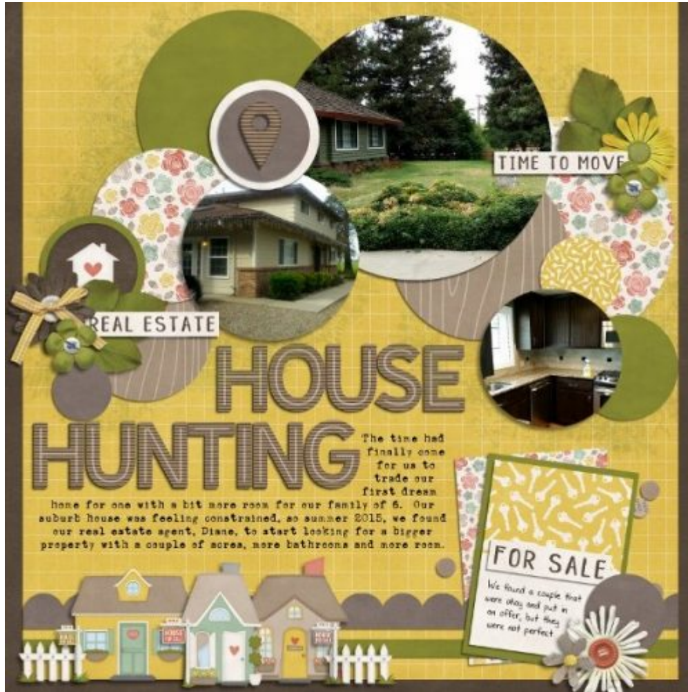
Layout by Meagan