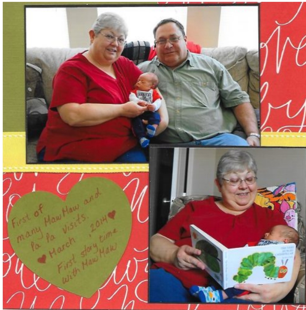
Layout by Deanna