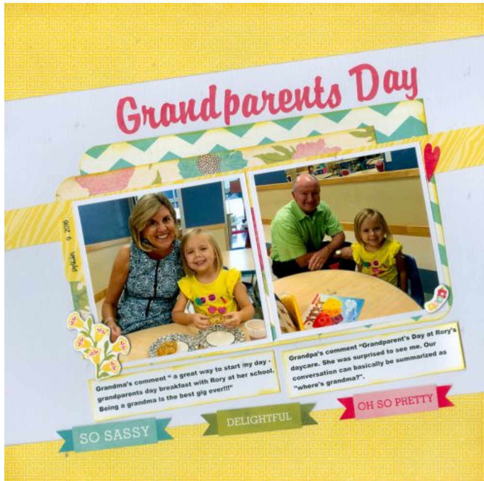
Layout by Pam