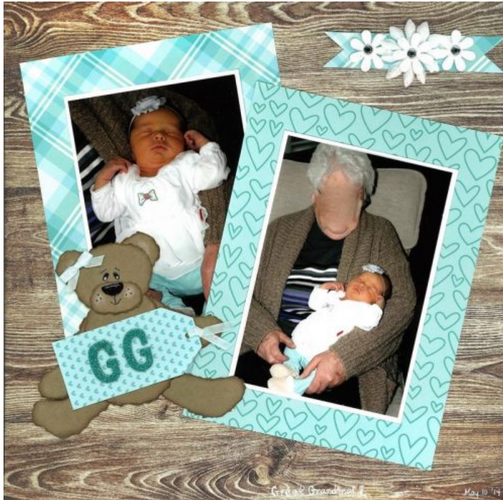
Layout by Judy