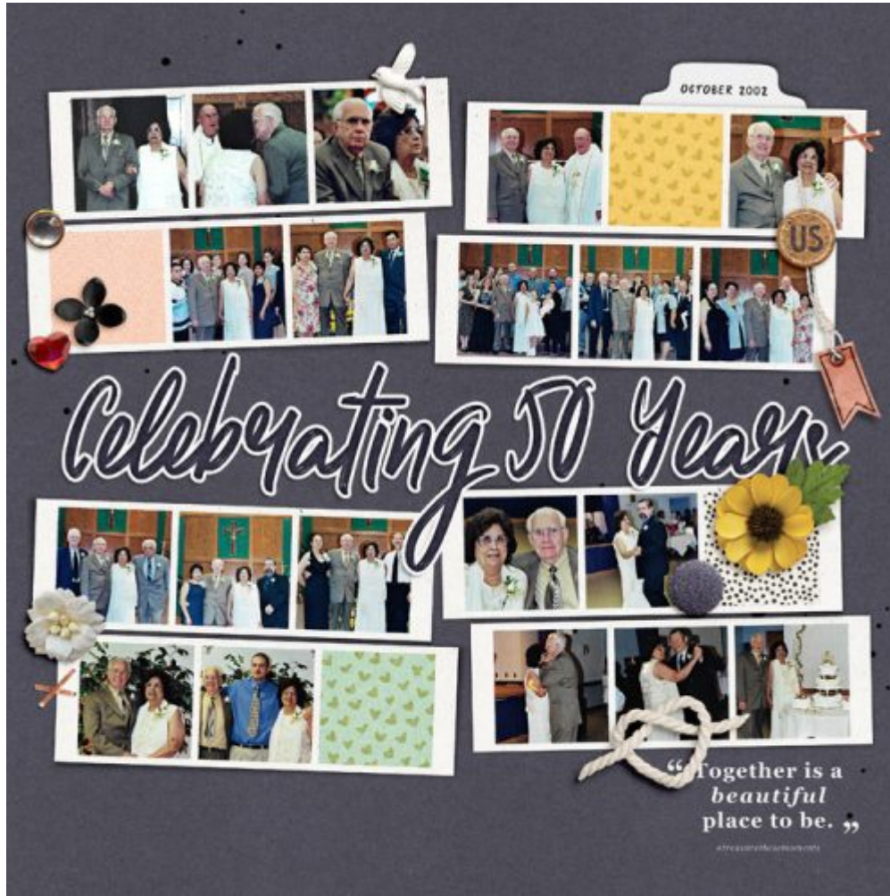
Layout by Carrie