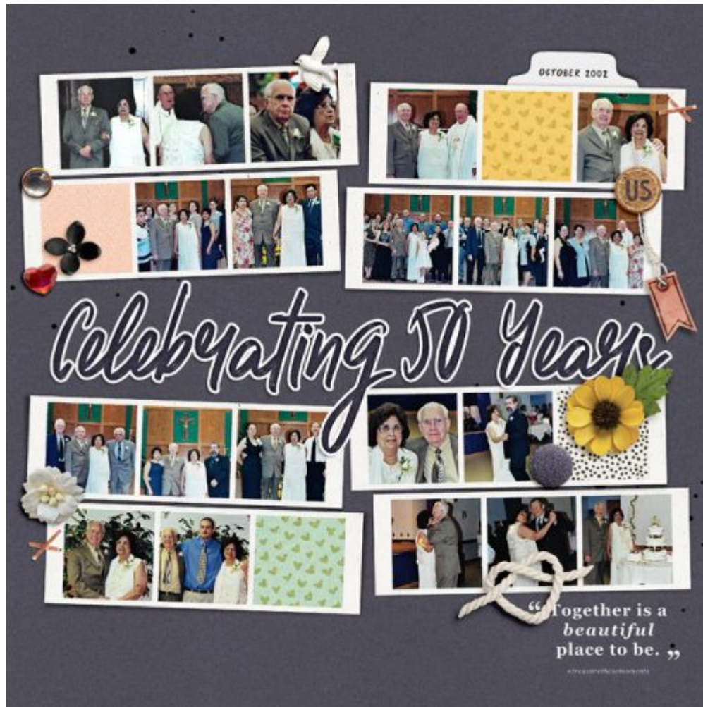
Layout by Carrie