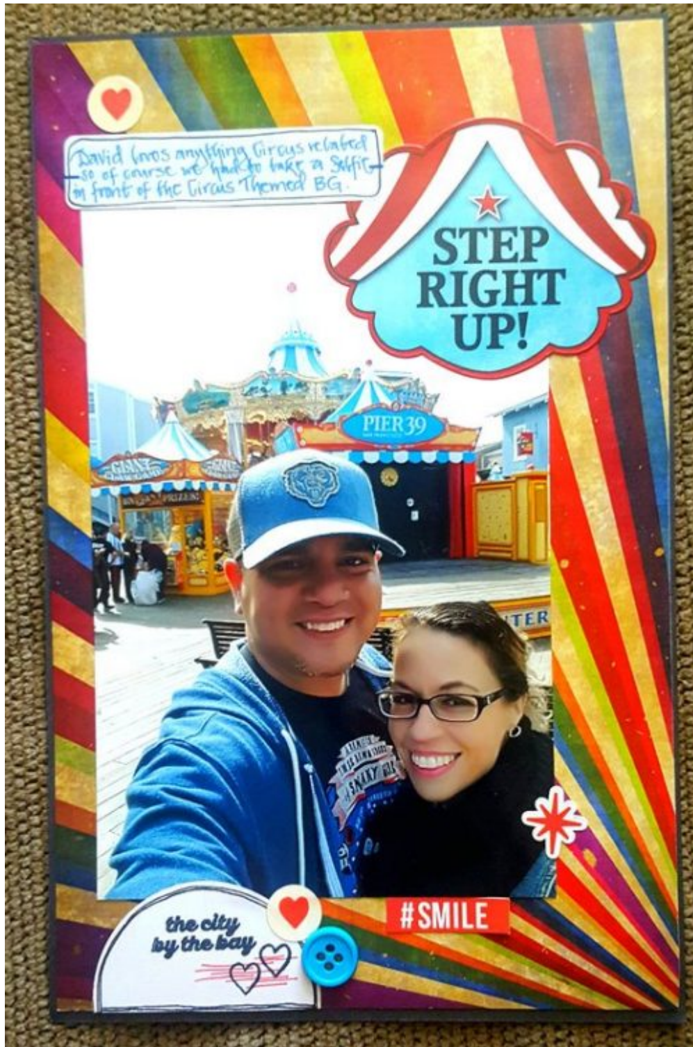
Layout by Doreena