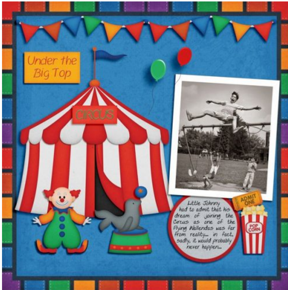
Layout by Betsyfru