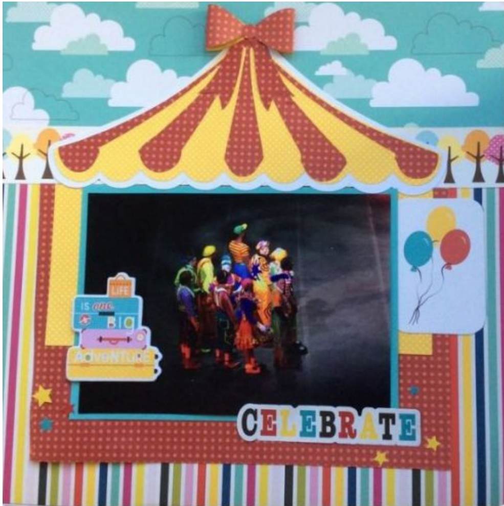
Layout by Shawnacreate