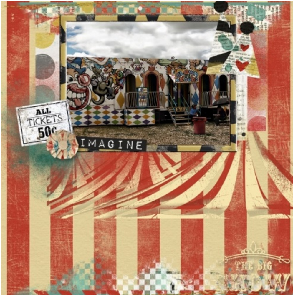
Layout by Emily