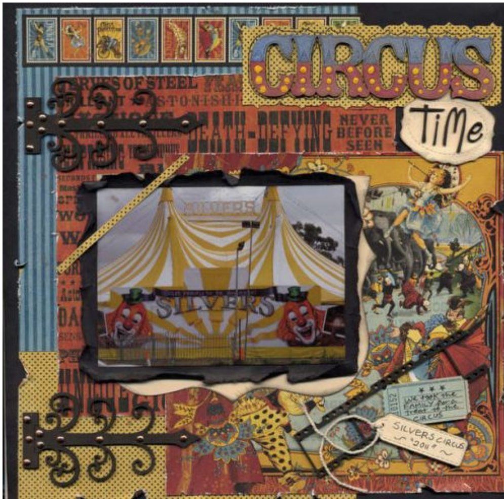
Layout by Jill