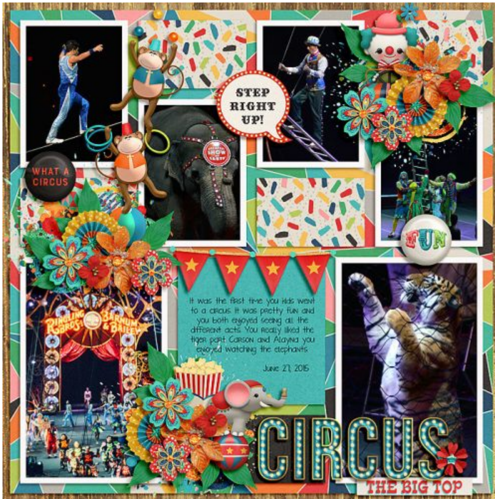
Layout by Mary