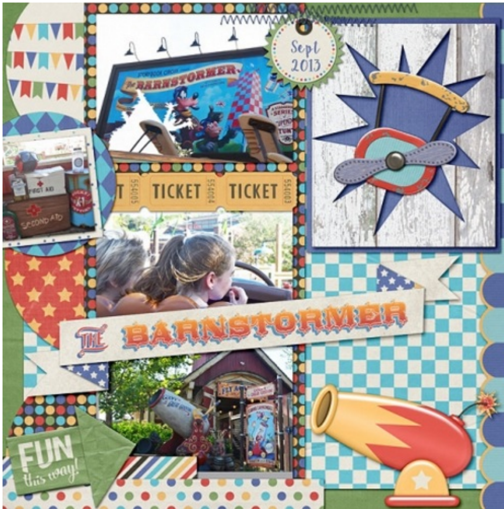
Layout by Marina