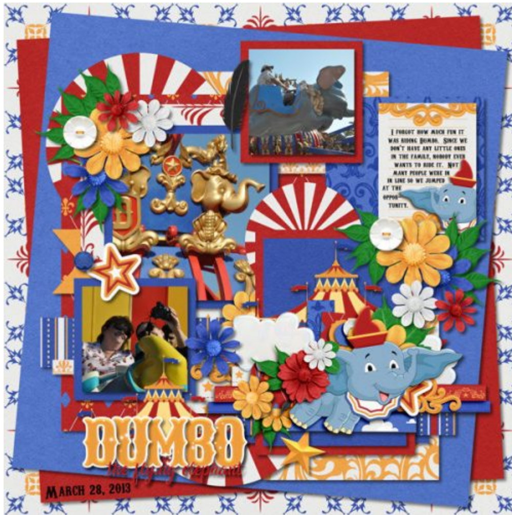
Layout by Charlene