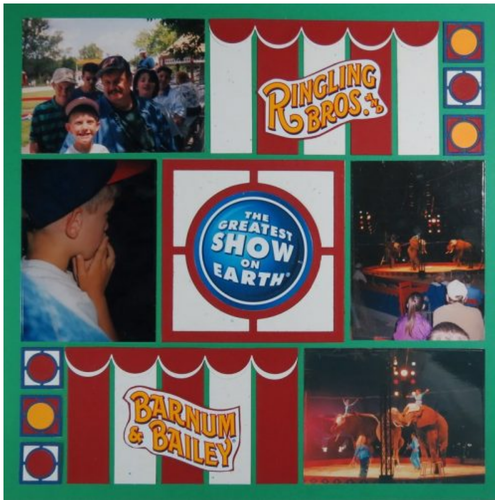
Layout by Andrea

most circus shows perform at a fixed venue regularly or seasonally.