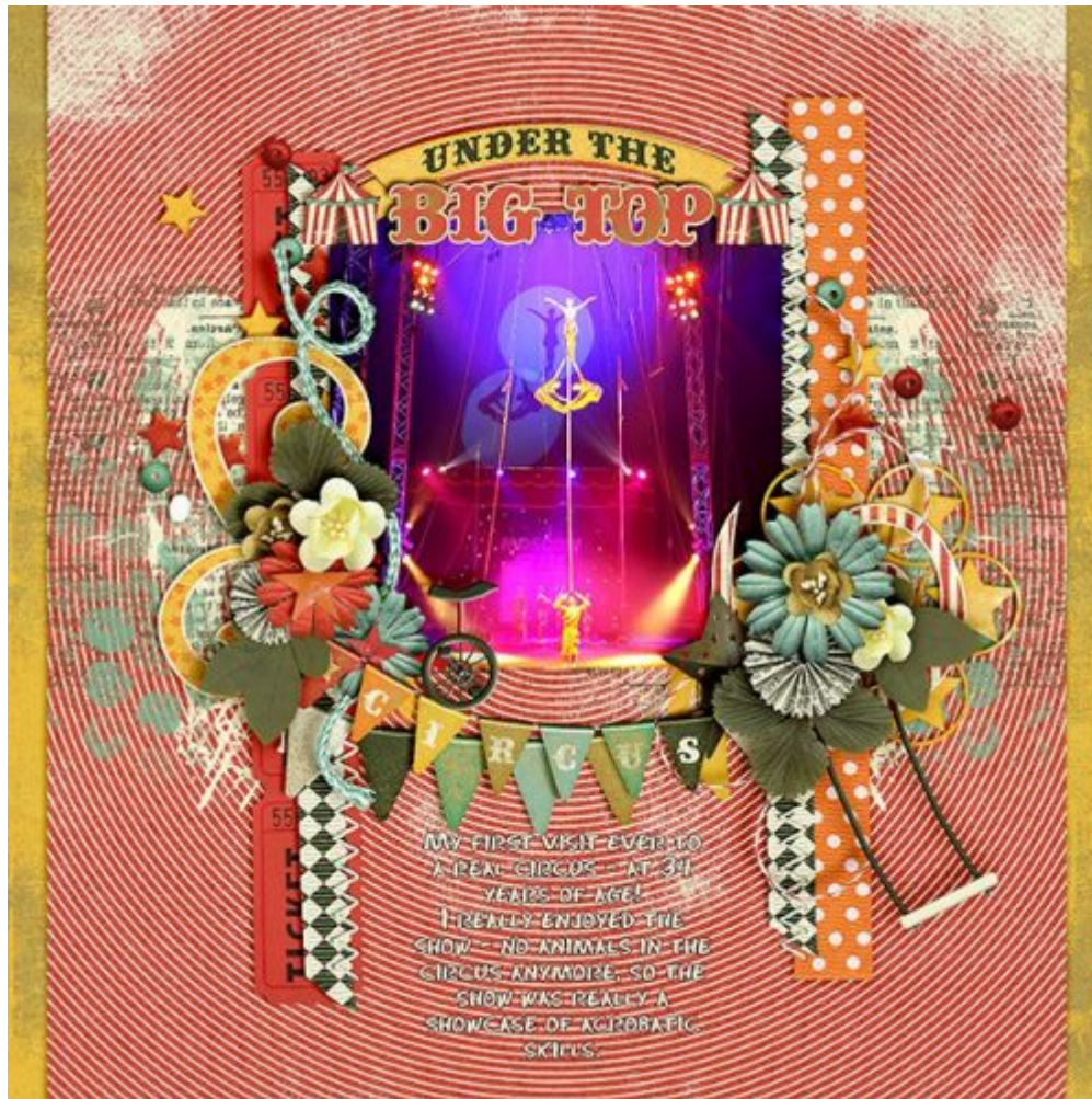
Layout by Christelle