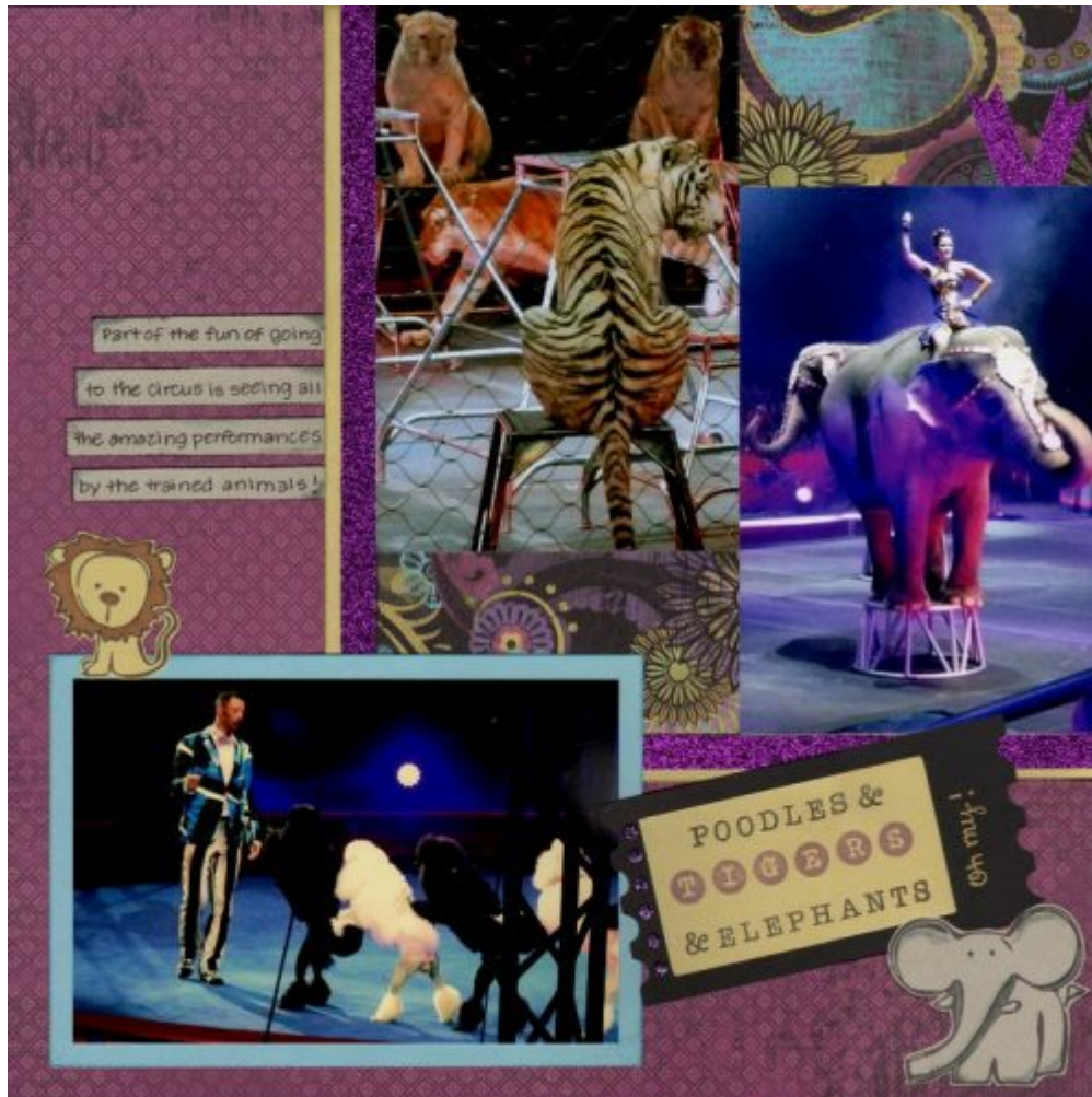
Page by Cheryl