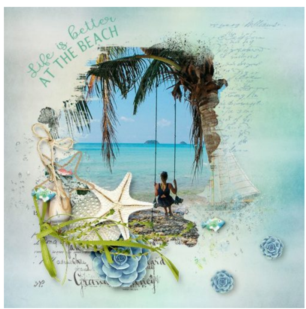
Page by Henriëtte