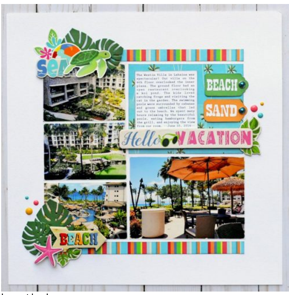
Layout by Jana