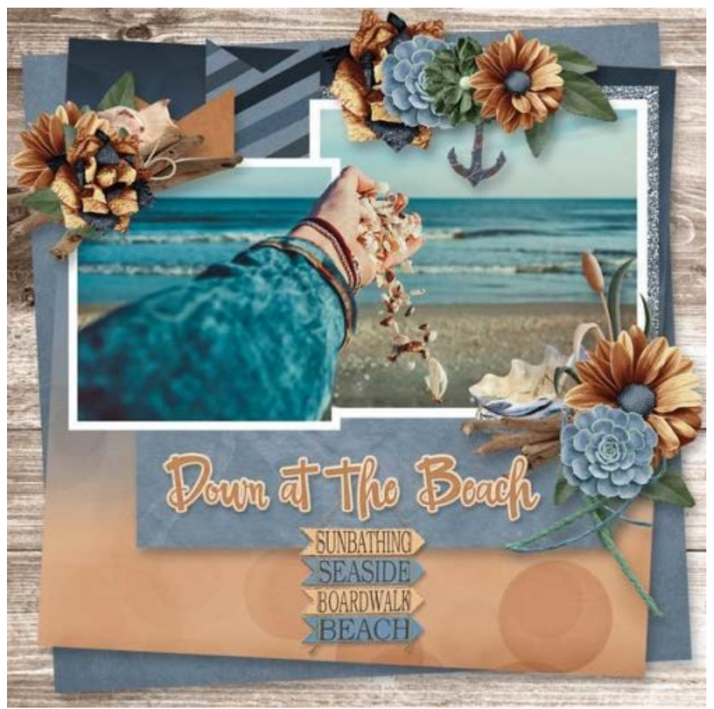
Layout by Stacey