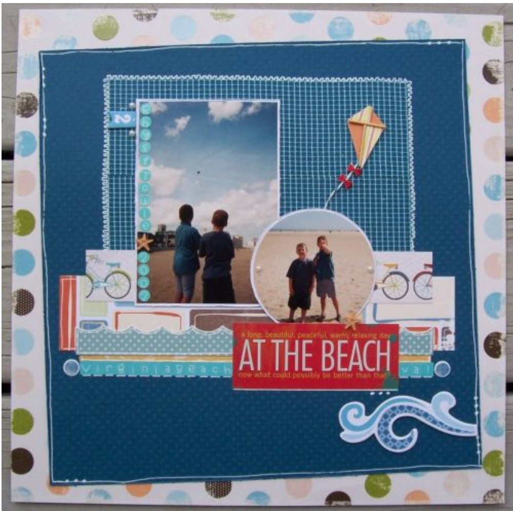
Layout by Jenny