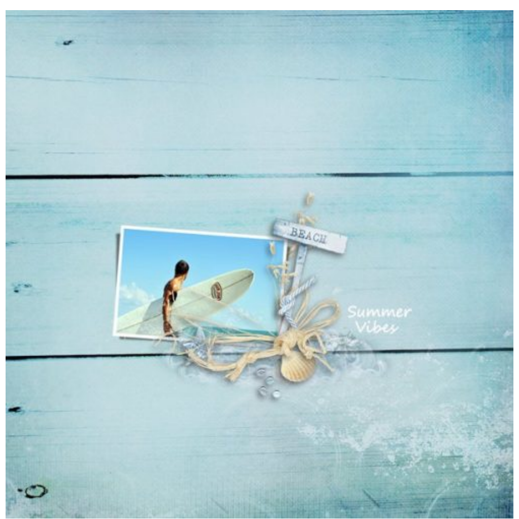
Layout by Sylvia