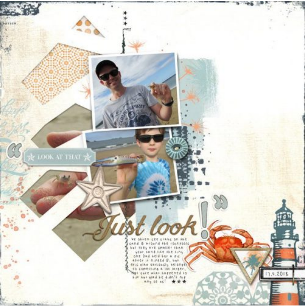
Layout by Justine