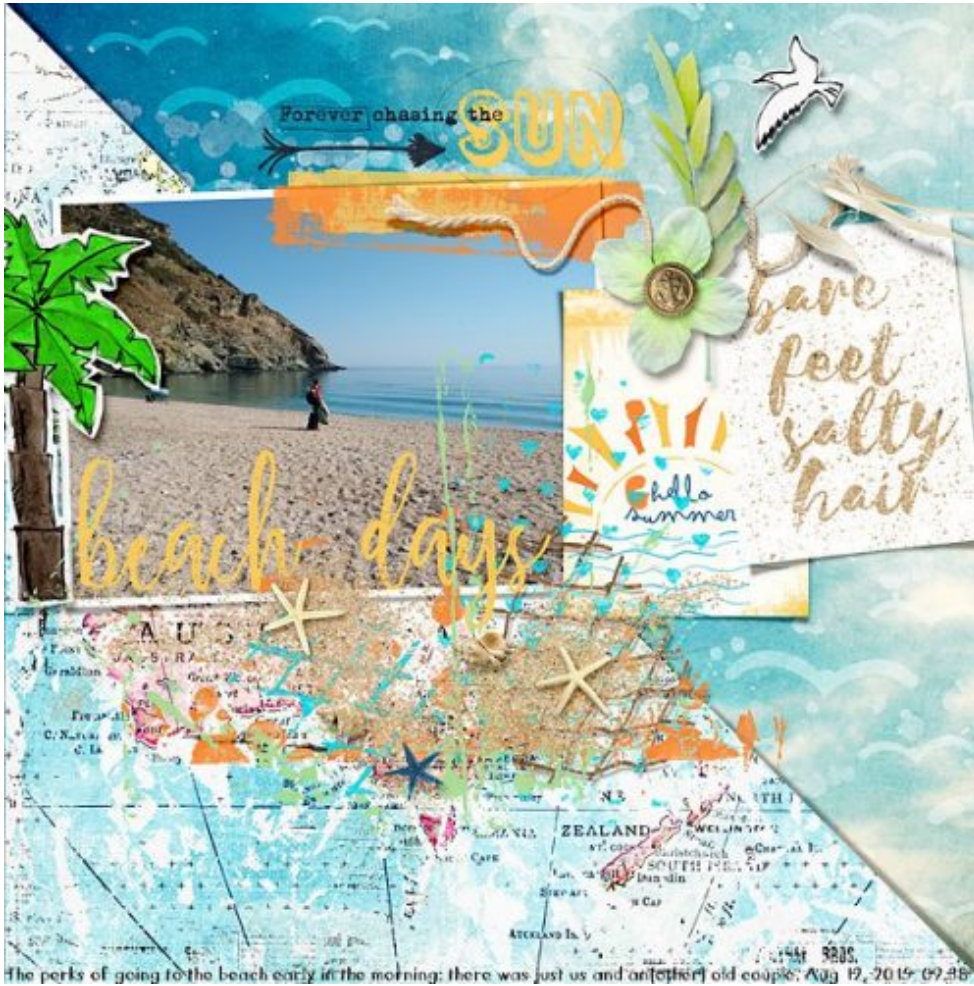
Layout by Cindy