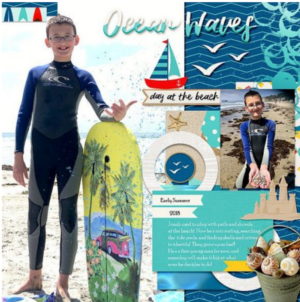
Layout by Deanna