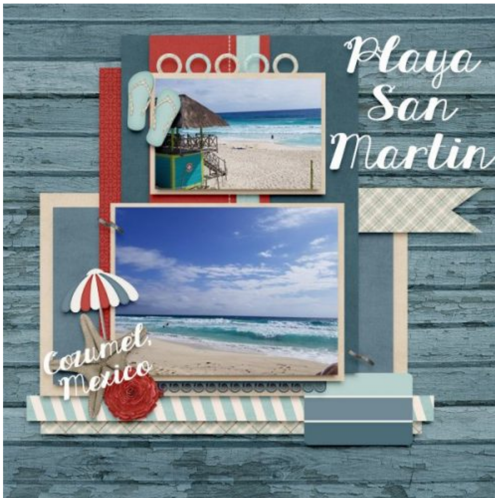
Layout by Stephanie