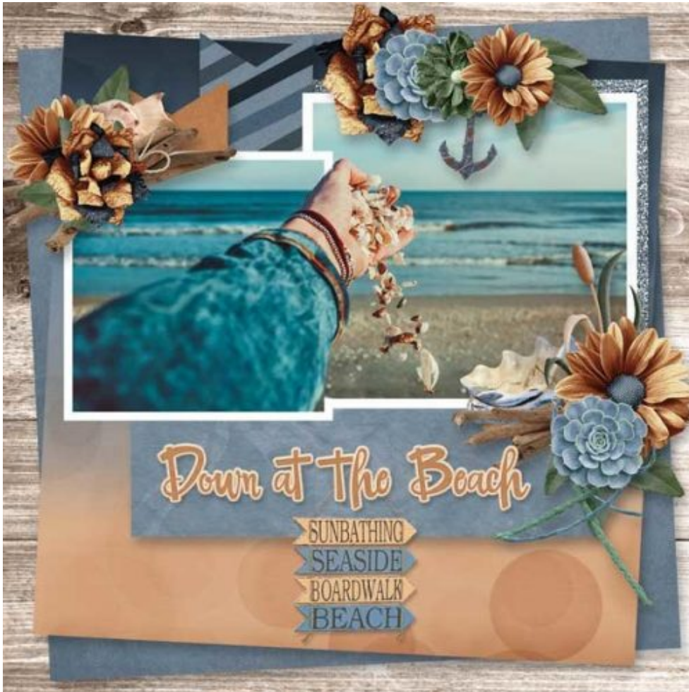
Layout by Stacey