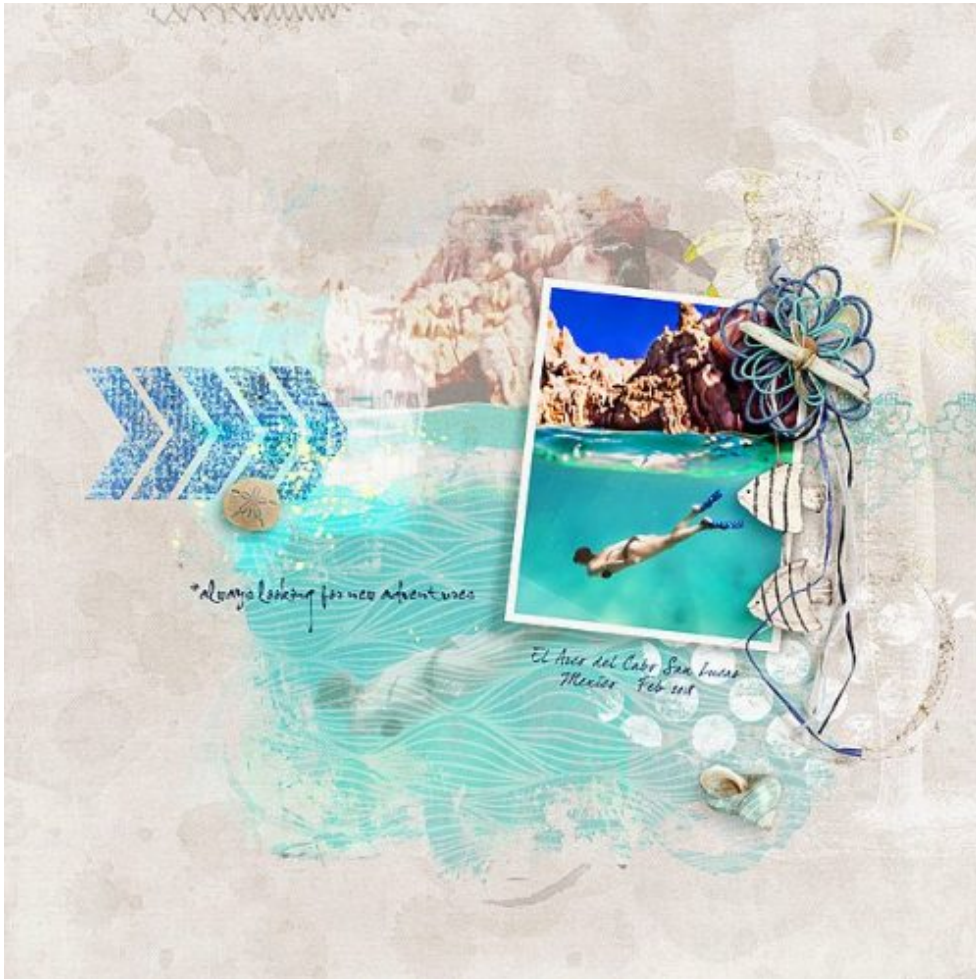
Layout by Angie