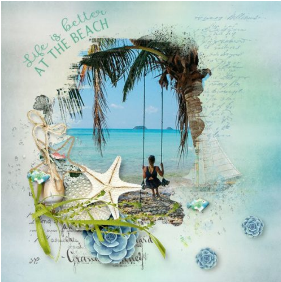
Layout by Henriëtte