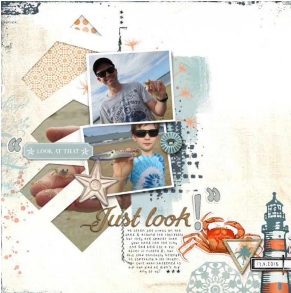
Layout by Justine