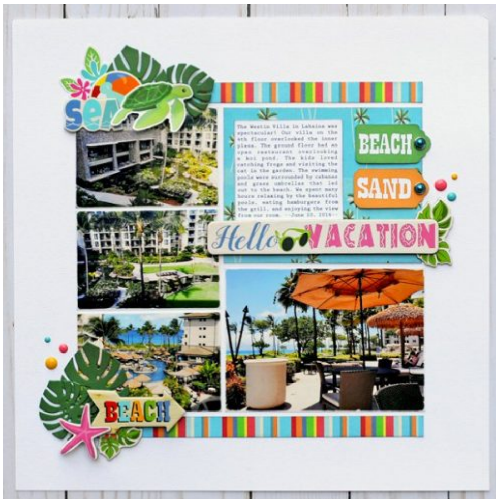
Layout by Jana