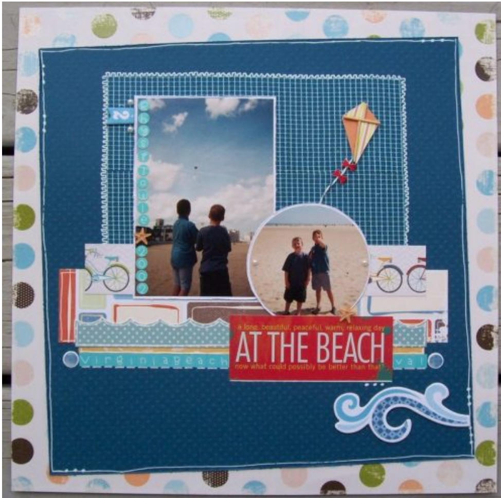
Layout by Jenny