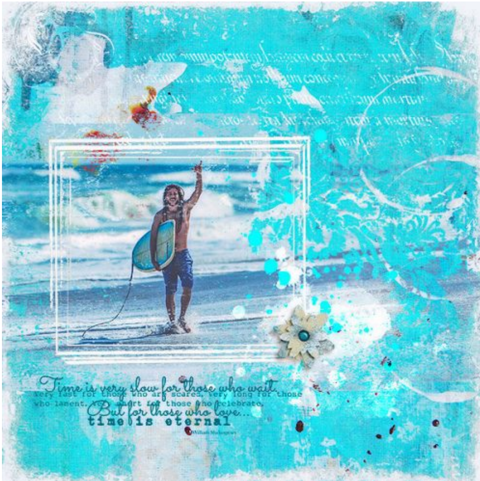
Layout by Kerstin