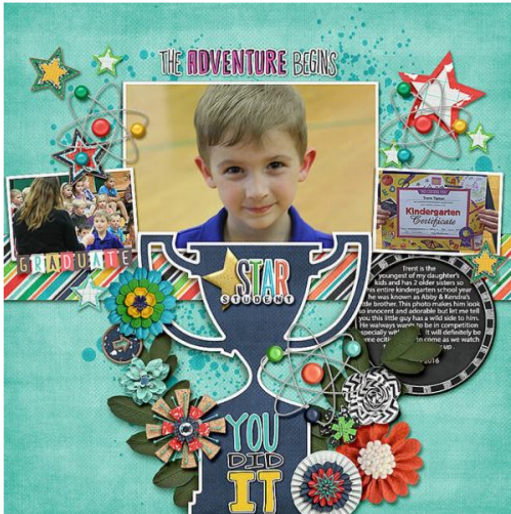
Page by Debbie