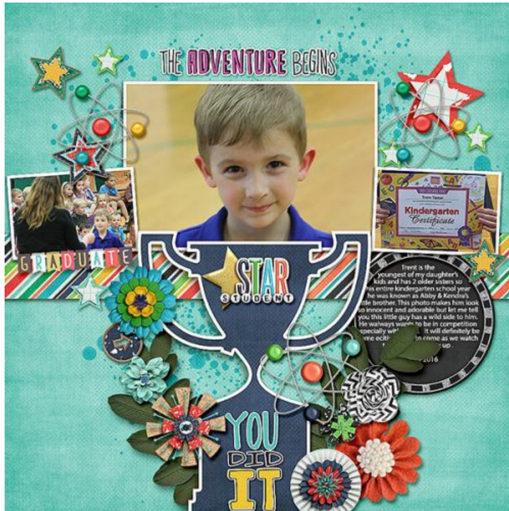
Page by Debbie