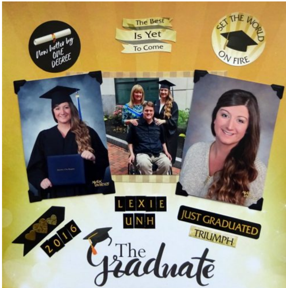
Layout by Tisha