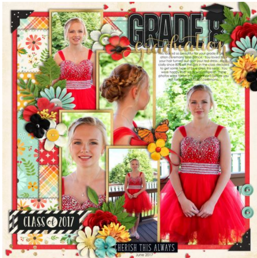
Layout by Cindy