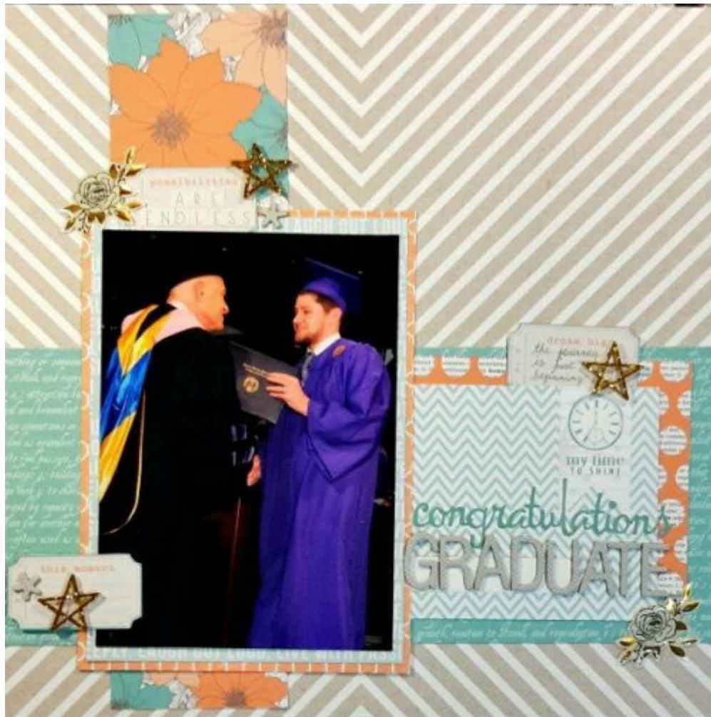
Layout by Anissa