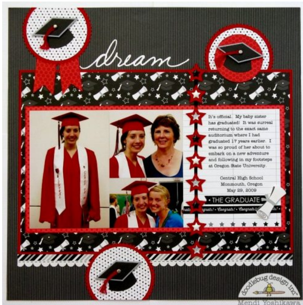
Layout by Mendi