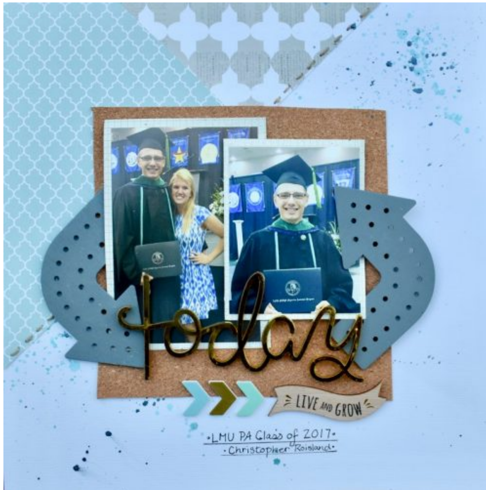
Layout by Bethany