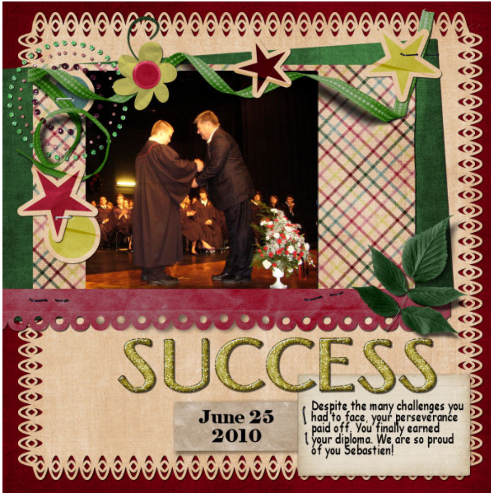
Layout by Cassel