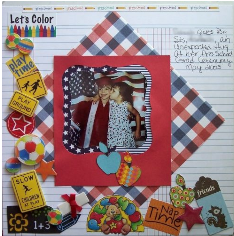
Layout by Betsey