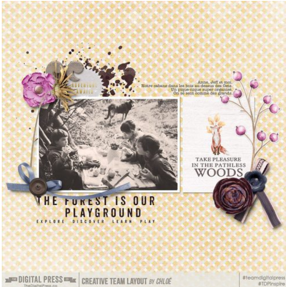
Layout by Chloé