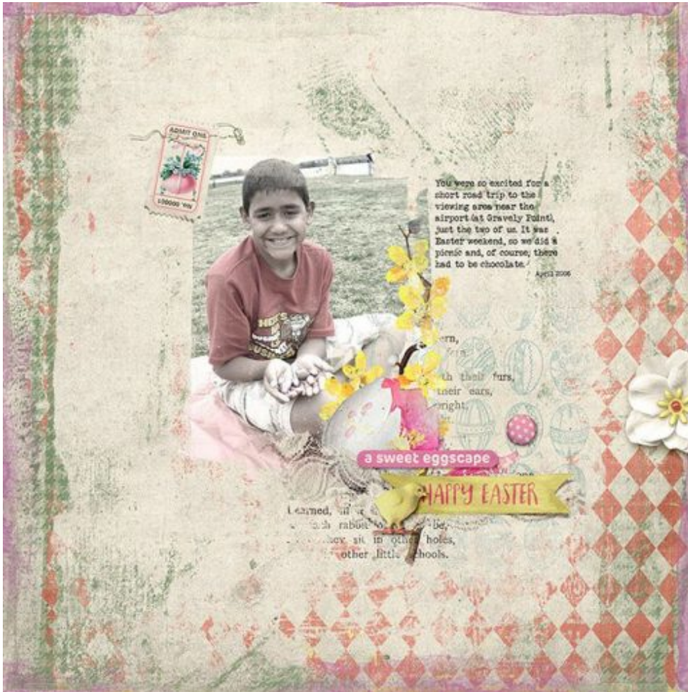
Layout by Eggscapade