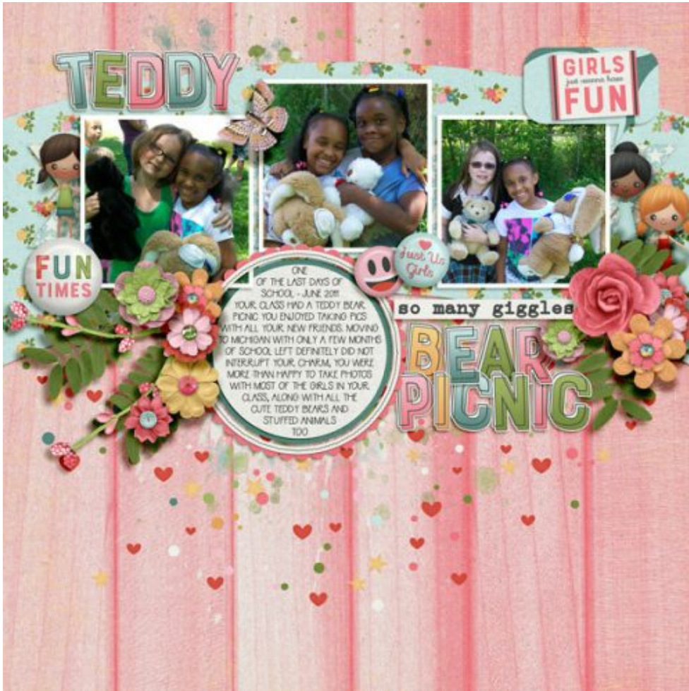
Layout by Kiana