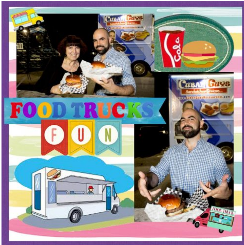
Layout by Ana