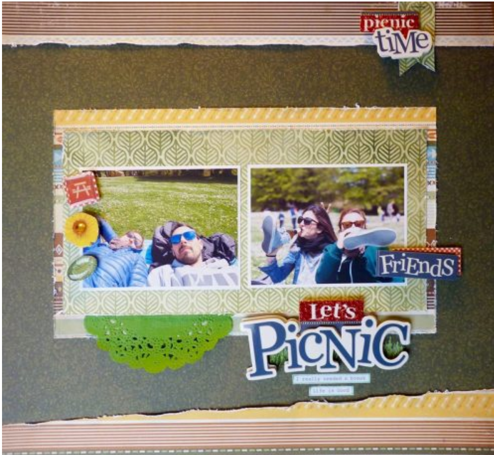
Layout by Giorgia