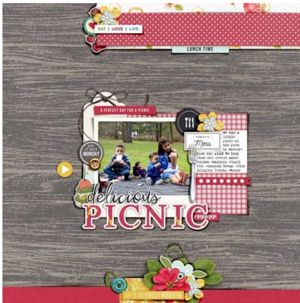
Layout by Maribel

Find a nice patch of grassy plain to set up your blanket and basket. You can lie down and watch the clouds. Kids especially love sitting down on the grass and goof around. For sure, there are a lot of memories you treasure with those grassy picnics!