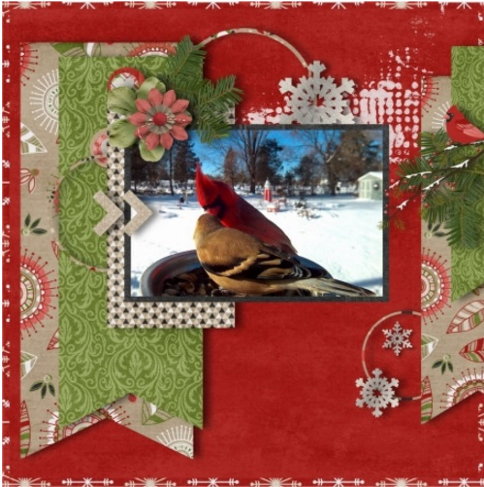
Layout by Ruth