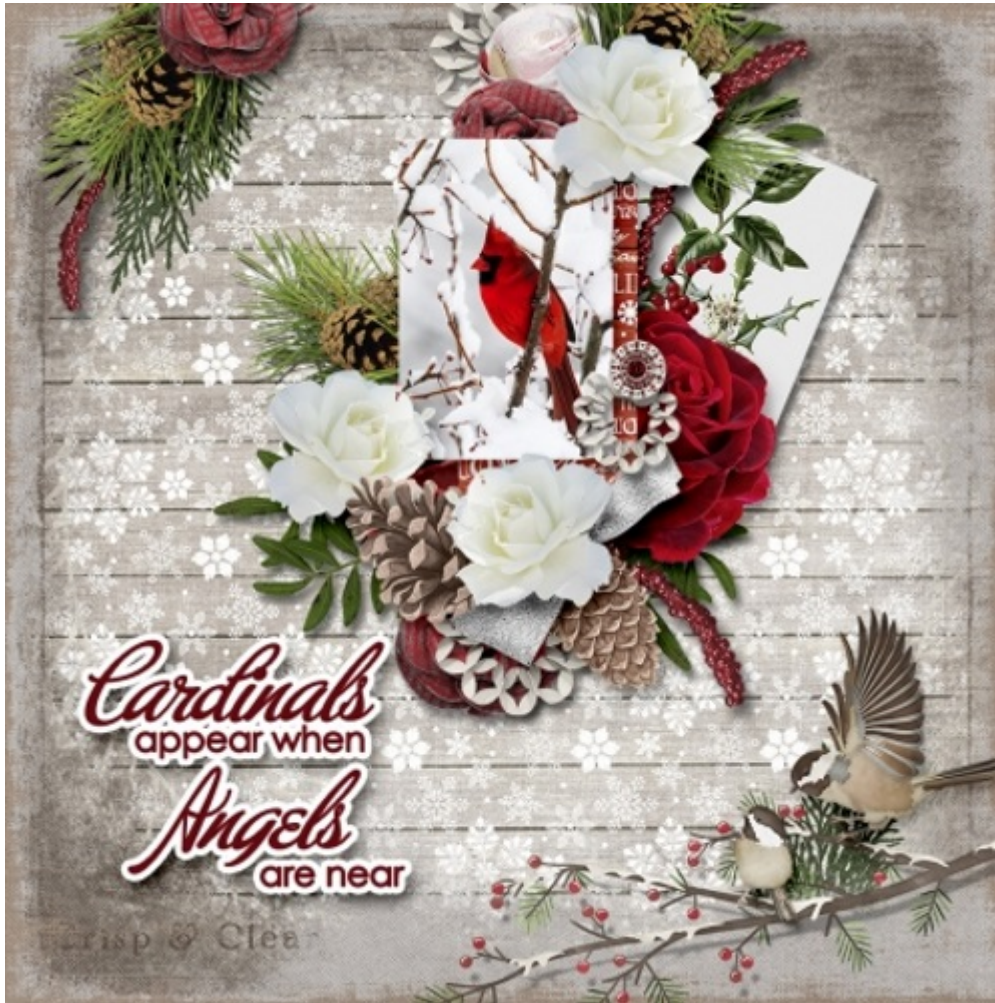
Layout by Cynthia