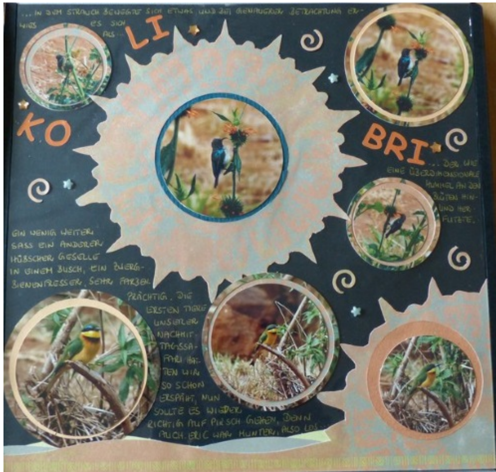
Layout by Ariane