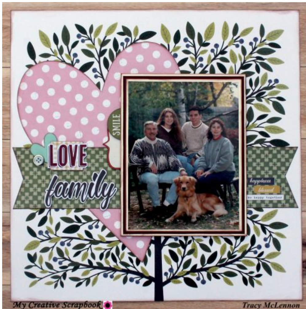
Layout by Tracy