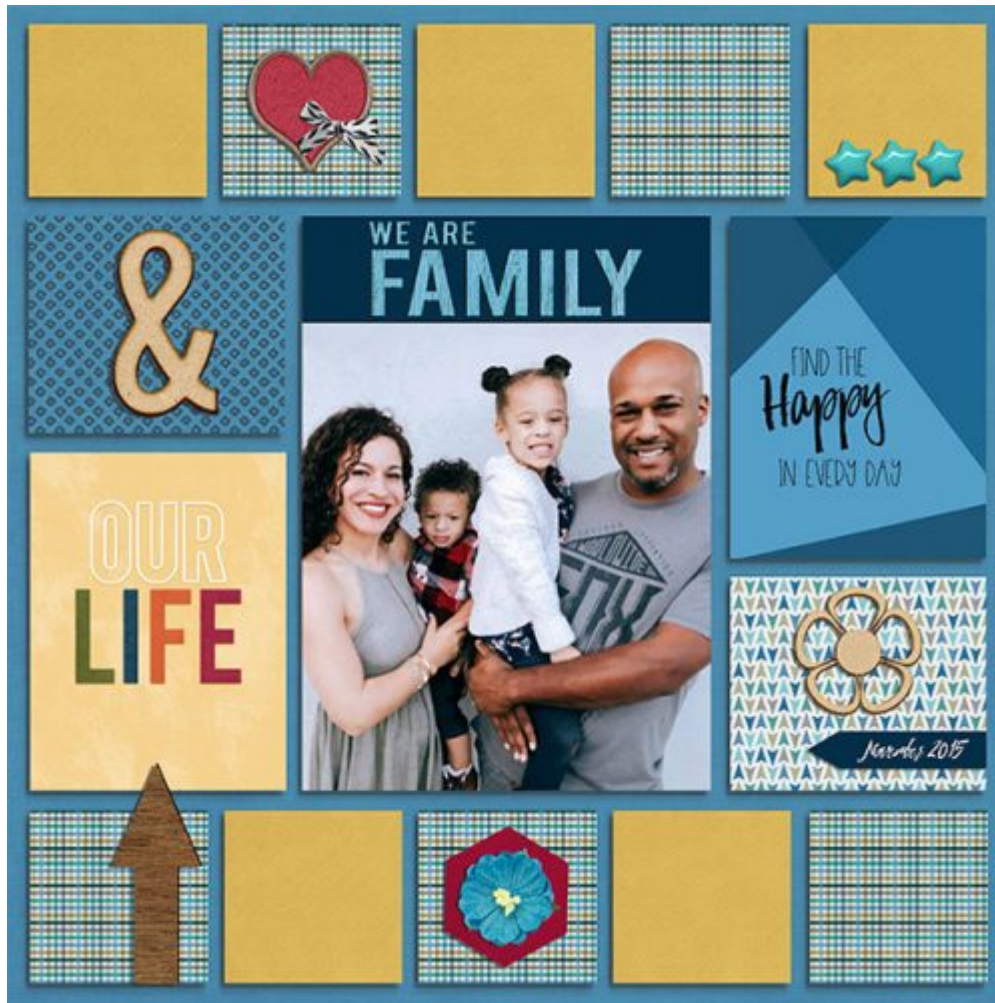
Page by chigirl