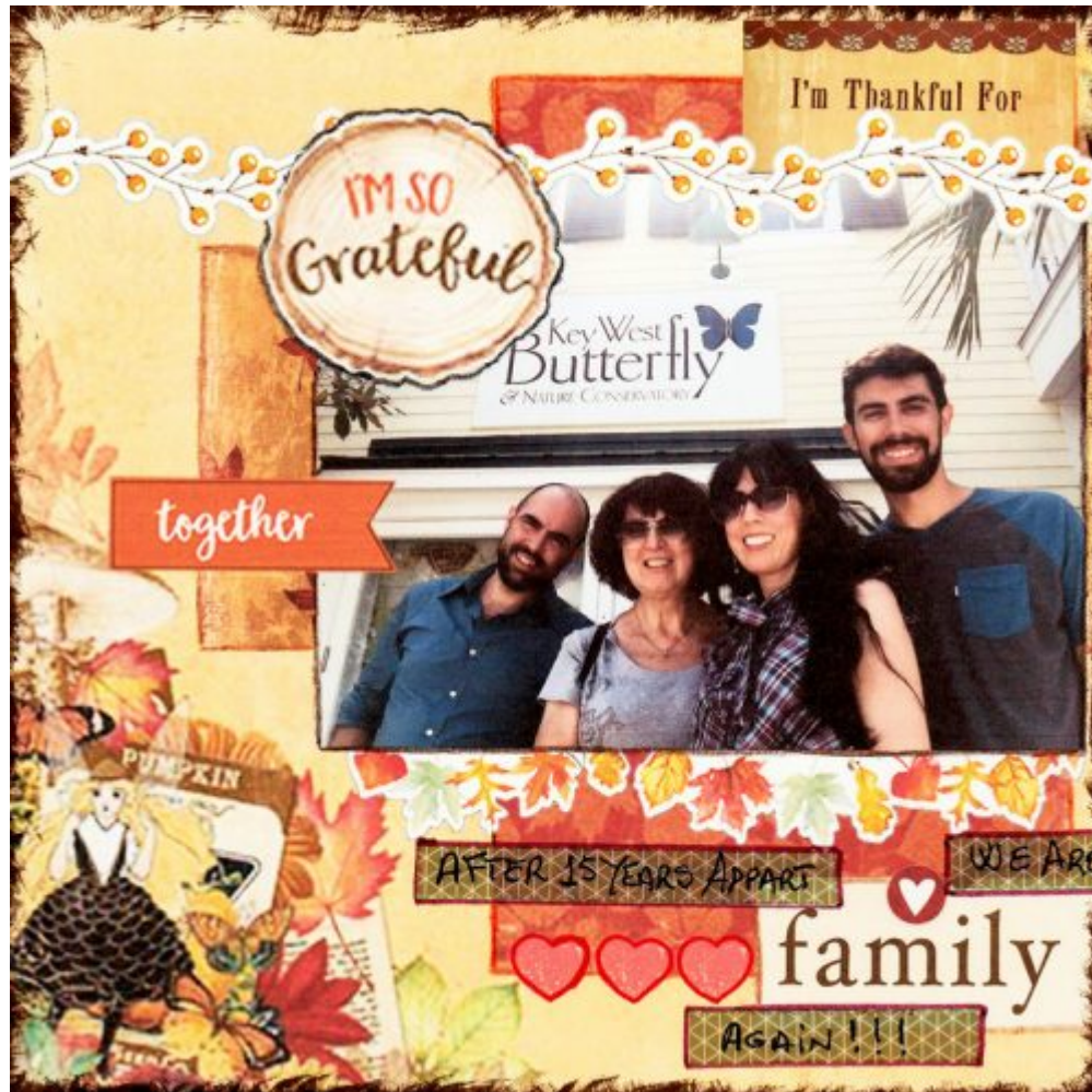
Layout by Ana