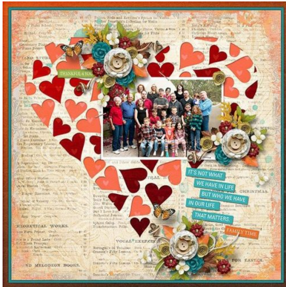
Layout by Connie