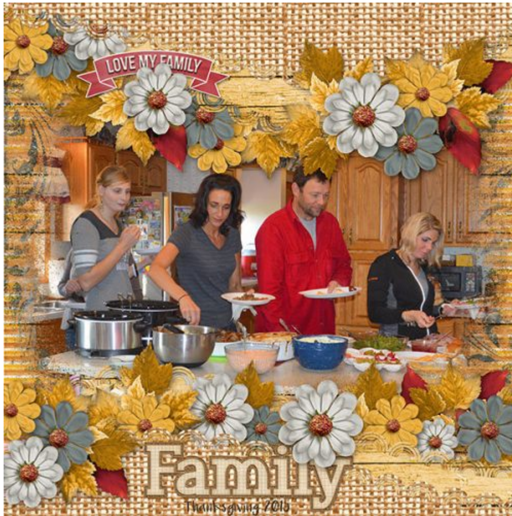
Layout by Joyce