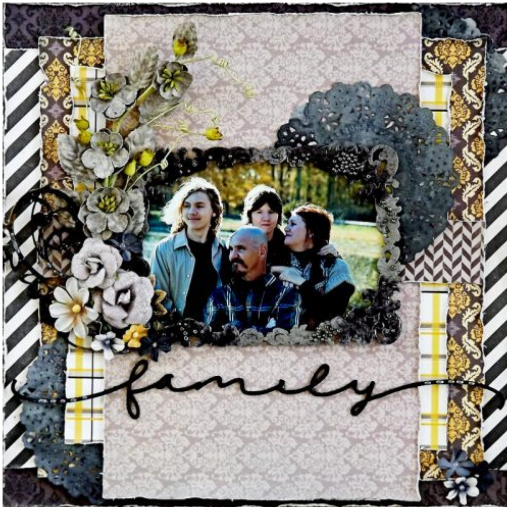
Layout by AngelBearMama