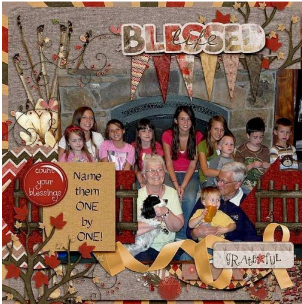
Page by DeannaJ