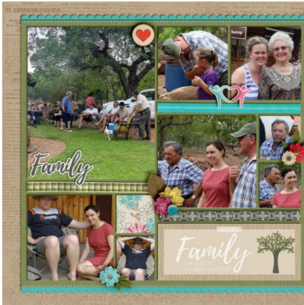
Layout by Christelle