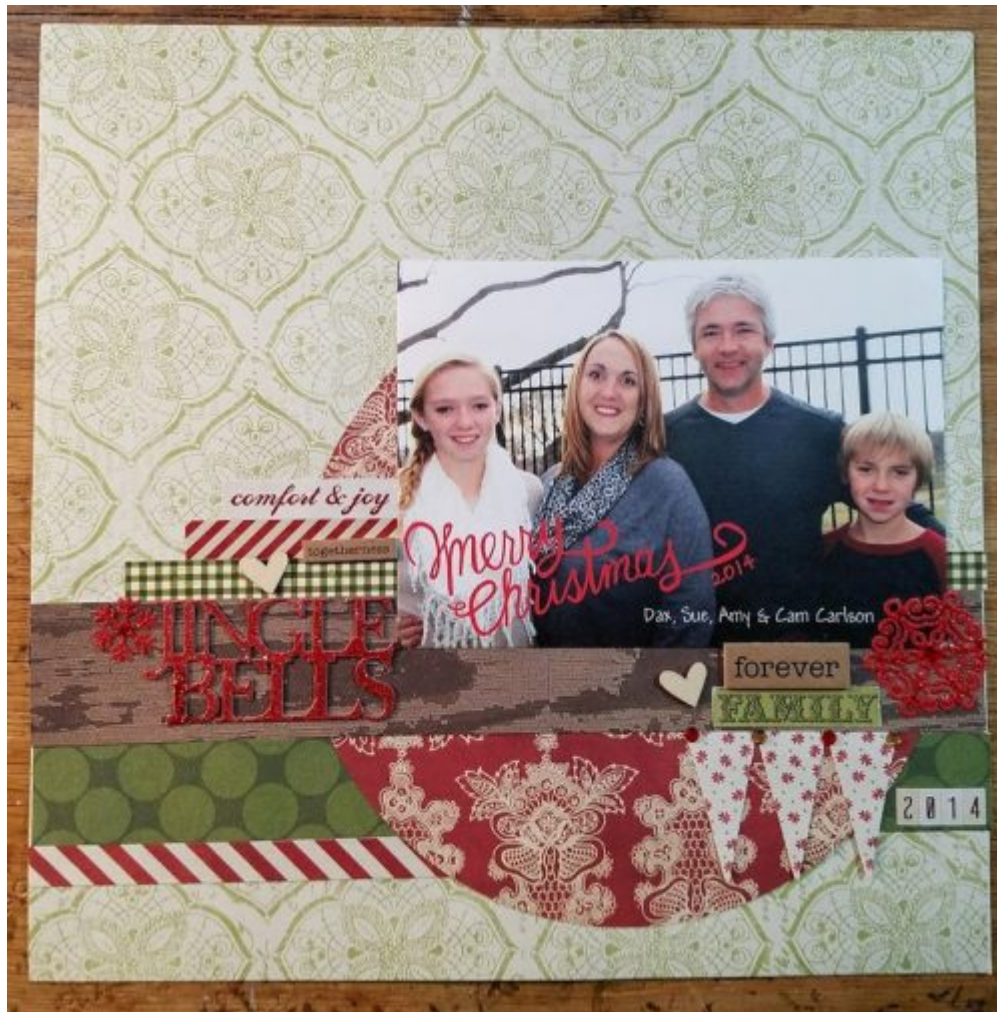
Layout by Scarlson