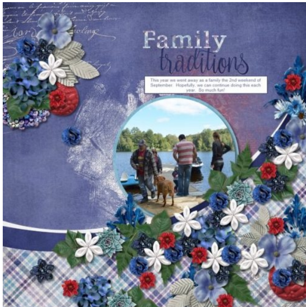
Layout by Maureen