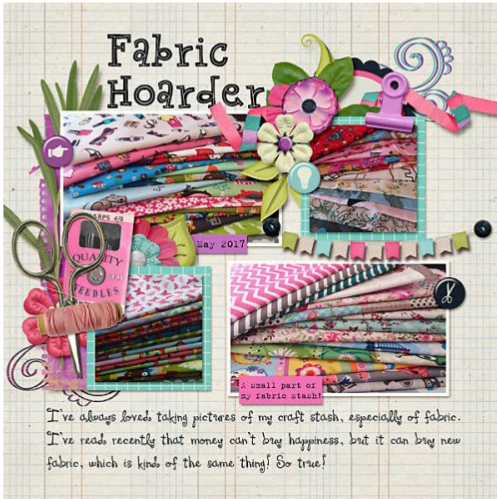
Layout by Cindy