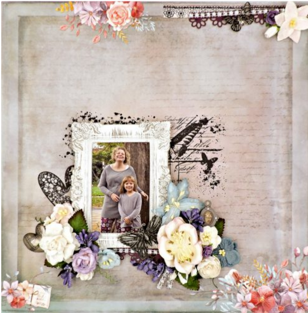
Layout by Peggy