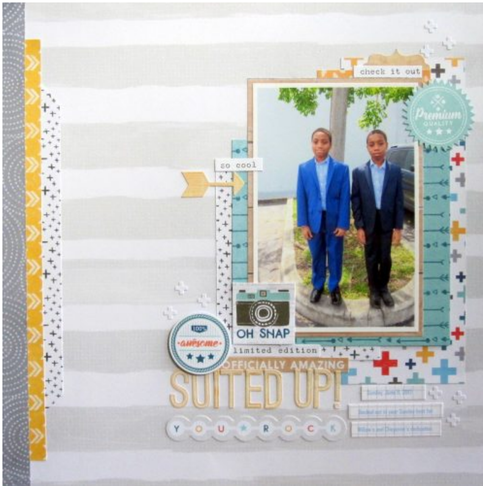
Page by Allison