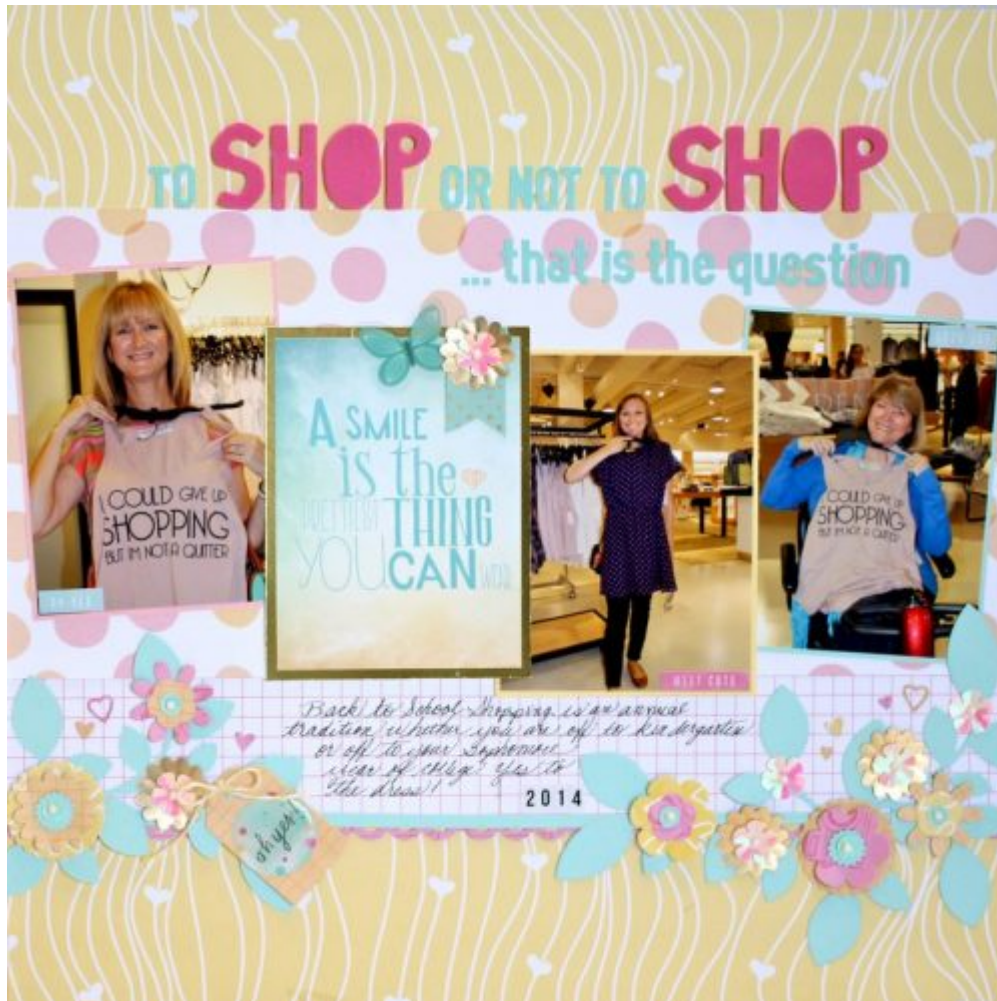
Layout by Sharon