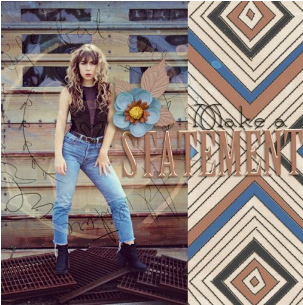
Layout by Lor