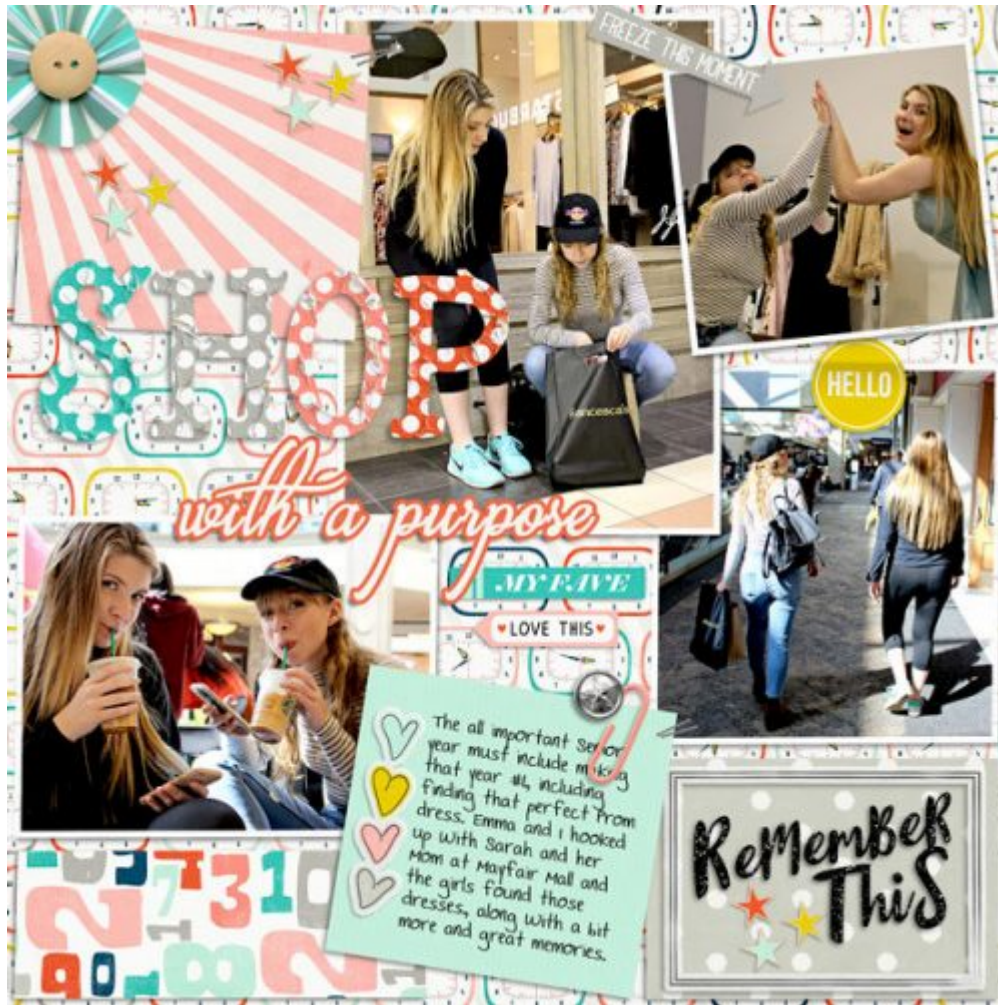
Layout by Lor