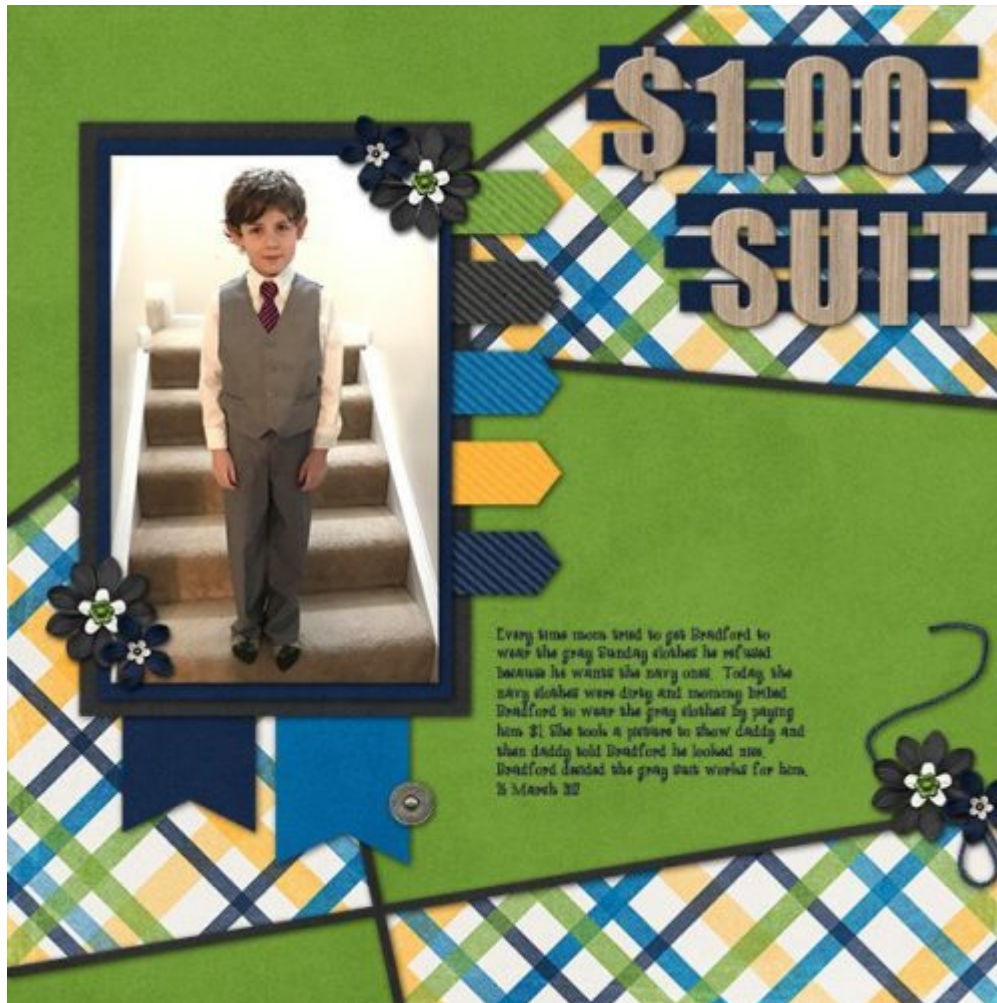
Layout by Lorraine