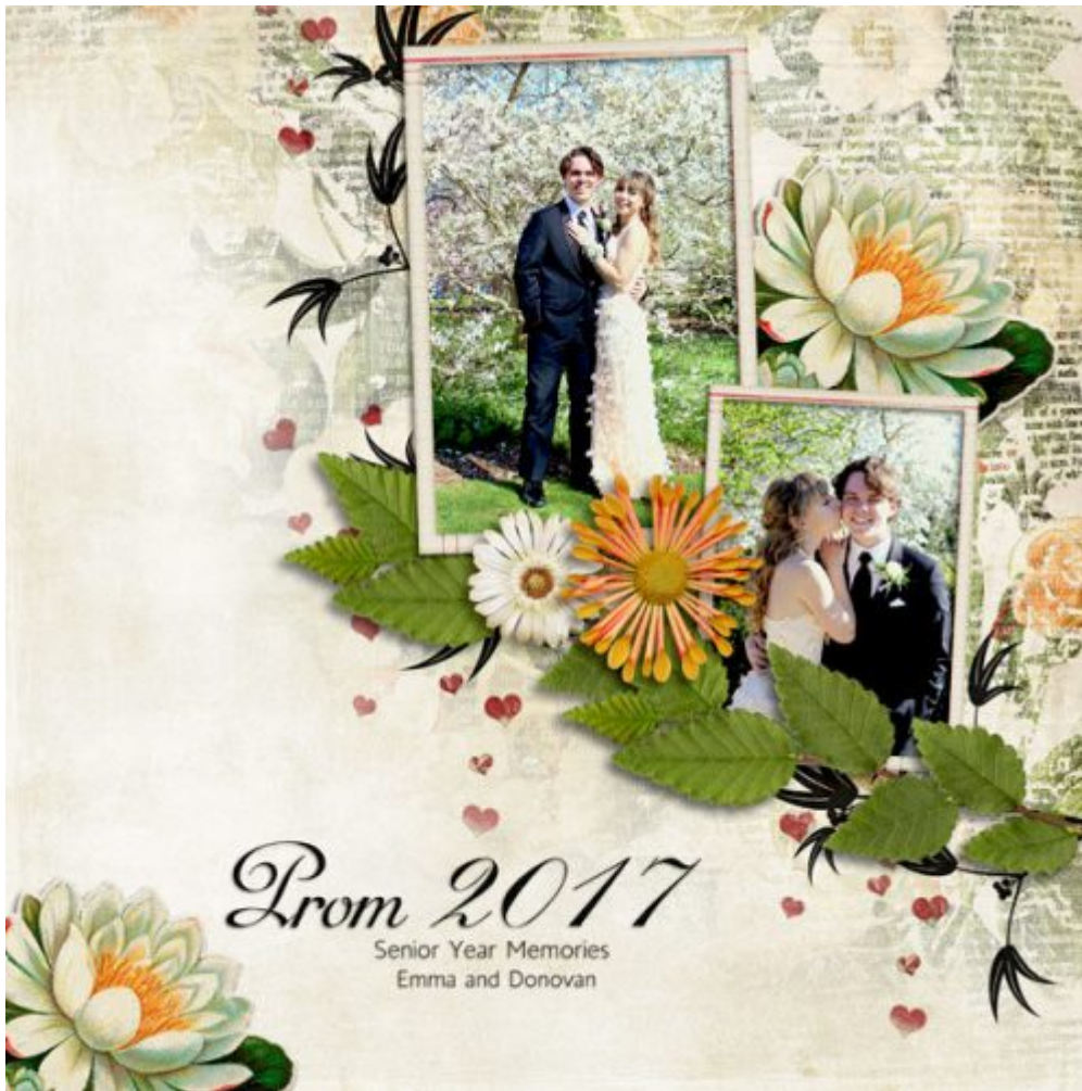
Layout by Lor