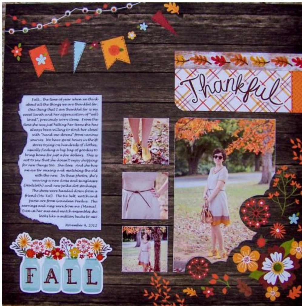
Layout by Betty

Have you ever done a layout or project, all around clothes? A favorite piece of clothing of yours? Or that odd looking tie you got for Christmas? Maybe that cute outfit for a young child? Or how about the time when your child decided to play dress up with grown-up clothes? If you have not thought about it, go for it now.