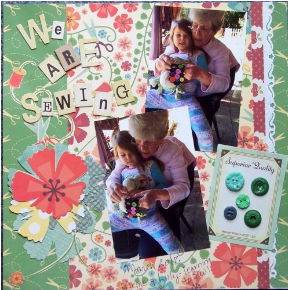
Layout by Memex9