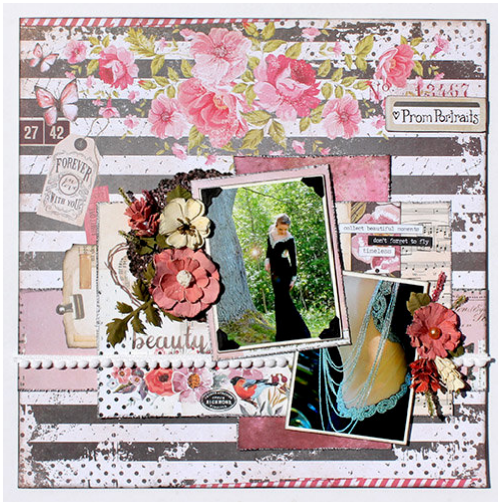
Layout by Tracy