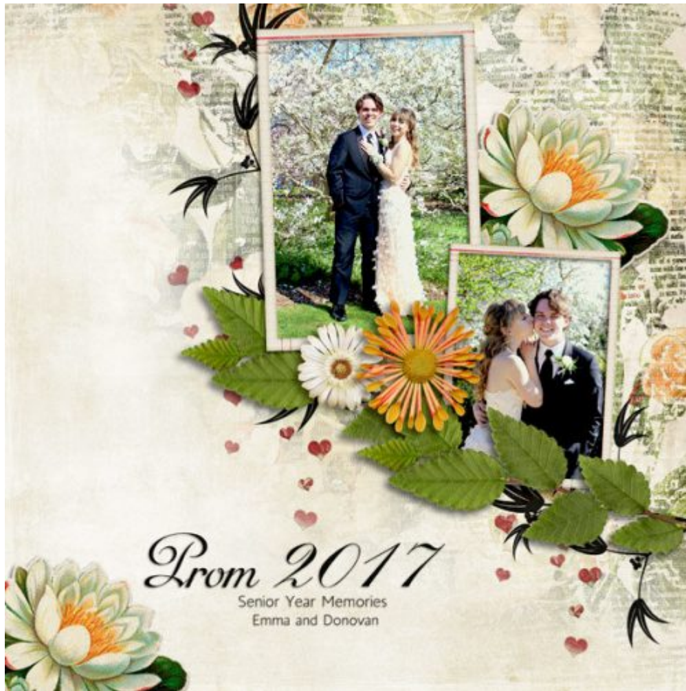
Layout by Lor