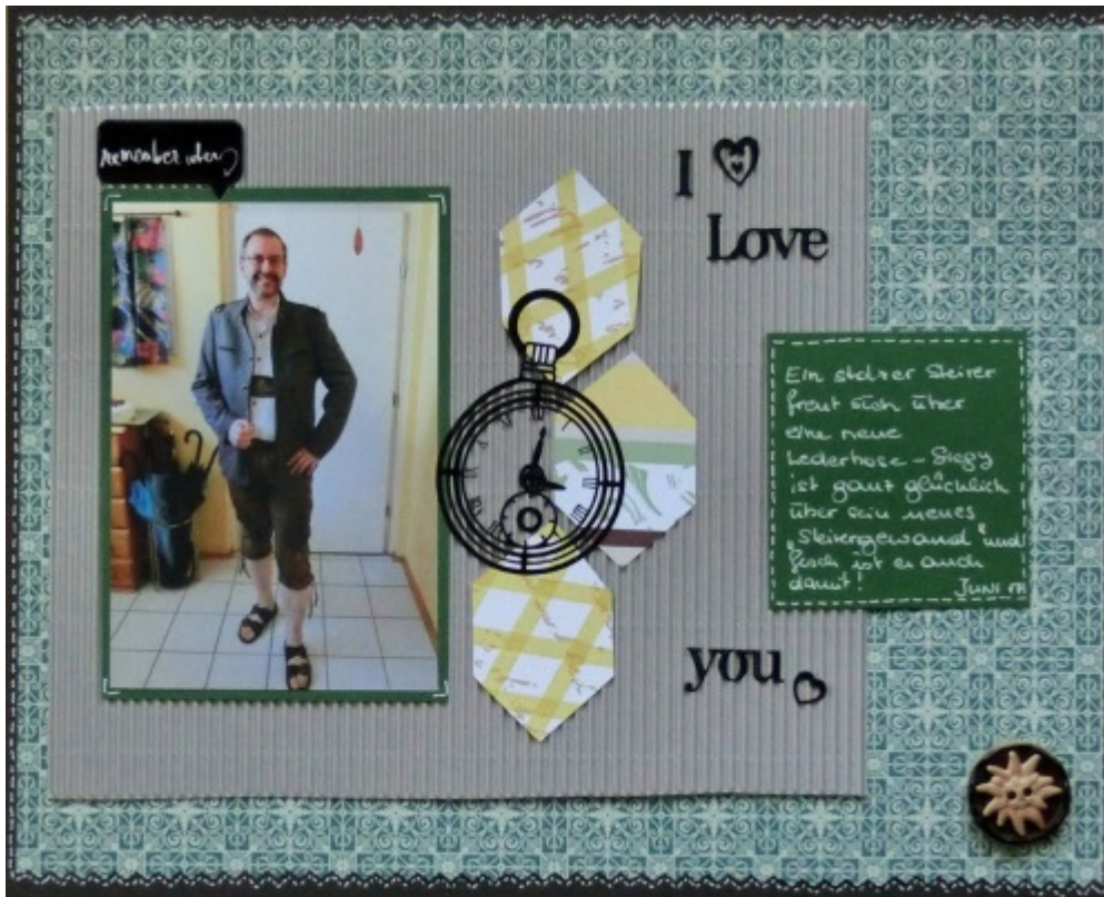
Layout by Susi