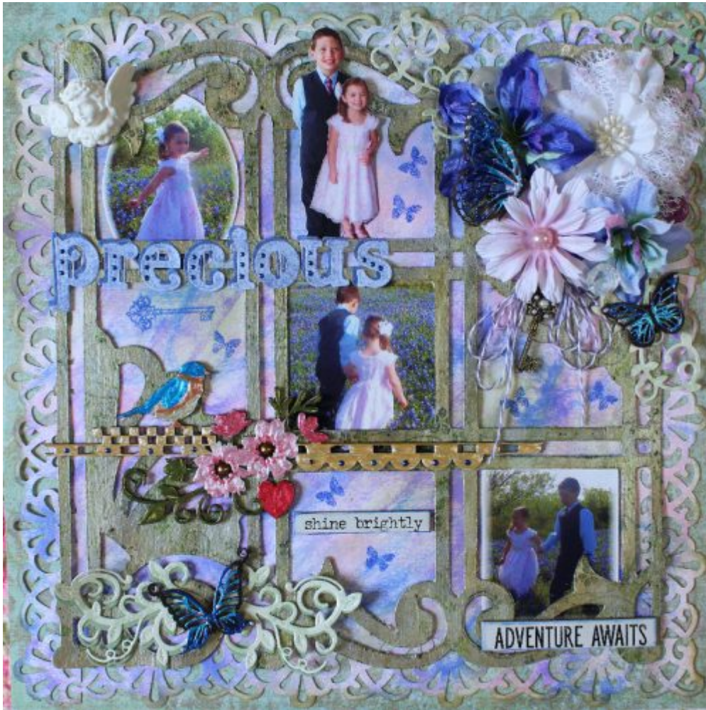
Layout by Elizabeth