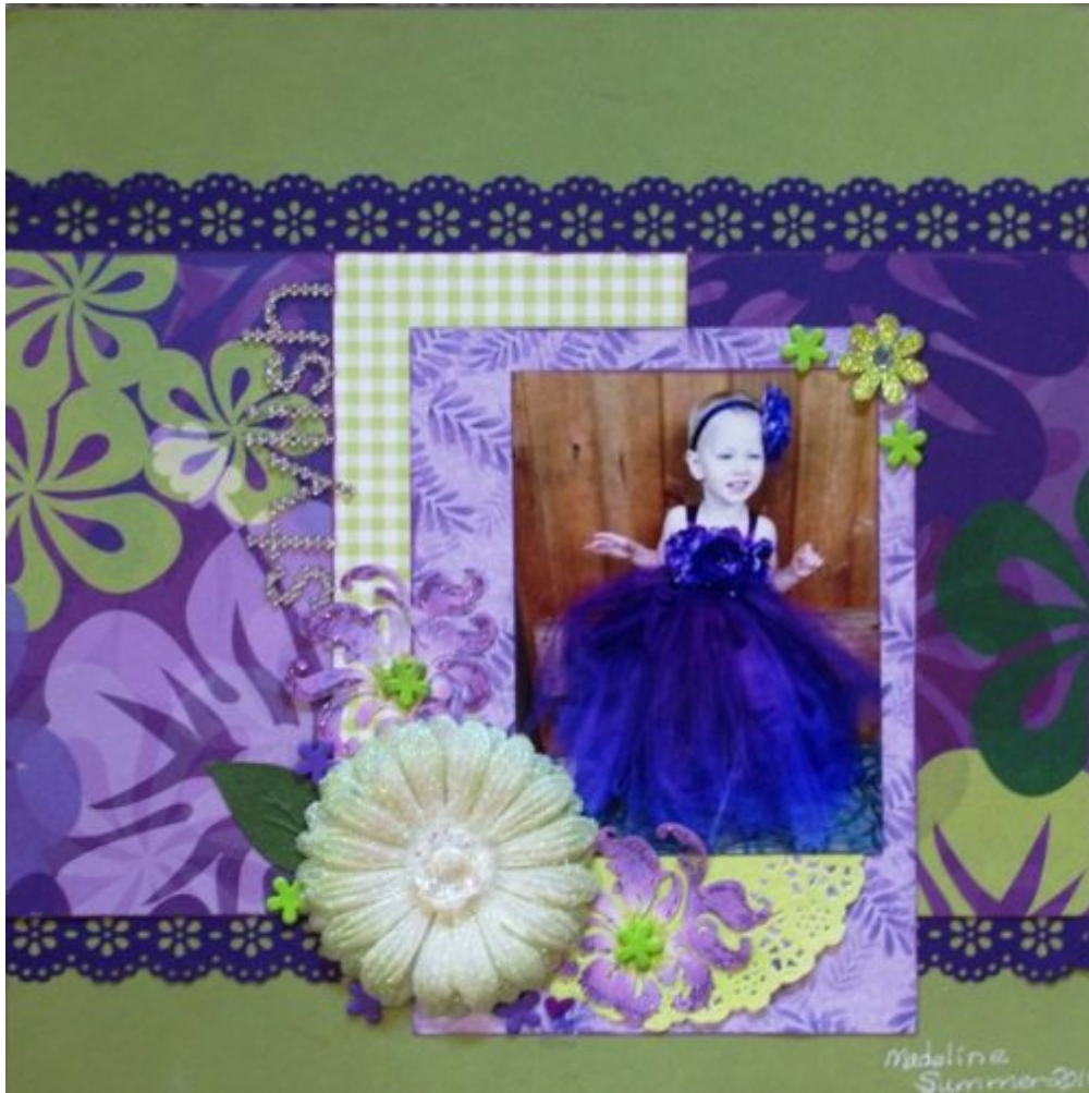
Layout by Susan