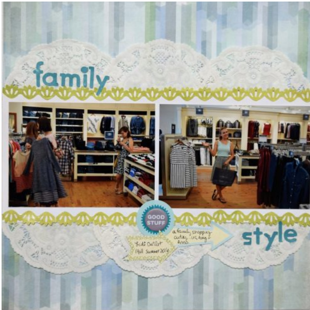
Layout by Mandy