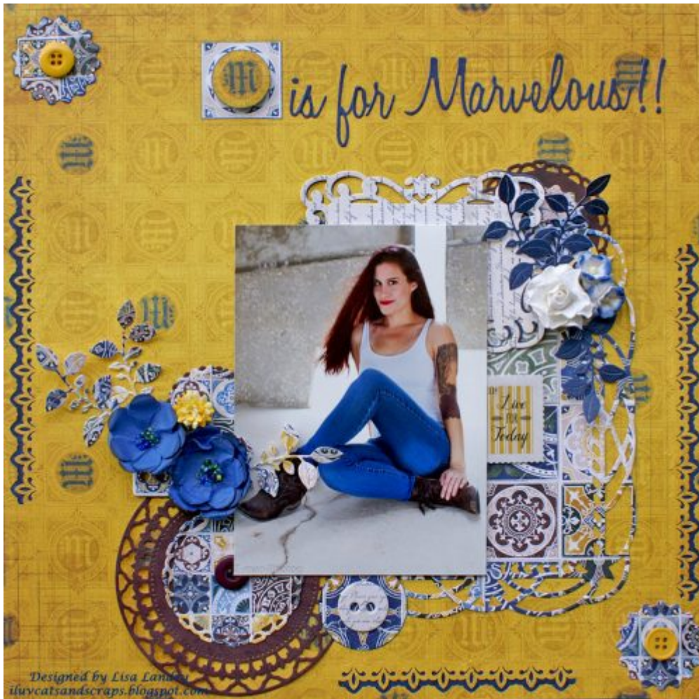
Layout by Lisa