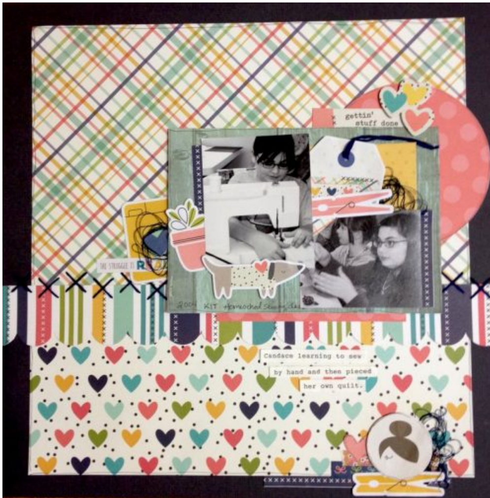
Layout by Tina