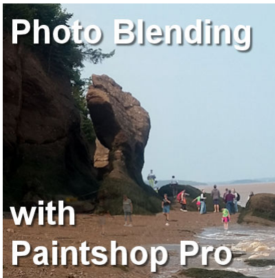
Photo Blending with PaintShop Pro