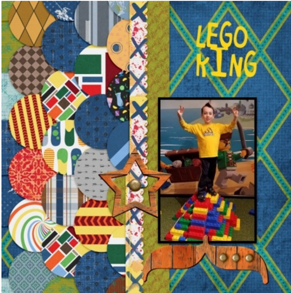
Layout by Nan