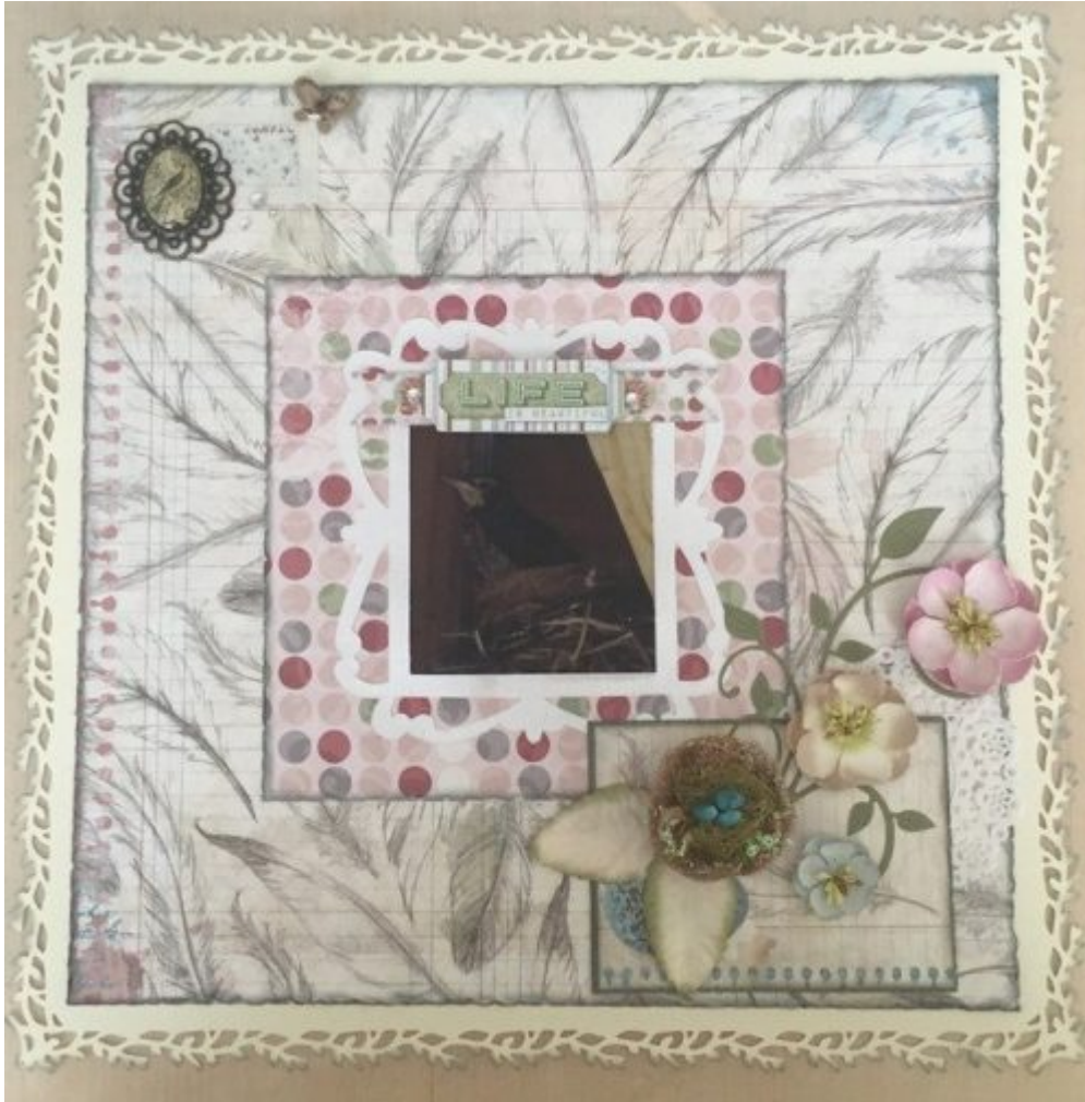
Layout by Kelly