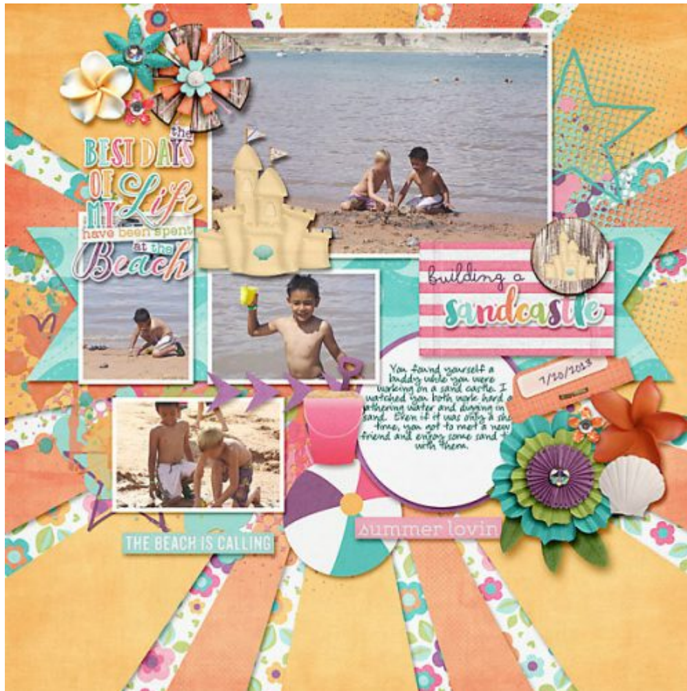
Layout by Ophelia