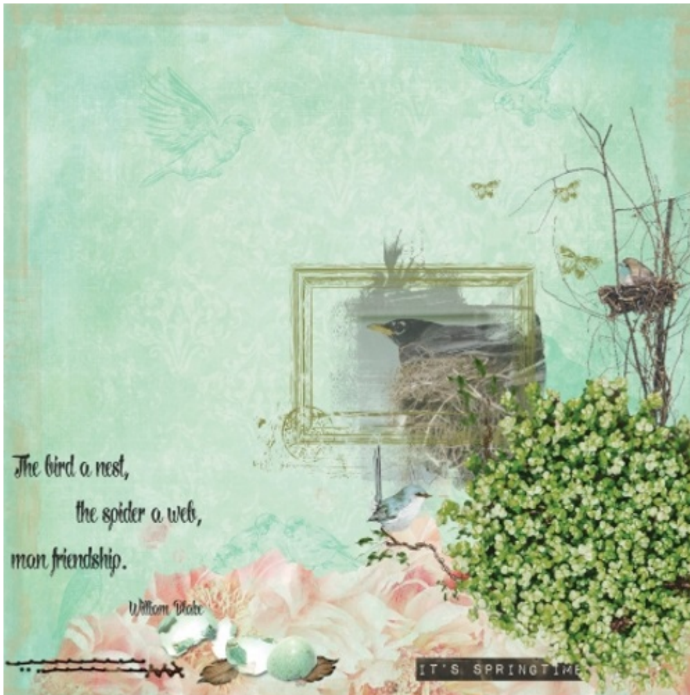
Layout by Elizabeth