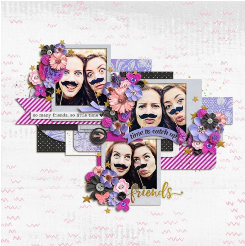
Layout by Biancka