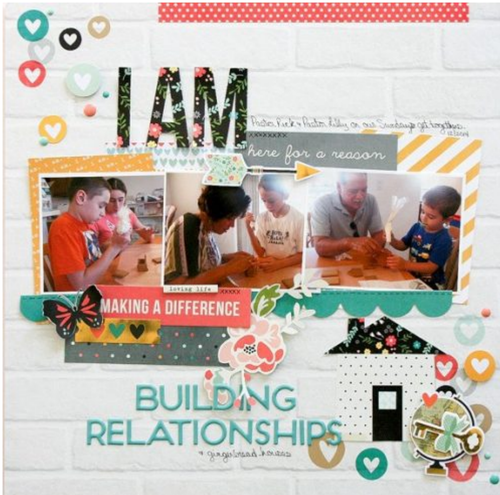
Layout by Wendy