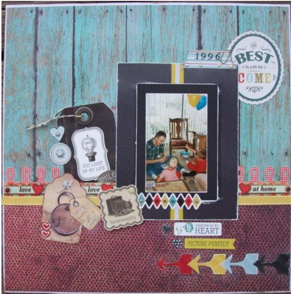
Layout by Jenny