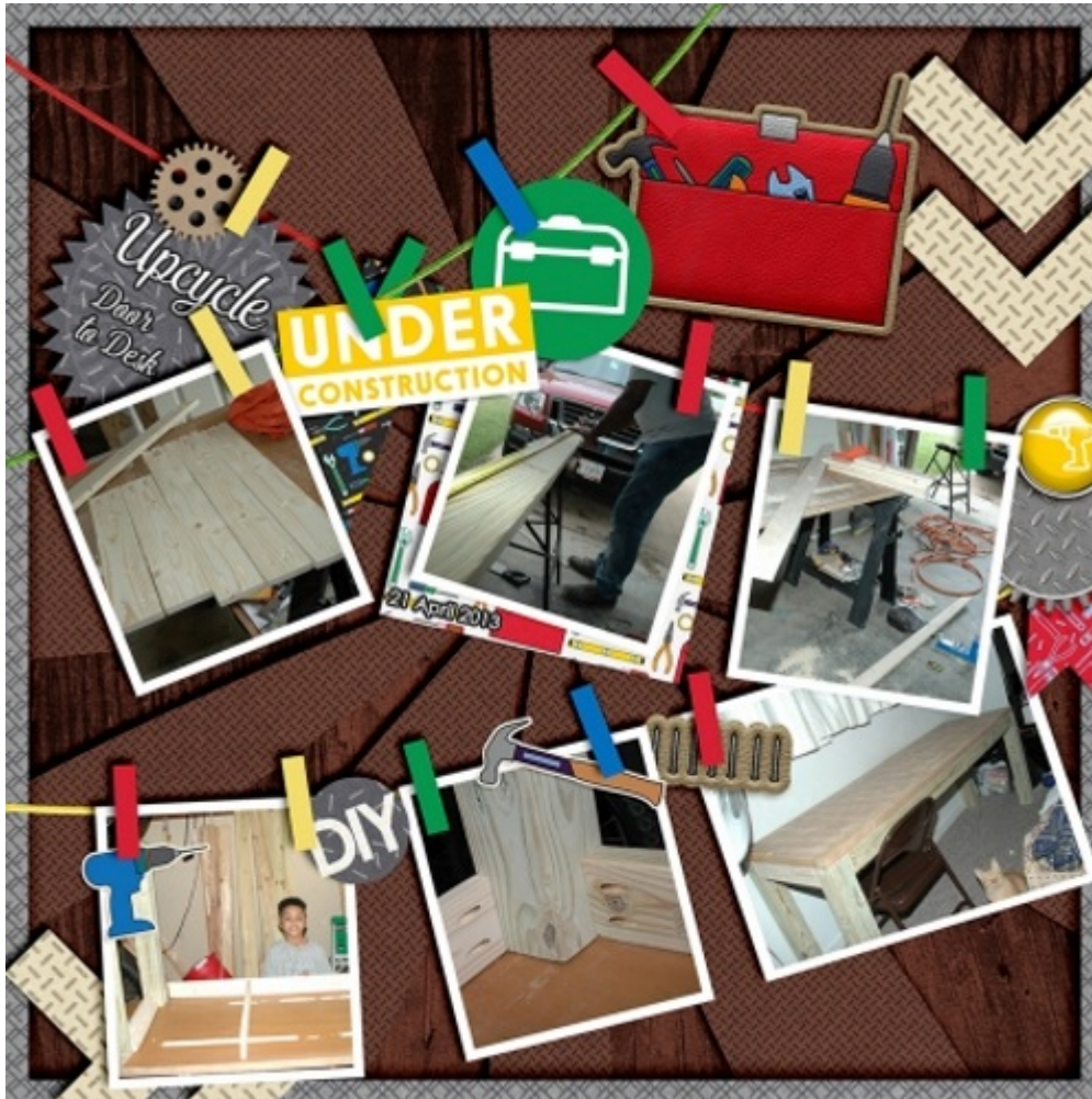
Layout by Tina