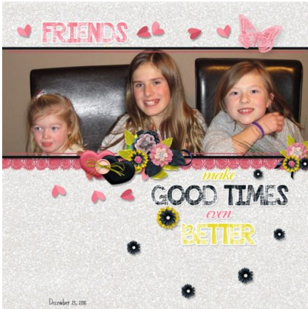
Layout by Renee