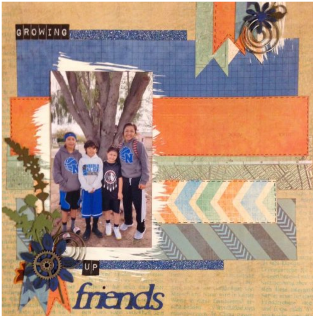
Layout by Deanna

Do you have any picture or story of someone building something? Did you ever build forts out of blankets, chairs, and cushions? Or did you have other types of building toys like Meco or even playdough? Tell the story with a fun scrapbook project!