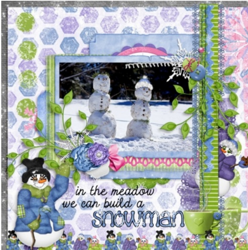
Layout by Anne