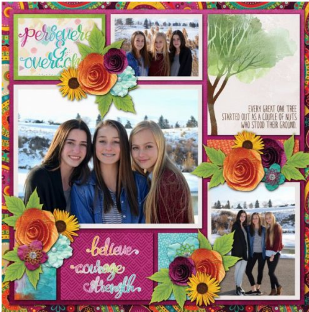
Layout by Teresa