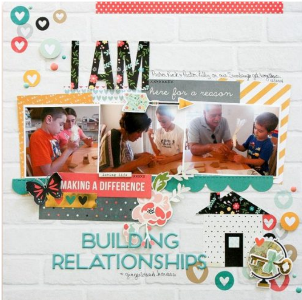
Layout by Wendy