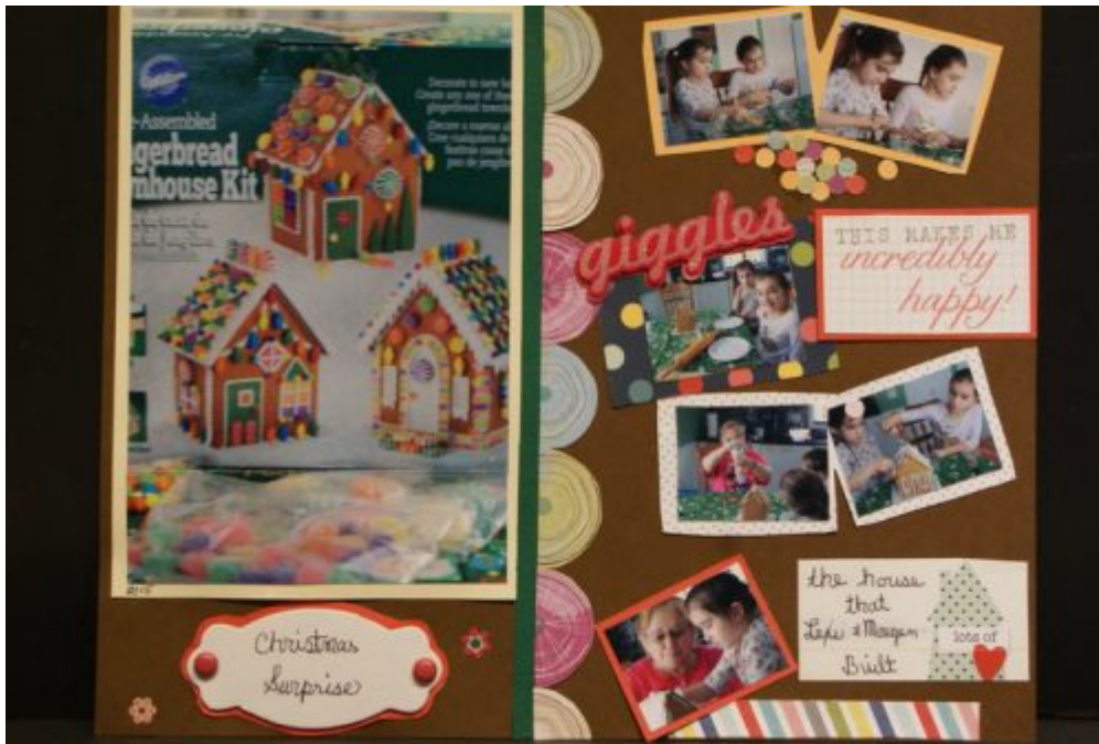
Layout by Linda