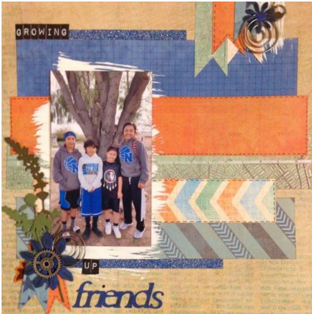
Layout by Deanna

Do you have any picture or story of someone building something? Did you ever build forts out of blankets, chairs, and cushions? Or did you have other types of building toys like Meco or even playdough? Tell the story with a fun scrapbook project!