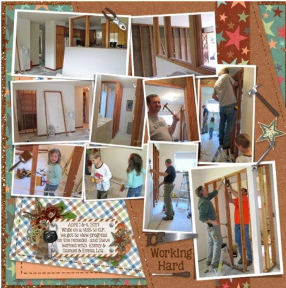
Layout by Anita