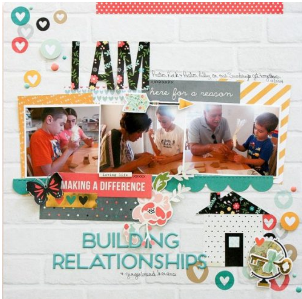
Layout by Wendy