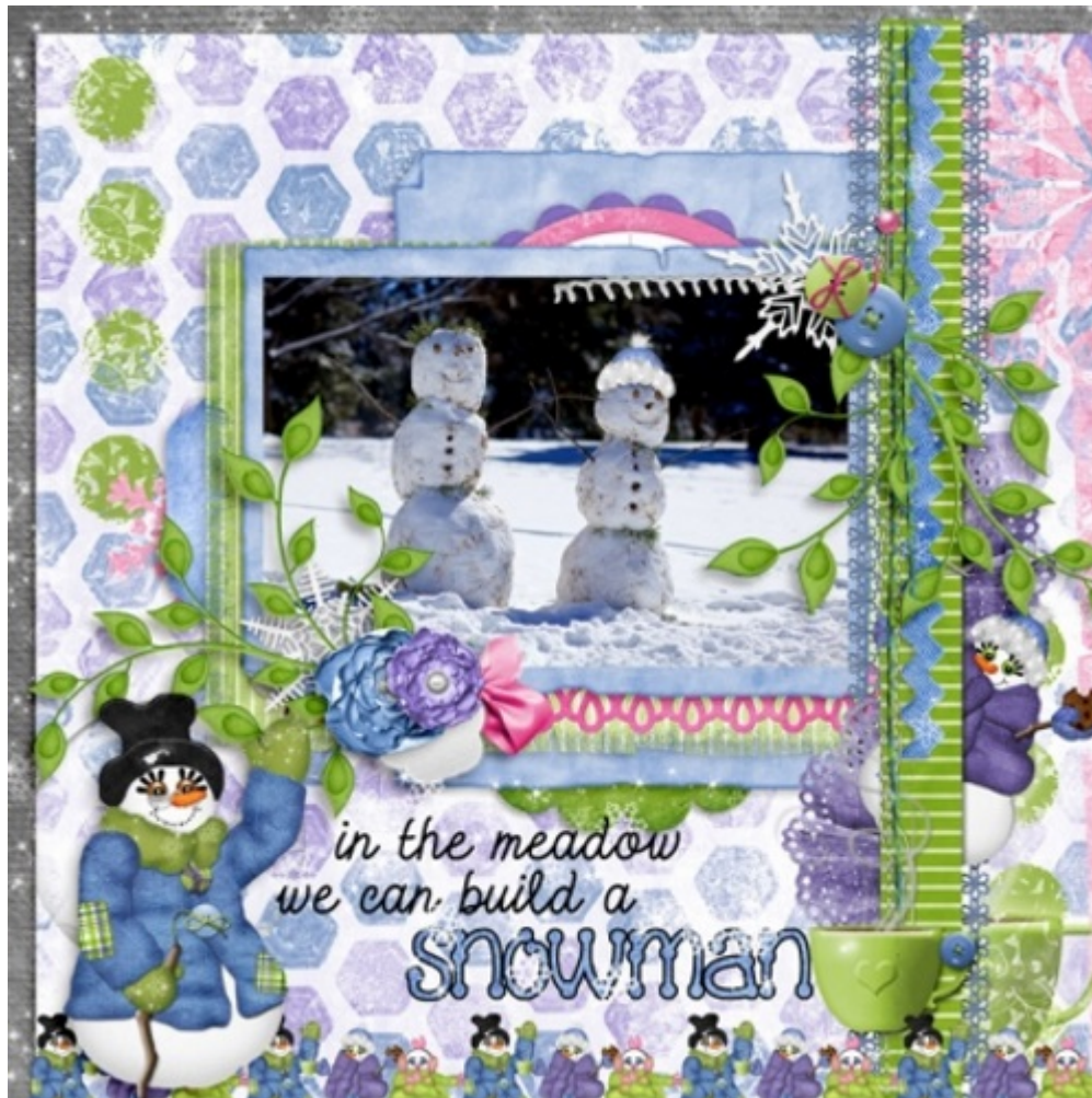
Layout by Anne