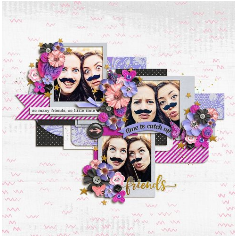
Layout by Biancka