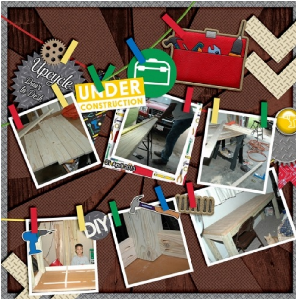
Layout by Tina