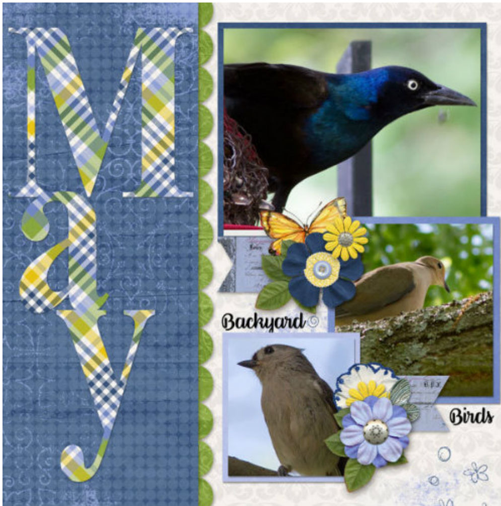
Layout by Elynnia