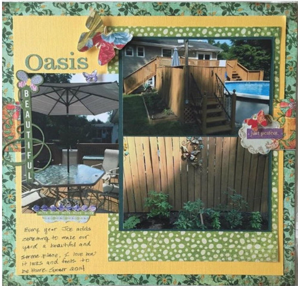
Layout by Christine