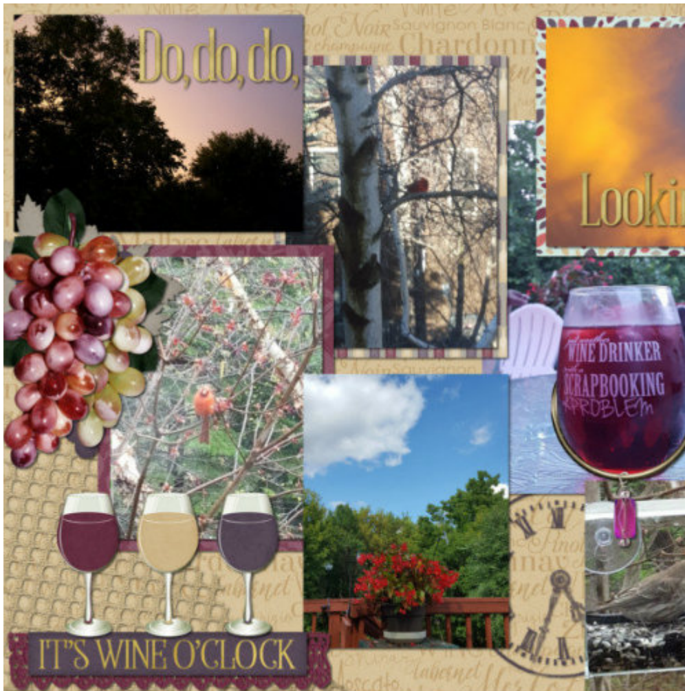
Layout by Minicooper452