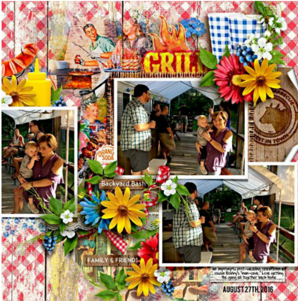
Layout by Bre