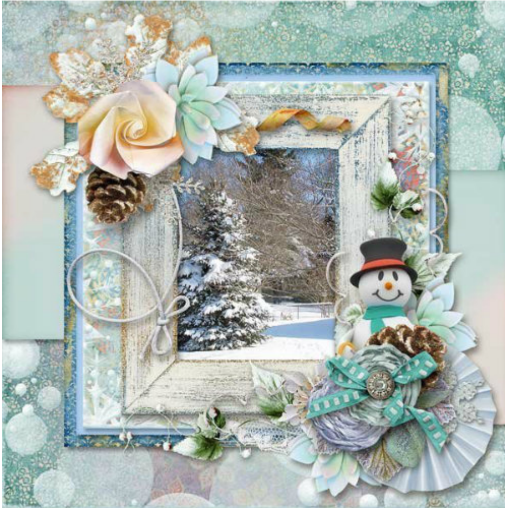
Layout by Kabra