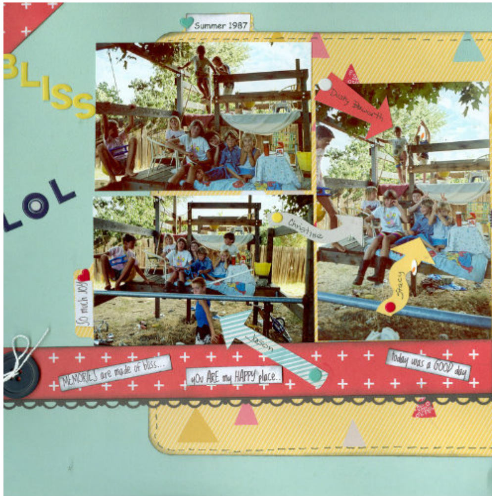
Layout by Pam