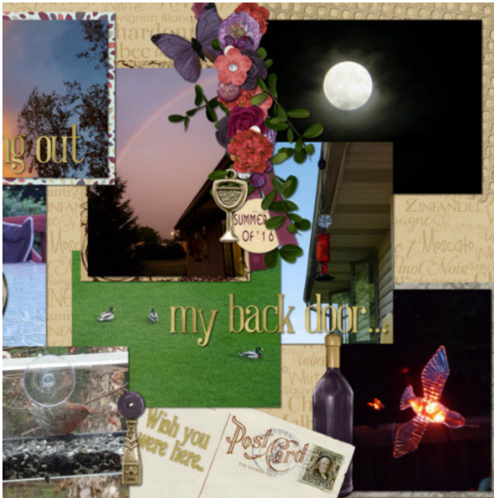
Another by Minicooper452