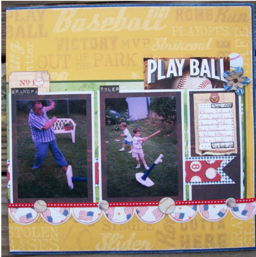
Layout by Justowen