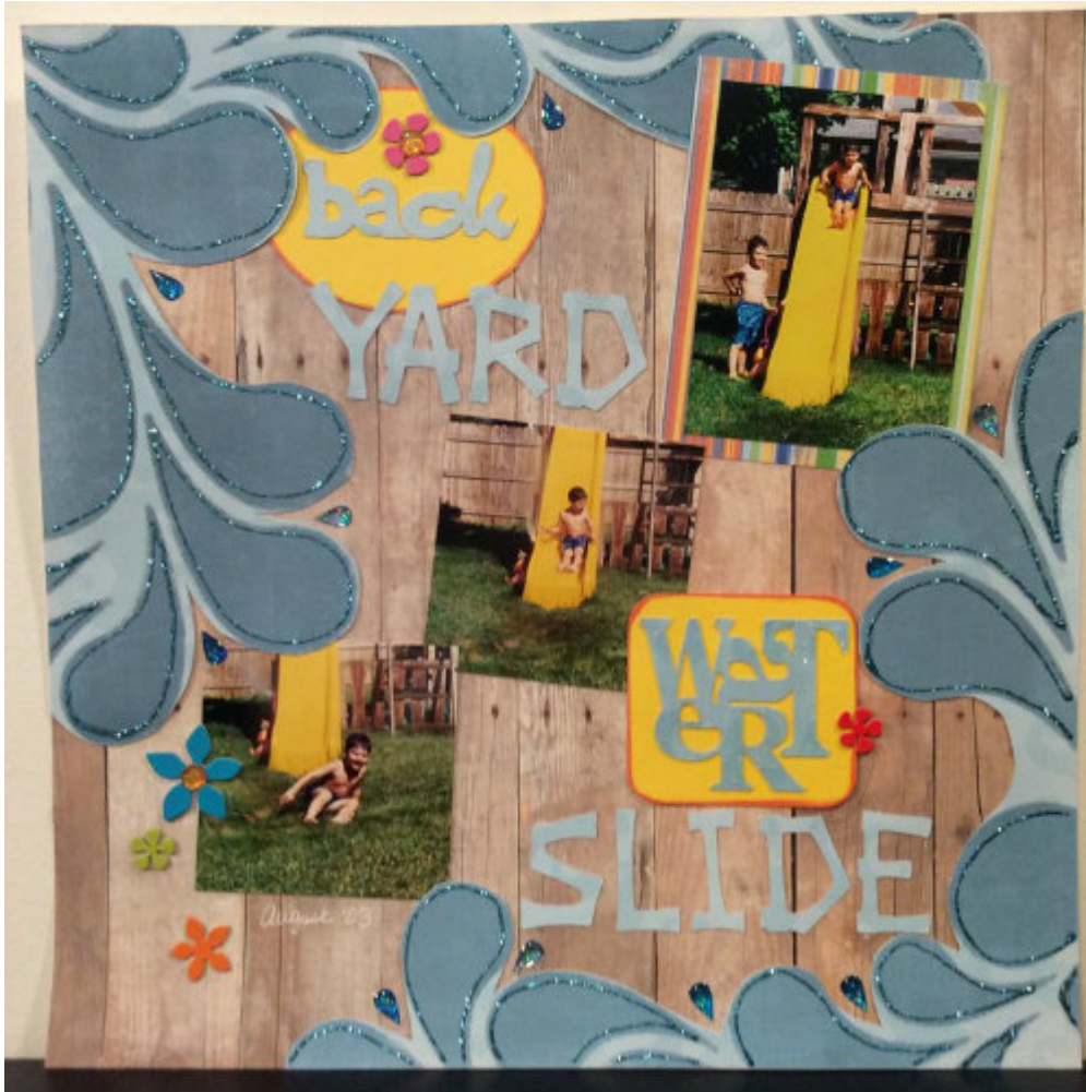
Layout by Pam