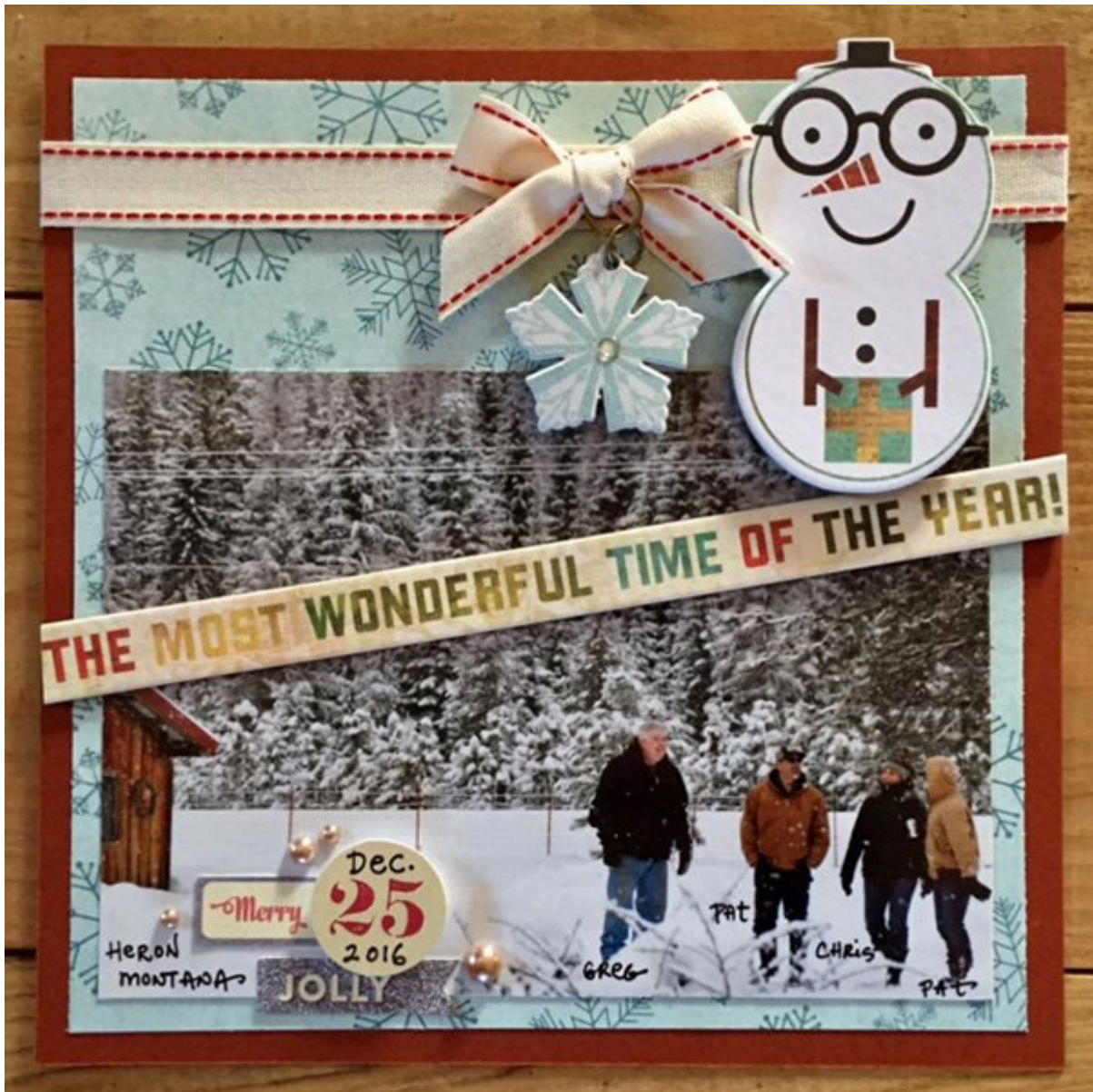
Page by Polly McMillan