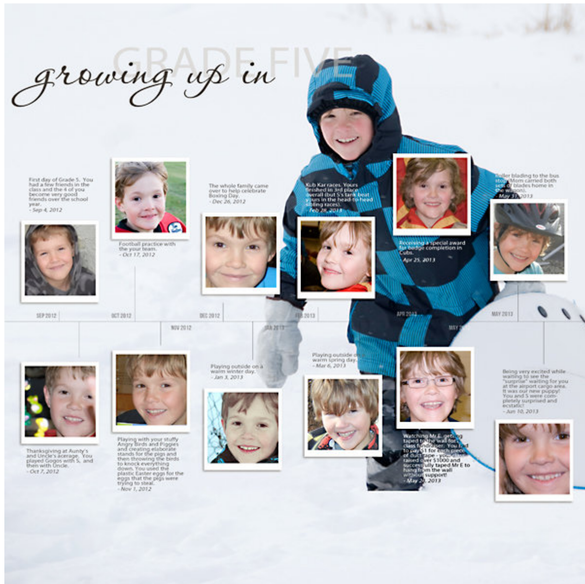
Layout by Heather

Or a timeline of their school experiences.