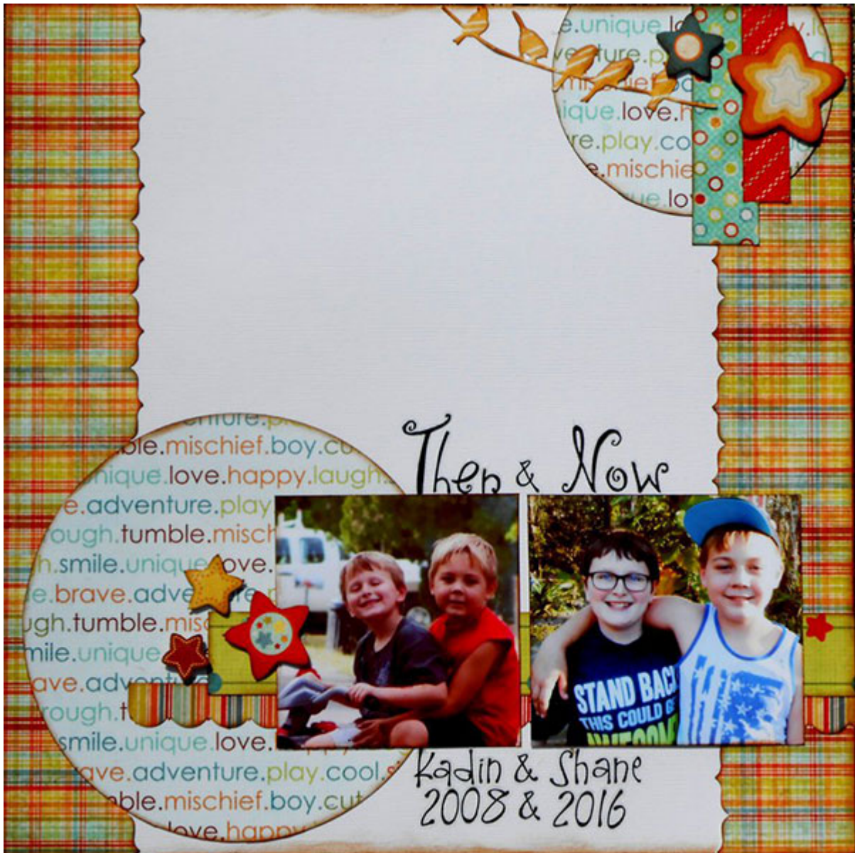
Page by Debbie