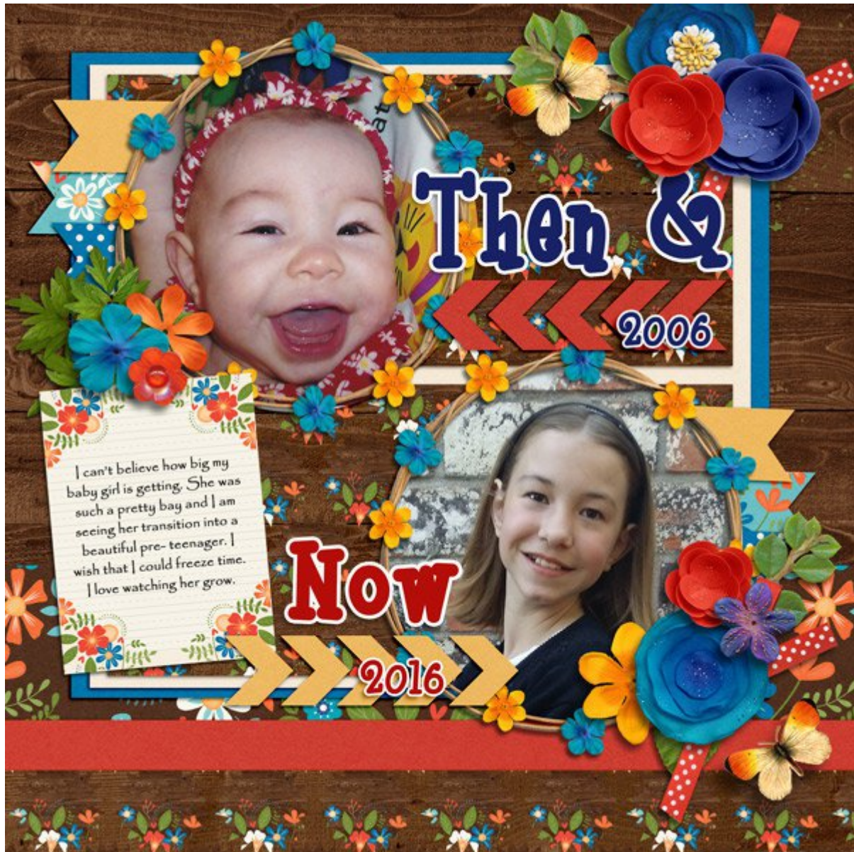
Layout by Jamie