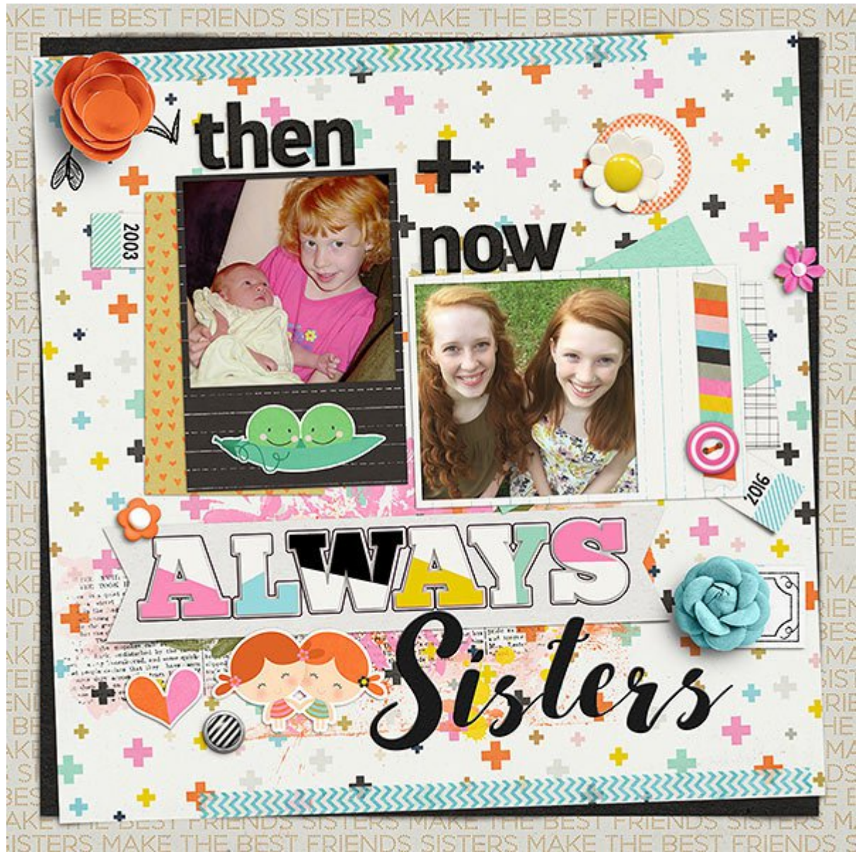
Layout by Keely