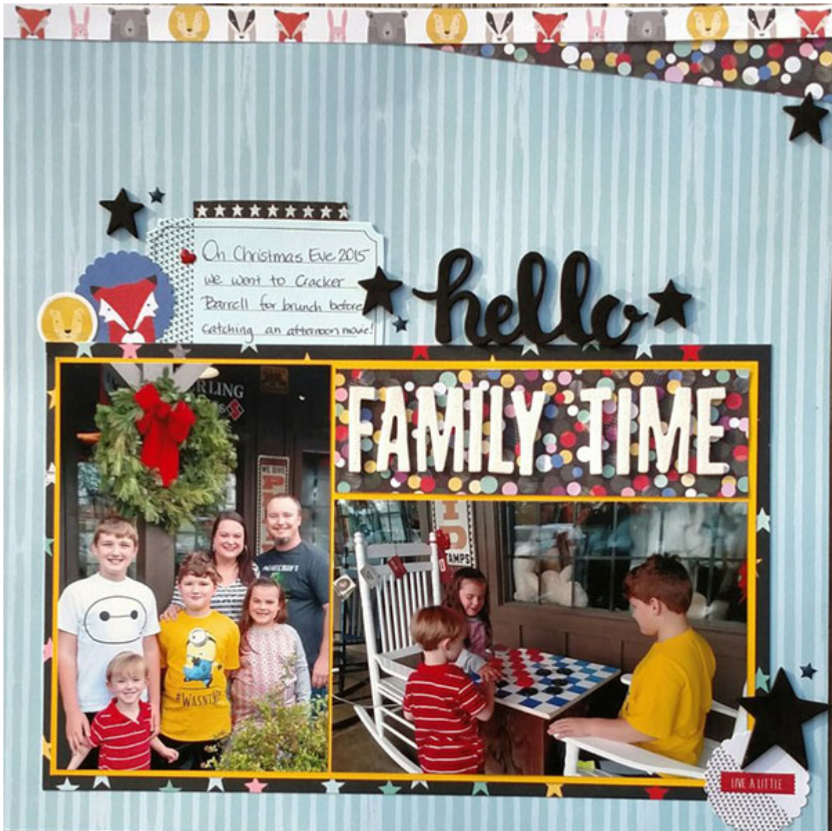
Layout by Amanda Ulmer