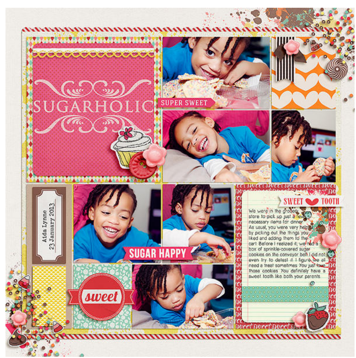
Layout by Tronesia