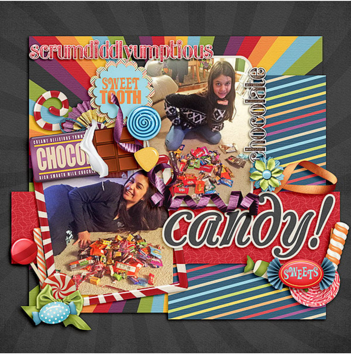
Layout by Cutiejo1

Kids love candies, have you captured them eating their favorites?