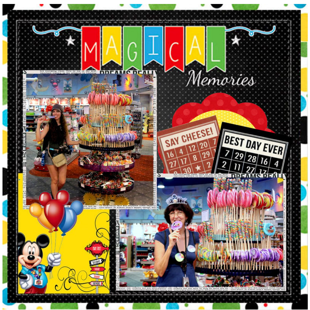
Layout by ELLANVANNIN