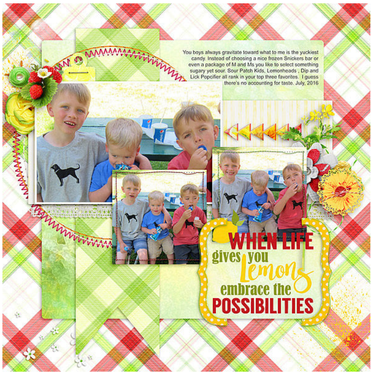
Layout by Beatricemi

Lunch or dinner will not be complete without some sweets!