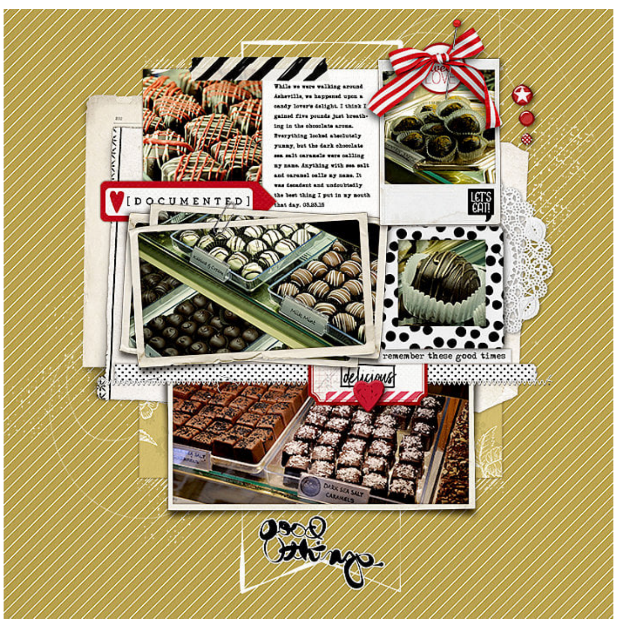
Layout by Earlofoxford