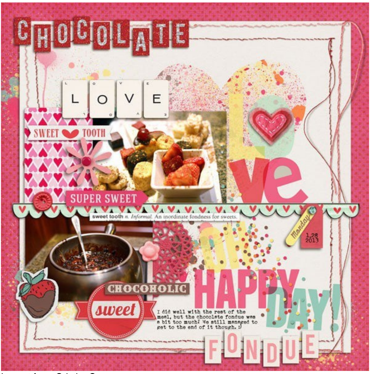
Layout from CristinaC