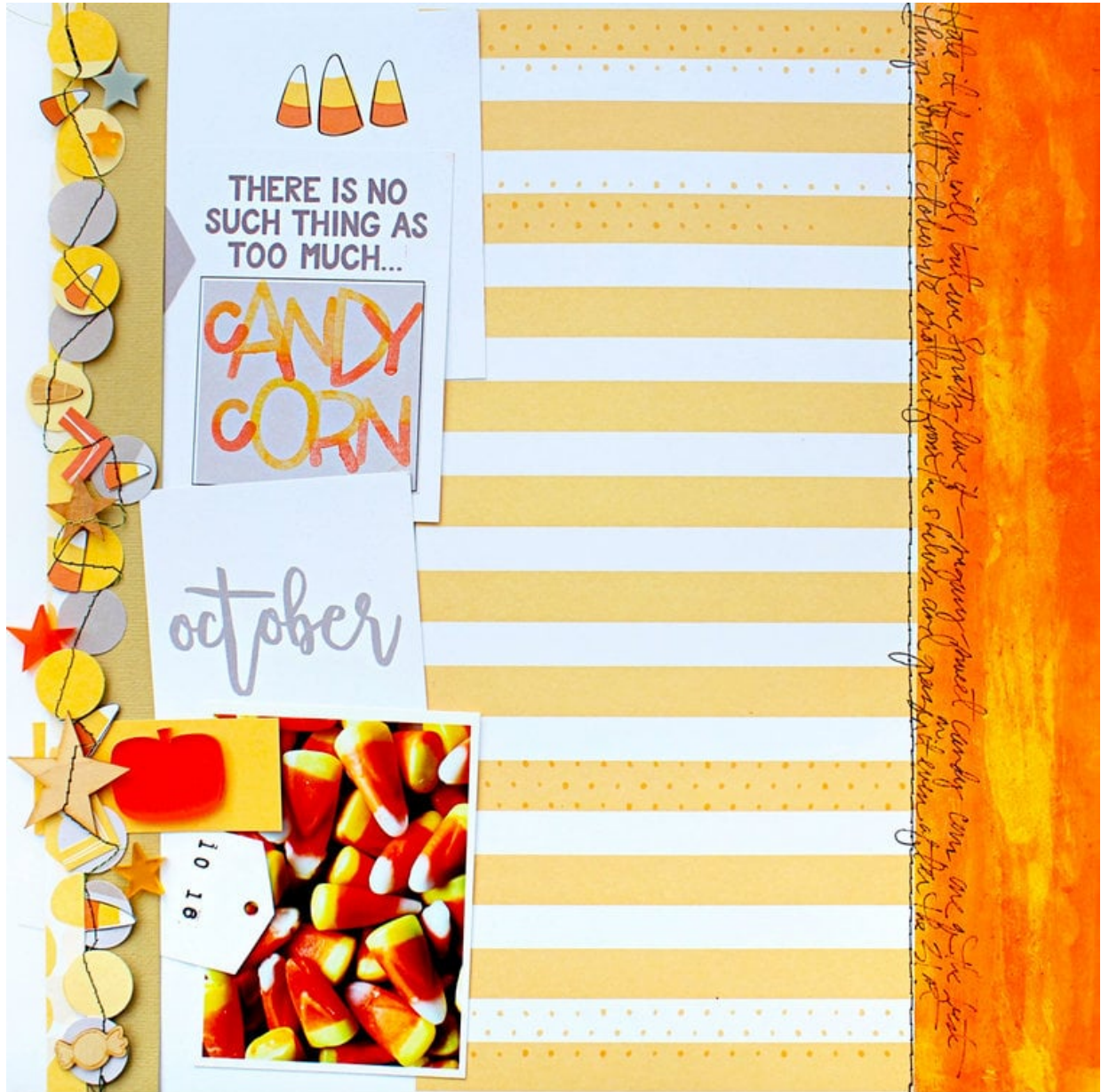
Elle's Studio Layout by Jill.S