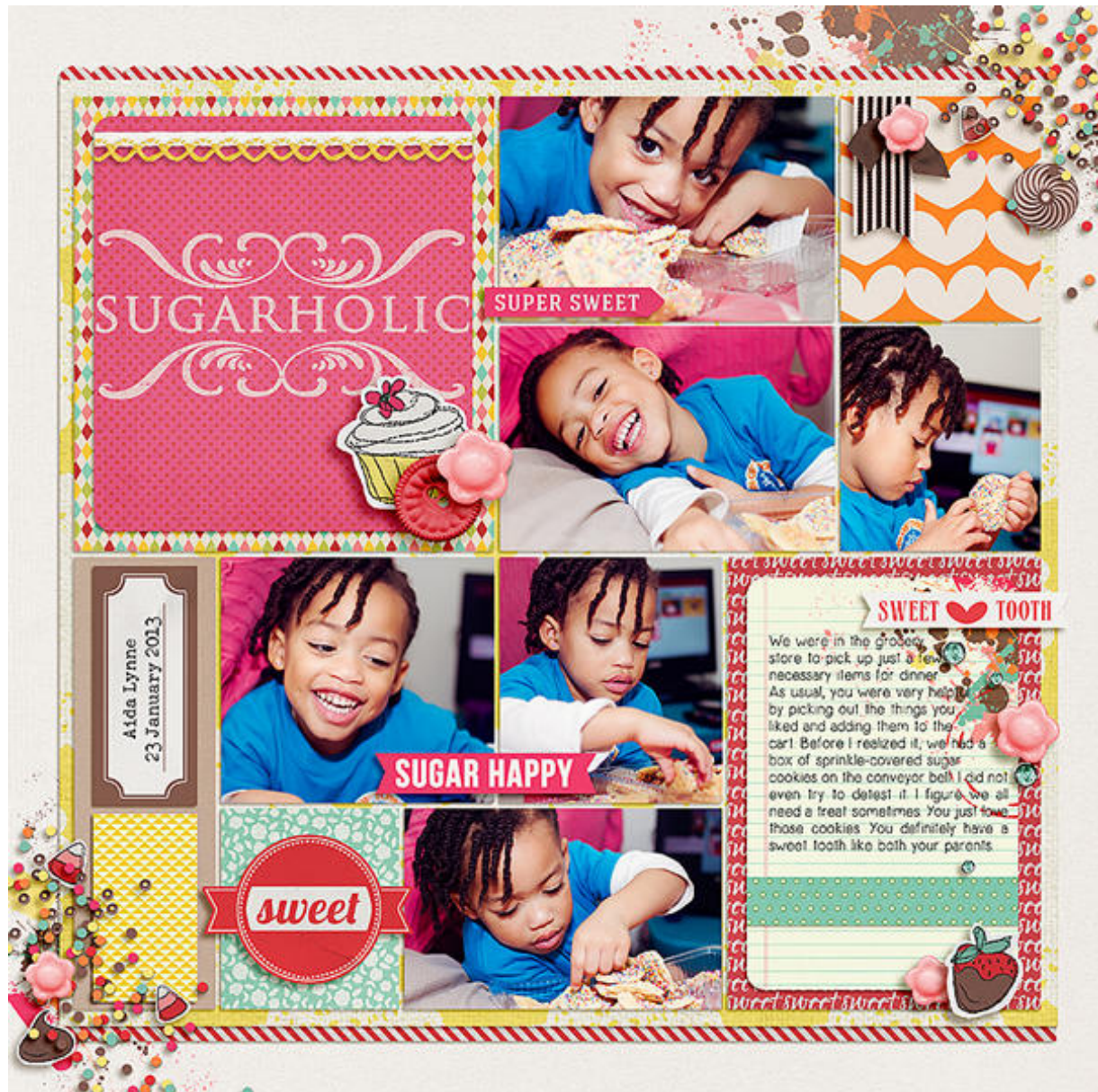
Layout by Tronesia