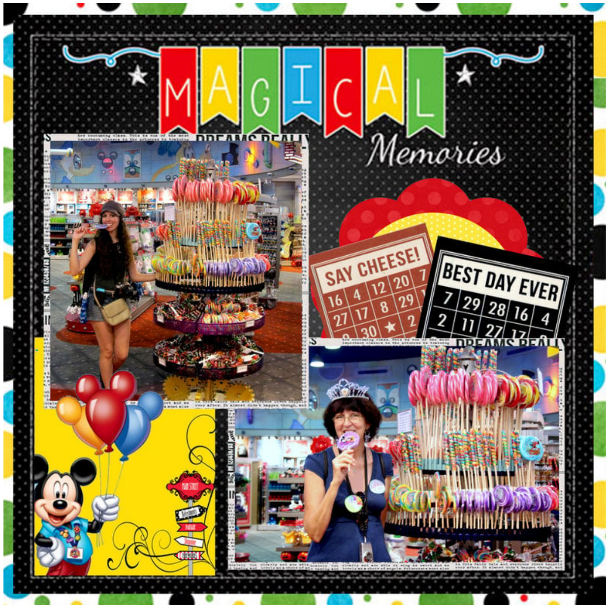
Layout by ELLANVANNIN