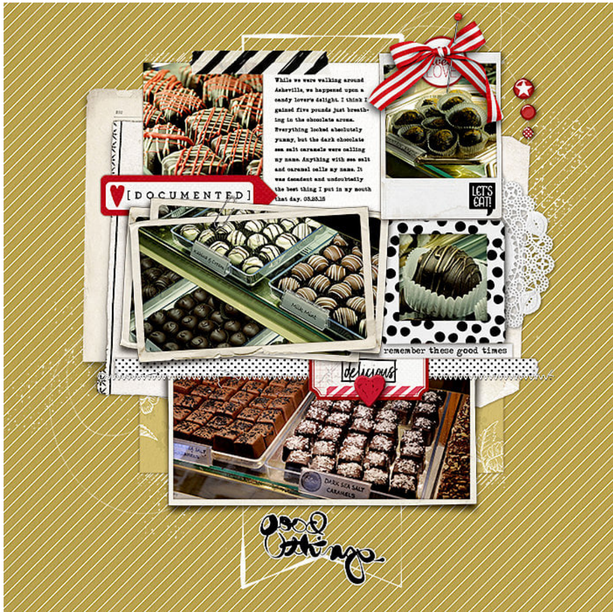
Layout by Earloxford