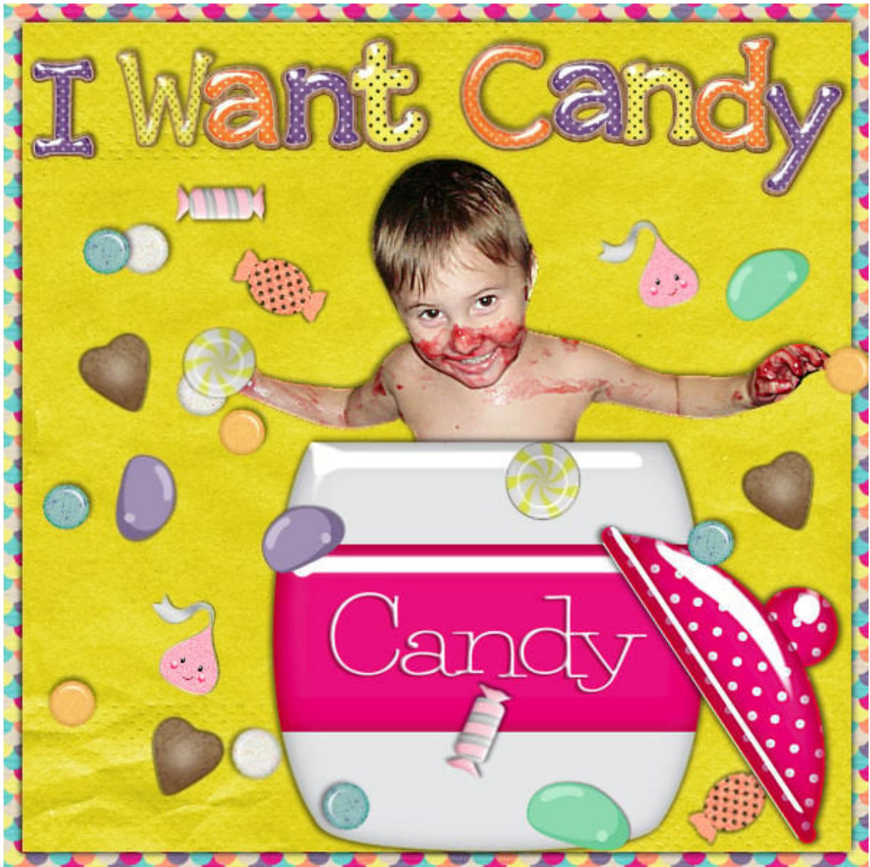
Layout by JenniferJ