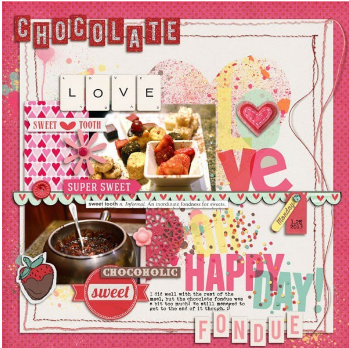
Layout from CristinaC