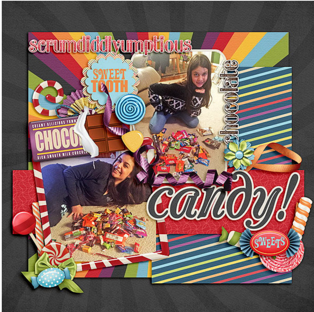
Layout by Cutiejo1

Kids love candies, have you captured them eating their favorites?