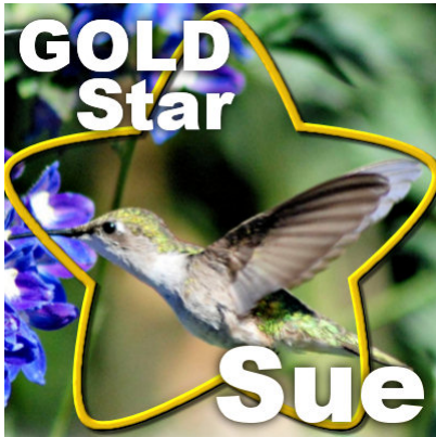
Gold Star – Sue