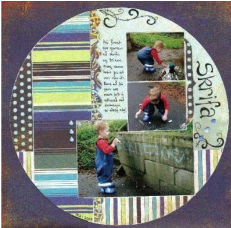
Layout by Hulda P

What will you write about, in your layout about writing? These are only suggestions because I am sure you can find many more reasons to create a layout around a "writing" theme. What other ideas would you think of? Share them in the comments below and if you already have a "writing" layout, share a link