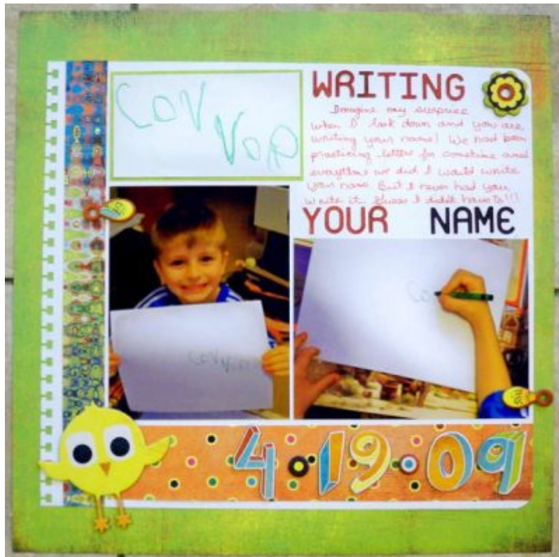
Layout by Mindyradio