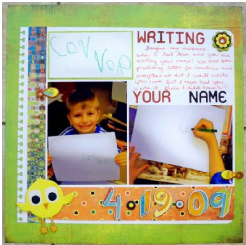
Layout by Mindyradio