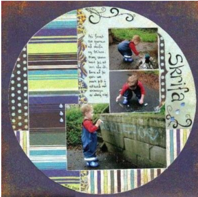
Layout by Hulda P

What will you write about, in your layout about writing? These are only suggestions because I am sure you can find many more reasons to create a layout around a "writing" theme. What other ideas would you think of? Share them in the comments below and if you already have a "writing" layout, share a link