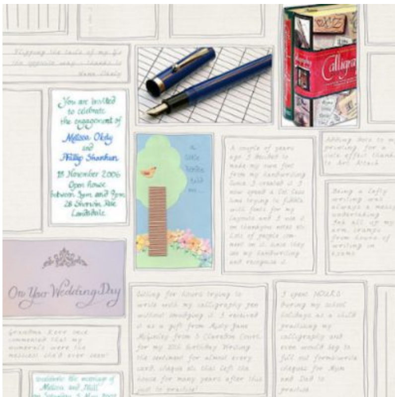
Layout by Melissa Shanhan

But if you are doing calligraphy, remember to practice.