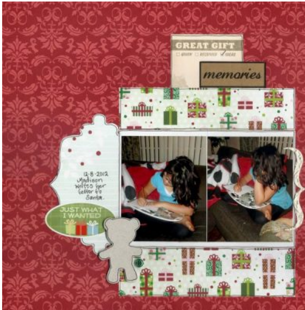
Layout by Doreena