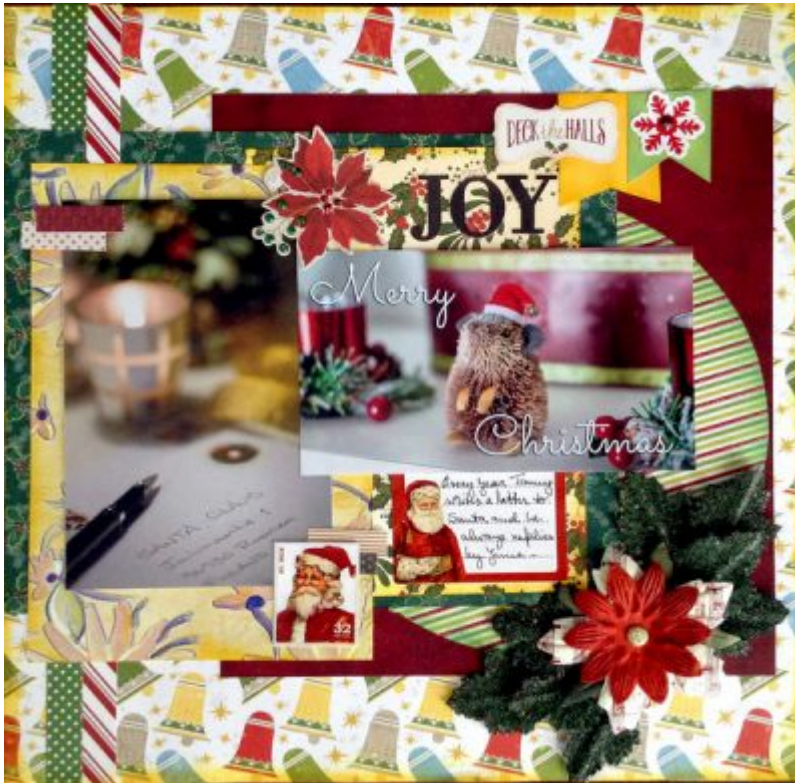
Layout by Ellanvannin