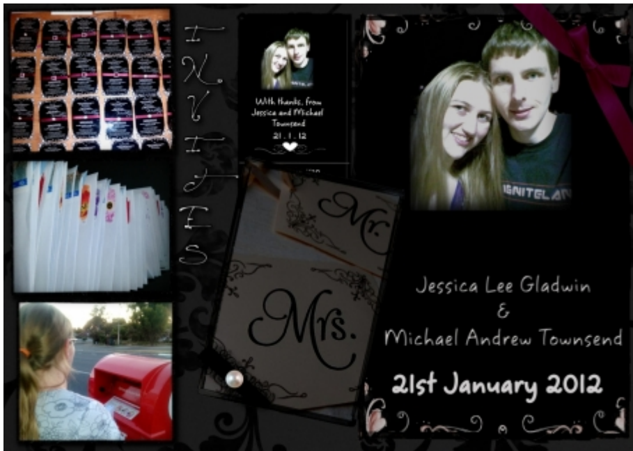
Layout by Jess Townsend

But if you are doing calligraphy, remember to practice.